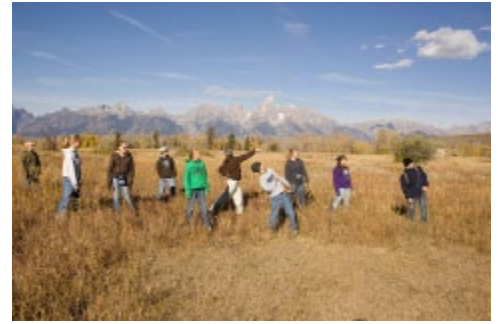
Youth enjoying the outdoors.

Work with project partners to determine the feasibility of trail creation and possible alignments. Provide assistance in locating funding and expertise in brochure and map development.