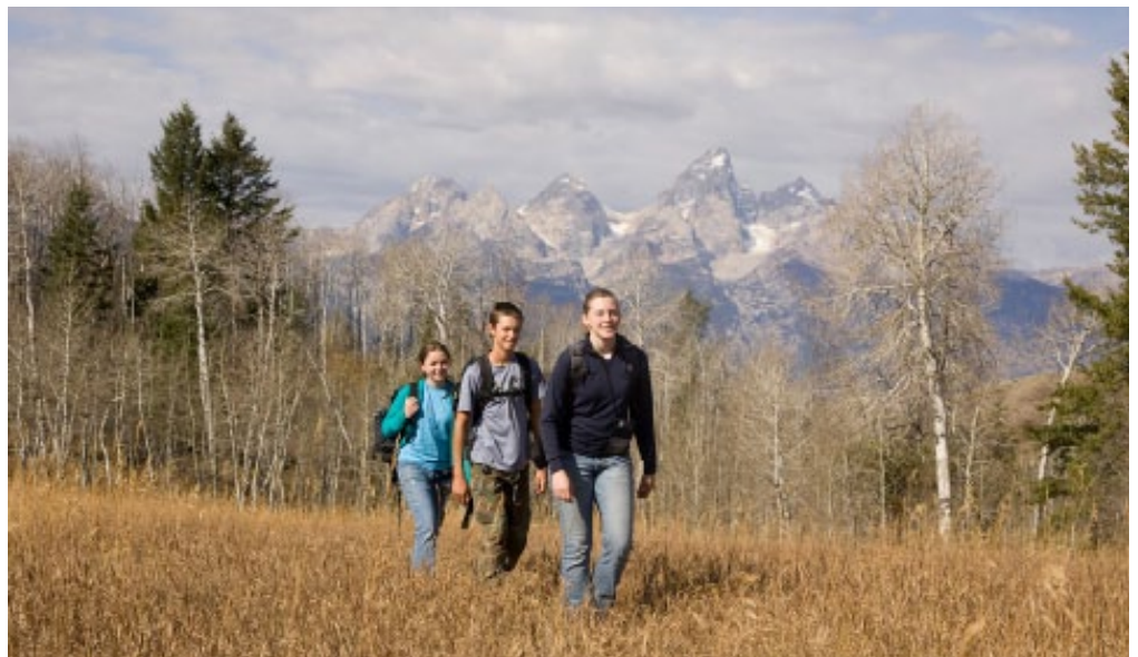
Young hikers in Teton country.

- 2010 Survey on youth and the outdoors Wyoming Youth Congress on Children and Nature