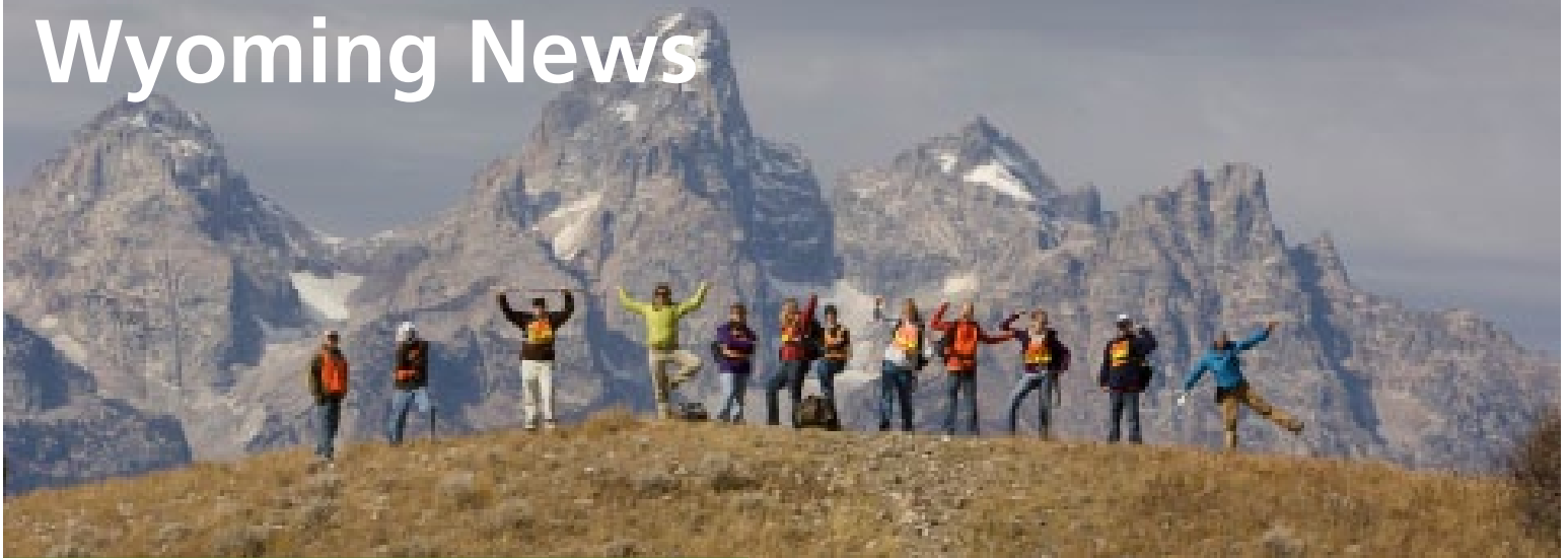
Wyoming youth at the Second Wyoming Youth Congress