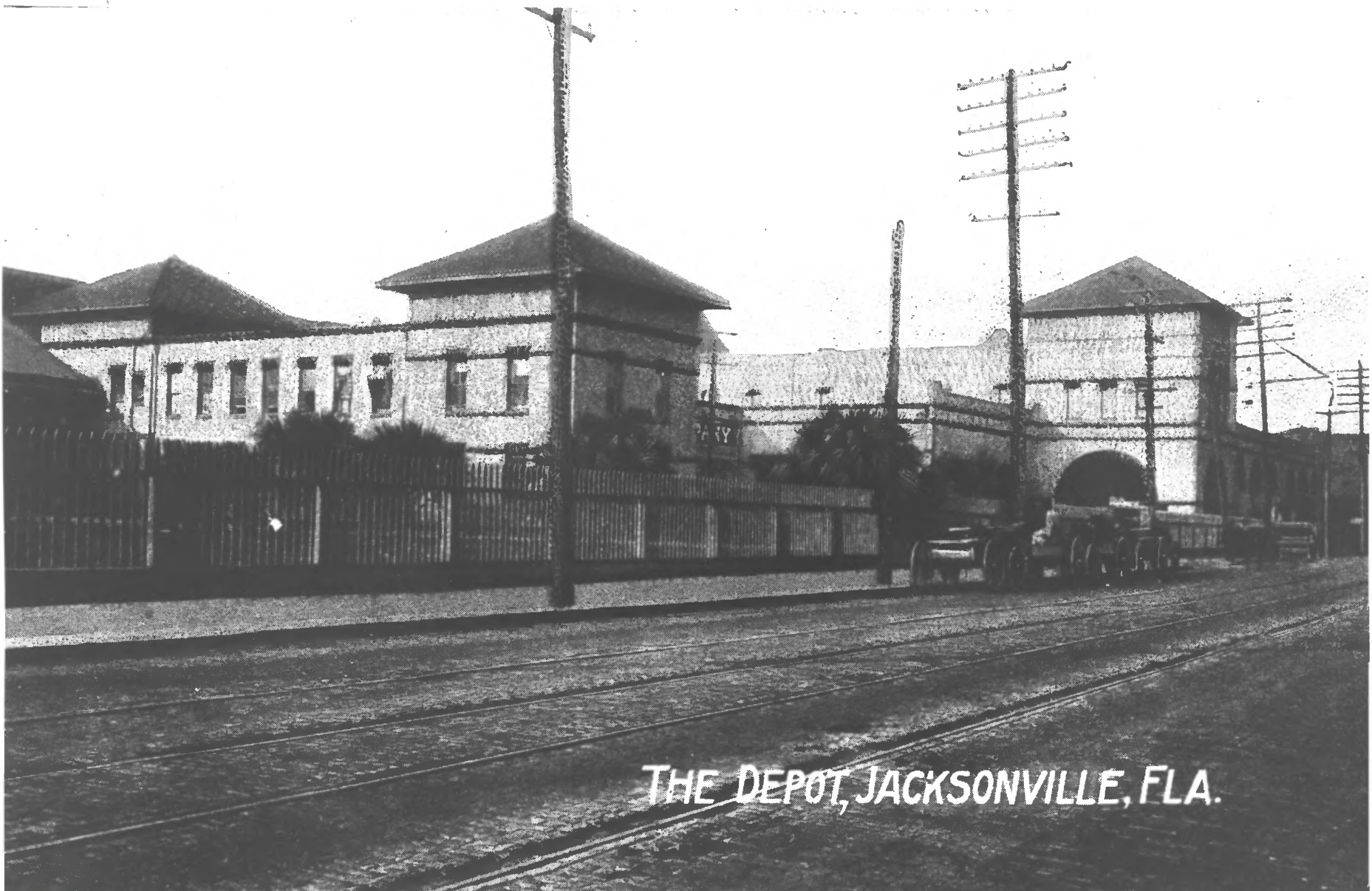
THE DEPOT, JACKSONVILLE, FLA.