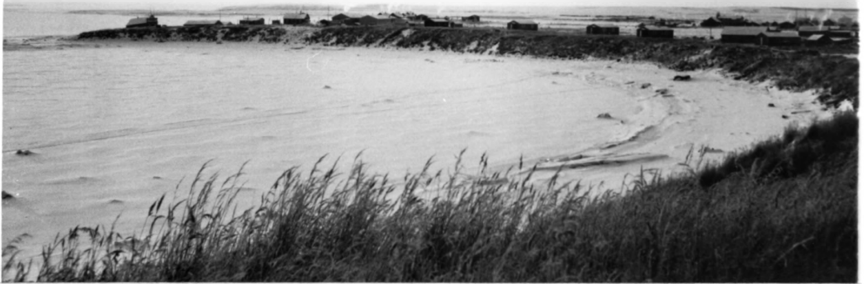
Redoubt St. Michael Site, Parks,