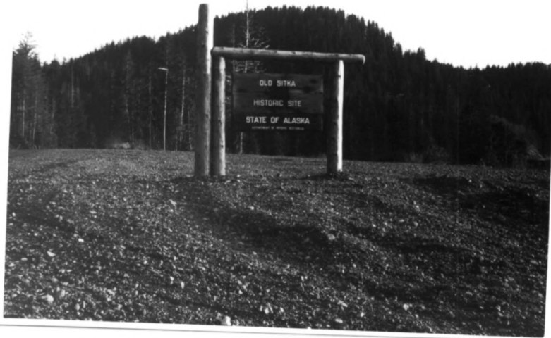
OLD SITKA SCENES TAKEN IN APRIL, 1967 SHOW GRAVEL OPERATIONS AT THAT TIME.