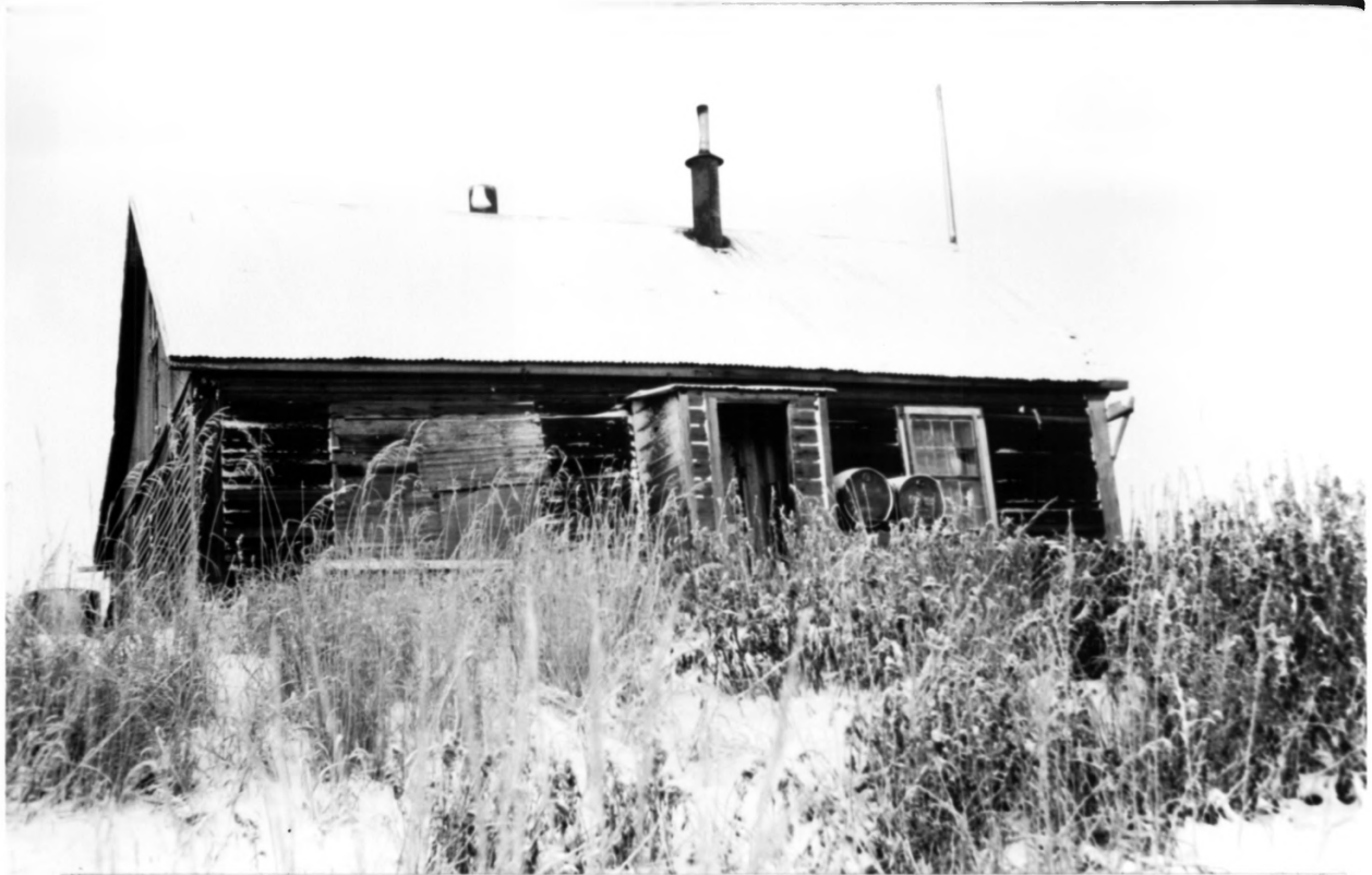
Redoubt St. Michael Site (East house of 3 purportedly Russian-built), St. Michael, Alaska