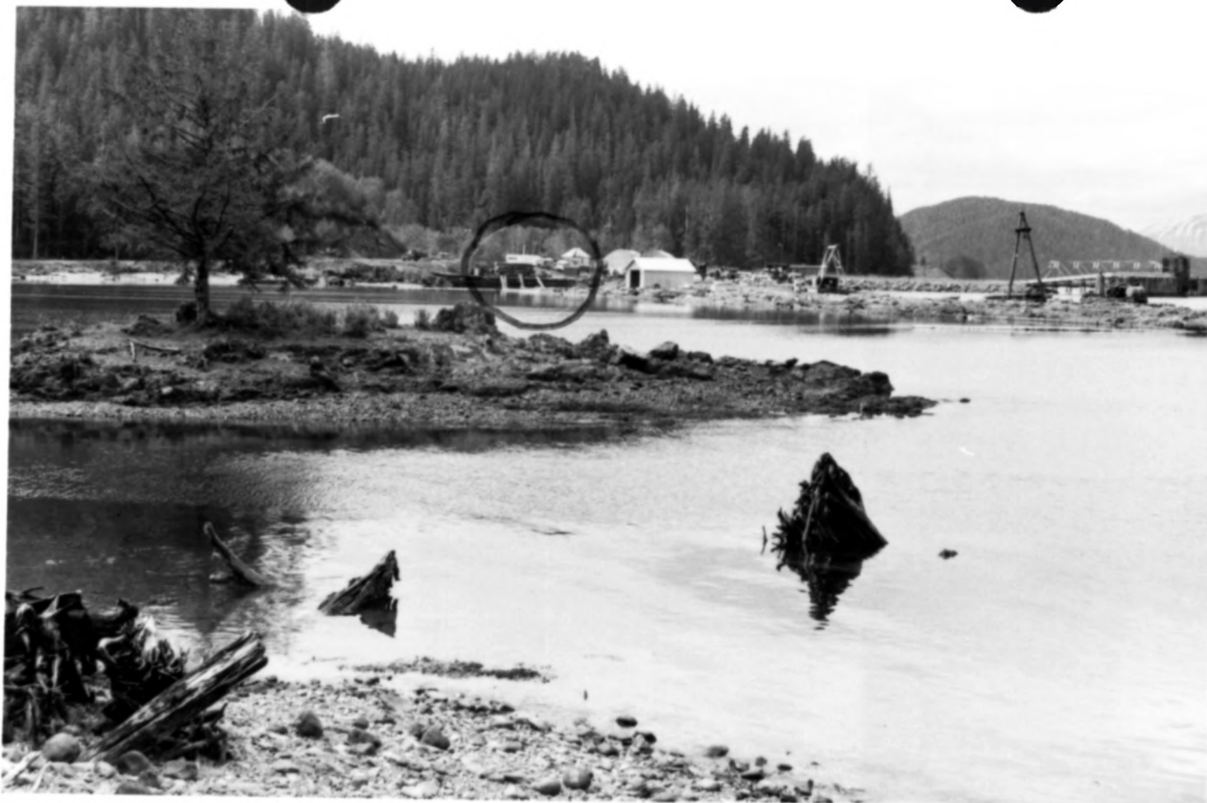
LOG DUMP AND BOOM AREA (5168)