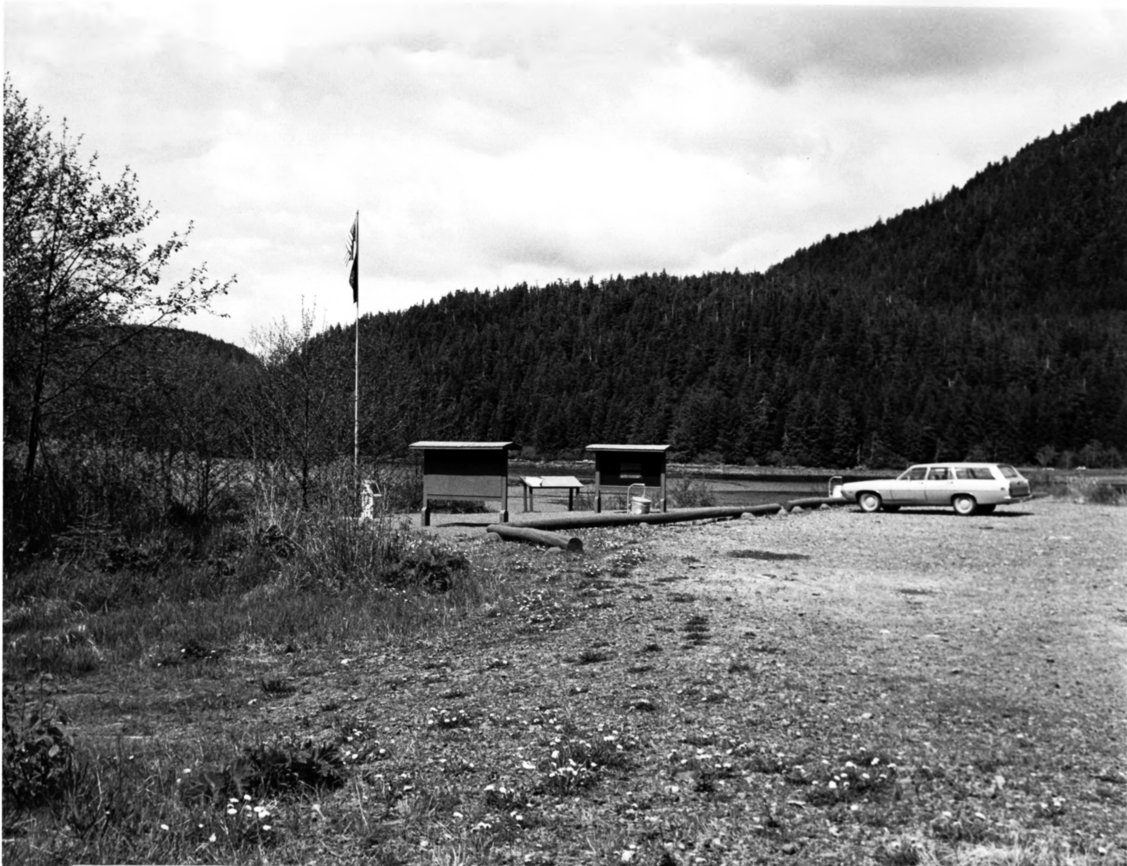
Redoubt St. Archangel Michael Site (Old Sitka), vic. Sitka, Alaska, Alaska Division of Parks, 1972