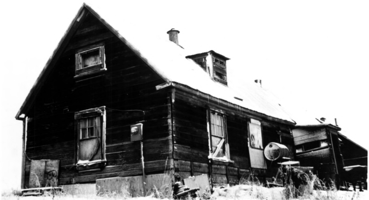
Redoubt St. Michael Site (west house of 3 purportedly Russian-built), St. Michael, Alaska, Alaska Division of Parks, 1975