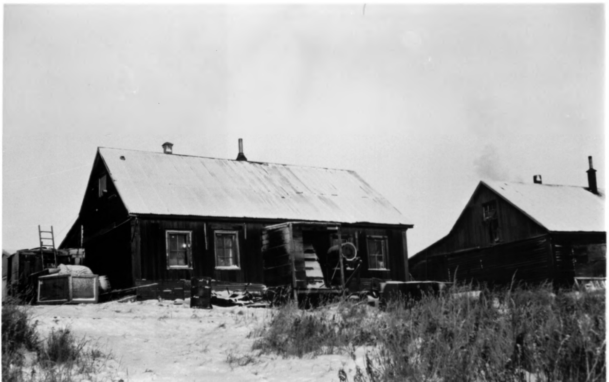
Redoubt St. Michael Site, St. Michael, Alaska,