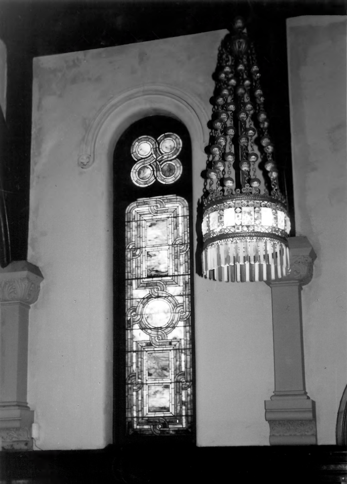
WILLARD MEMORIAL CHAPEL-WELCH MEMORIAL HALL Auburn, New York Chandelier and window, Willard Memorial Chapel