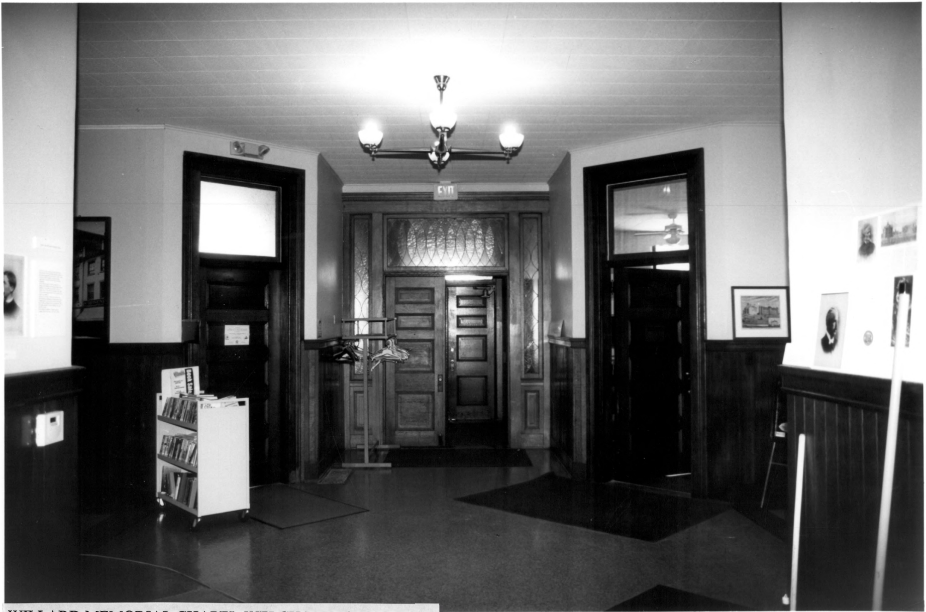
WILLARD MEMORIAL CHAPEL-WELCH MEMORIAL HALL Auburn, New York Central hall of Welch Memorial Hall