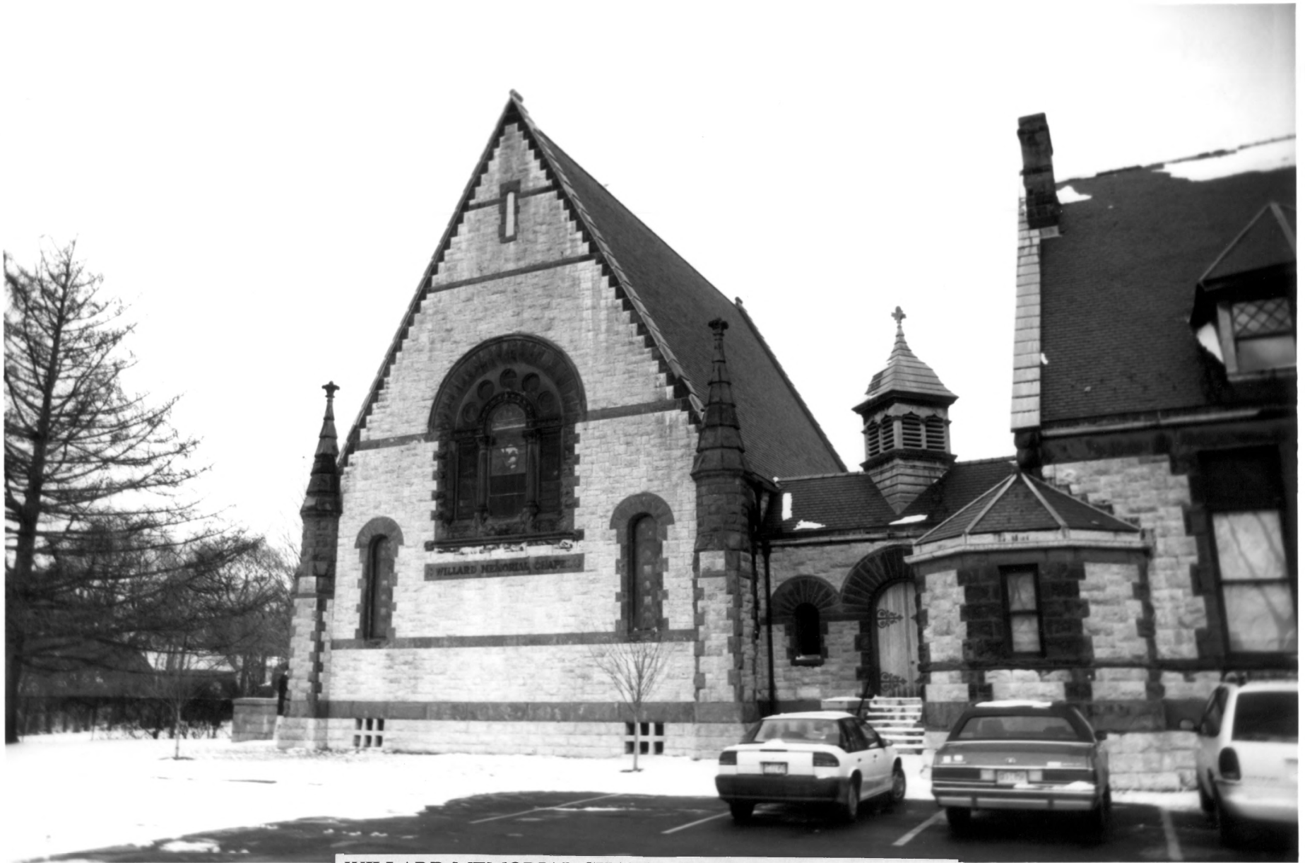
WILLARD MEMORIAL CHAPEL-WELCH MEMORIAL HALL