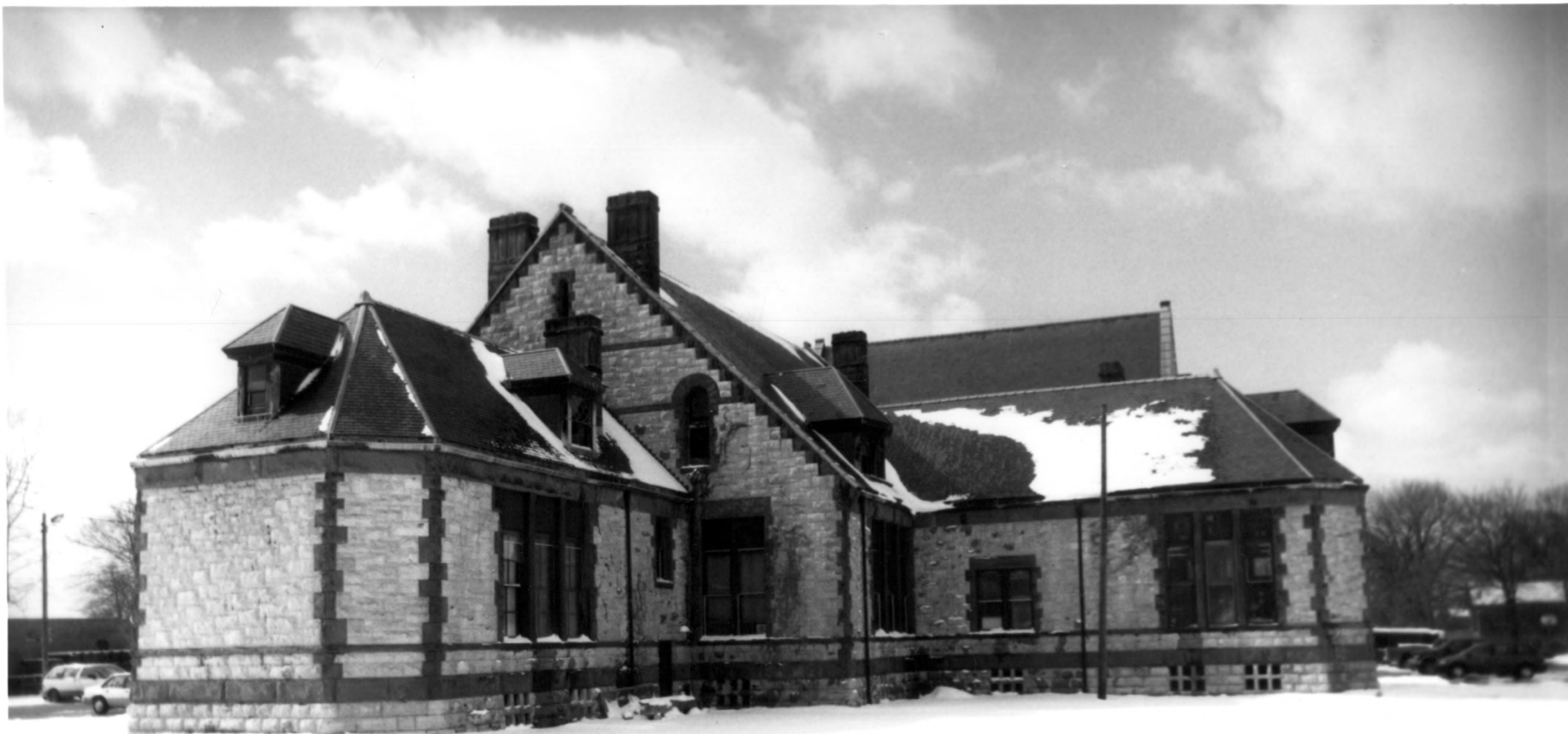
WILLARD MEMORIAL CHAPEL-WELCH MEMORIAL HALL Auburn, New York East elevation of Welch Memorial Hall