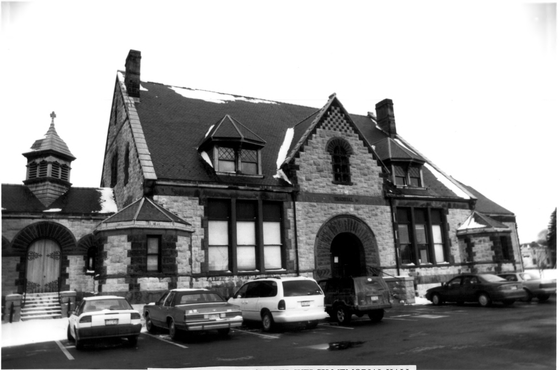
WILLARD MEMORIAL CHAPEL-WELCH MEMORIAL HALL Auburn, New York South facade of Welch Memorial Hall and hyphen