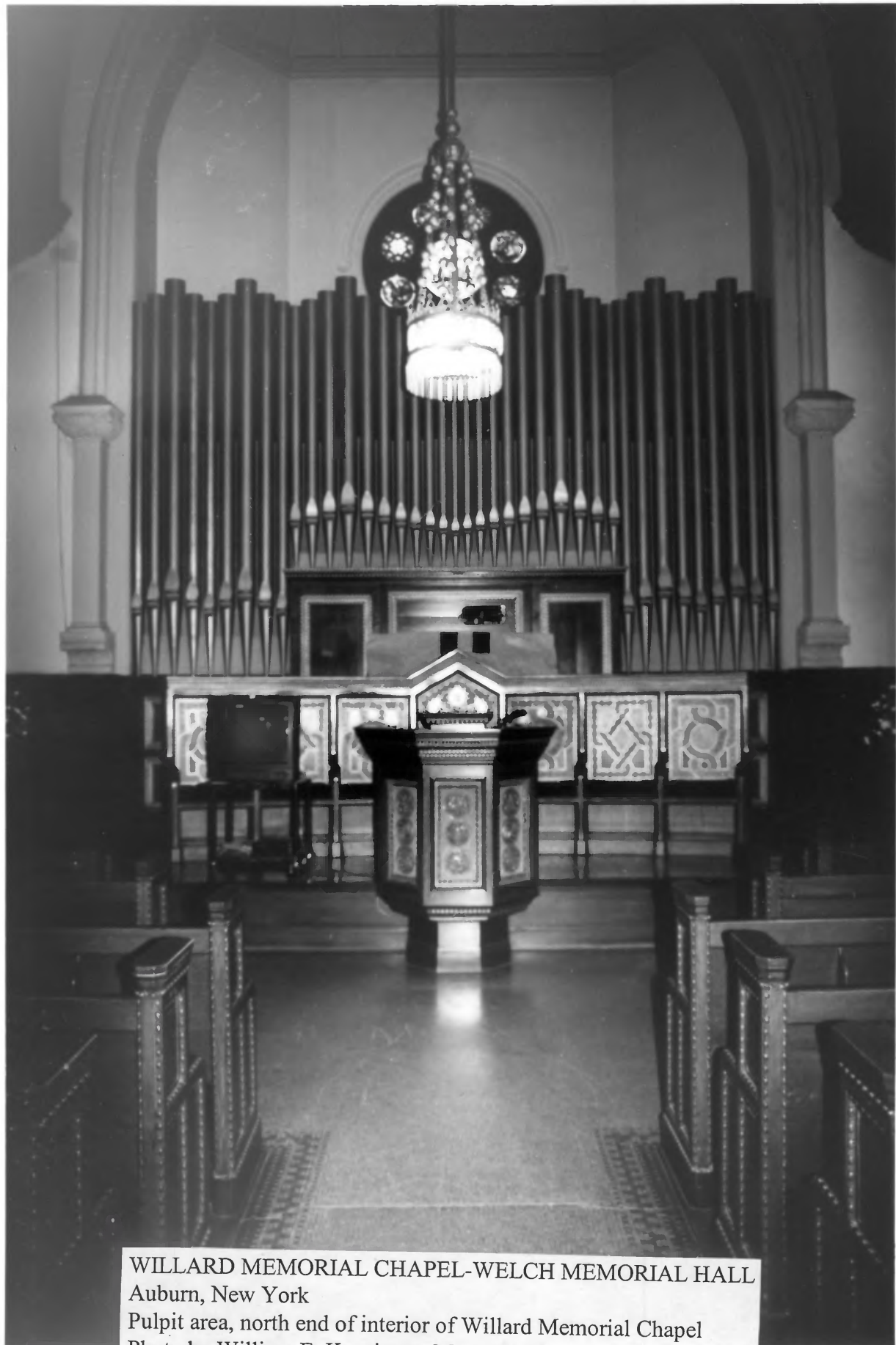
WILLARD MEMORIAL CHAPEL-WELCH MEMORIAL HALL Auburn, New York Pulpit area, north end of interior of Willard Memorial Chapel