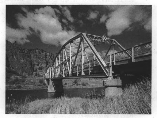
Photograph 0002. Hardy Bridge. North profile and west portal. View to the east.