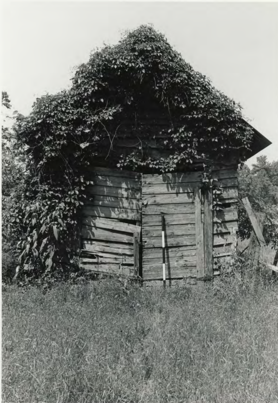
DA-4 Butler-Matthews Homestead, structure #16, garage May 10, 1982 Negative on file at the AHPP View from the North