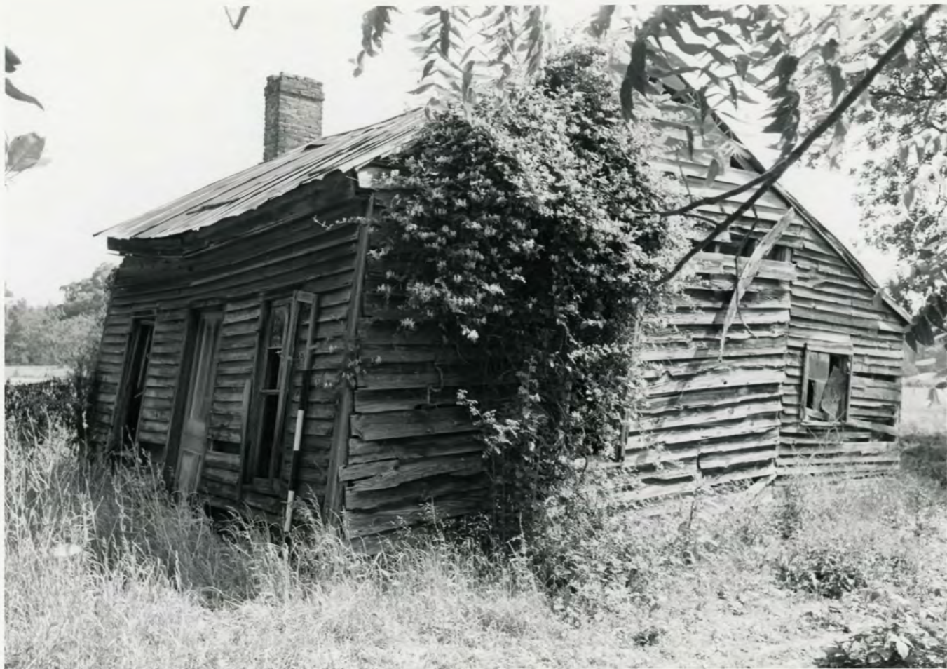
DA-4 Butler-Matthews Homestead; structure #2, dwelling May 11, 1982 Negative filed at the AHPP View from the southeast