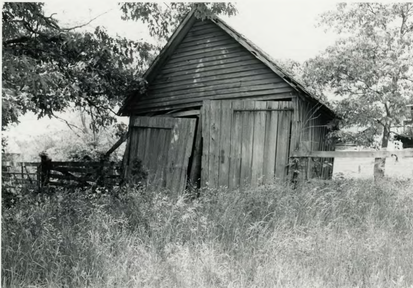
DA-4 Butler-Matthews Homestead, structure #13, garage Sarah Brown, photographer May 10, 1982 Negative on file at the AHPP View from the Northwest