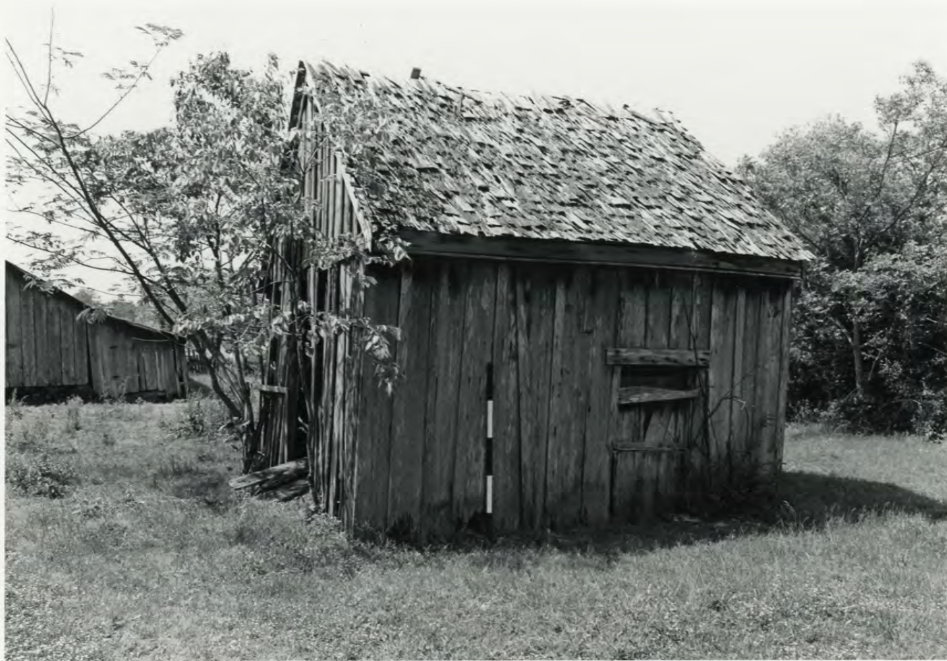
DA-4 Butler-Matthews Homestead, structure #10, servant's dwelling May 10, 1982 View from the Northwest