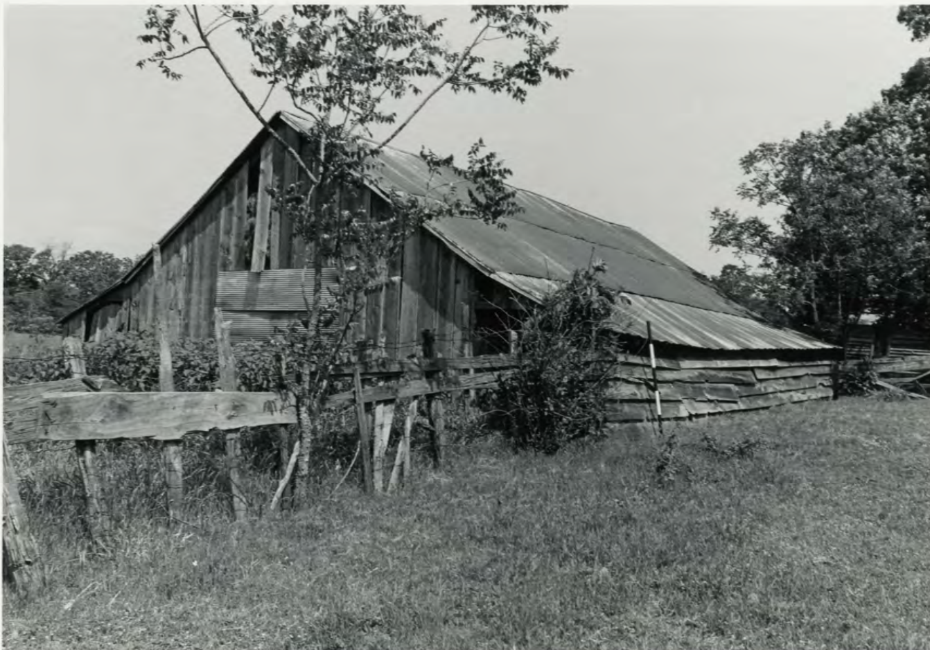
DA-4 Butler-Matthews Homestead, structure #8, cow barn Sarah Brown, photographer May 10, 1982 Negative on file at the AHPP View from the Northeast