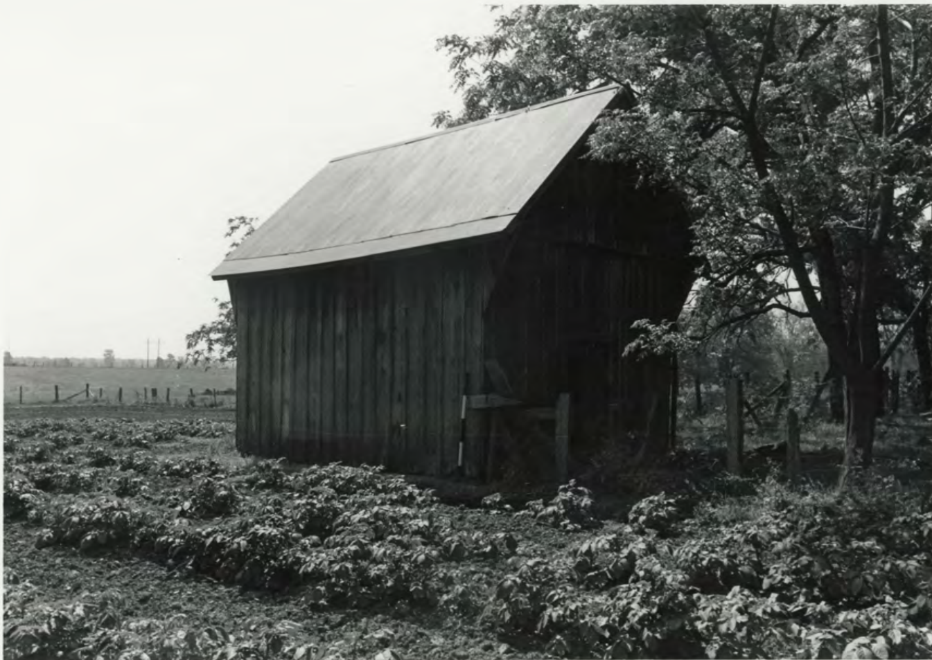
DA-4 Butler-Matthews Homestead, structure #3, smokehouse May 10, 1982 Negative filed at the AHPP View from the southwest