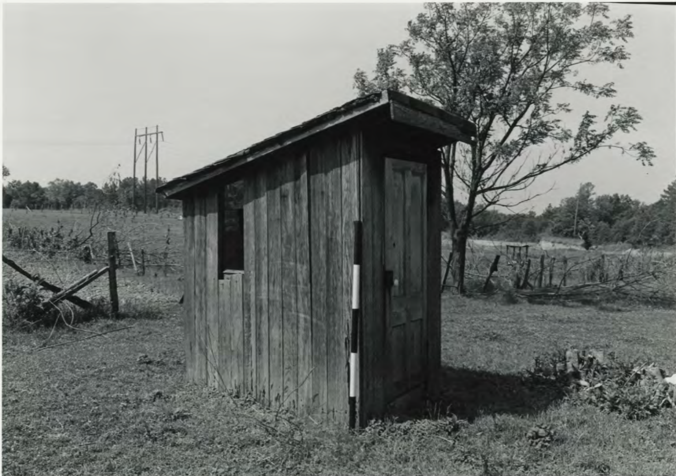
DA-4 Butler-Matthews Homestead, structure #7, privy May 10, 1982 Negative on file at the AHPP View from the Northwest