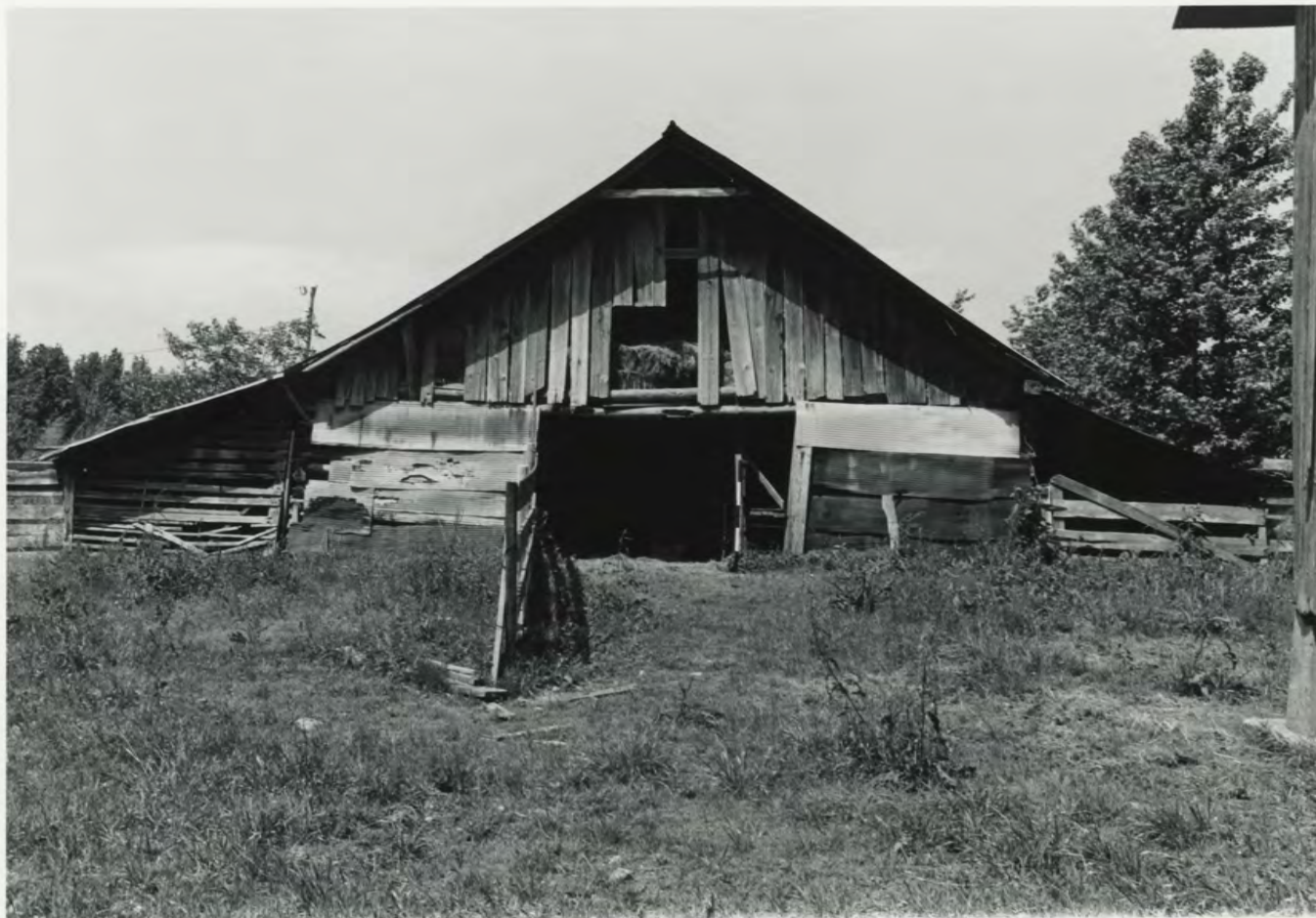
DA-4 Butler-Matthews Homestead, structure #14, barn Sarah Brown, photographer May 10, 1982 Negative on file at the AHPP View from the North