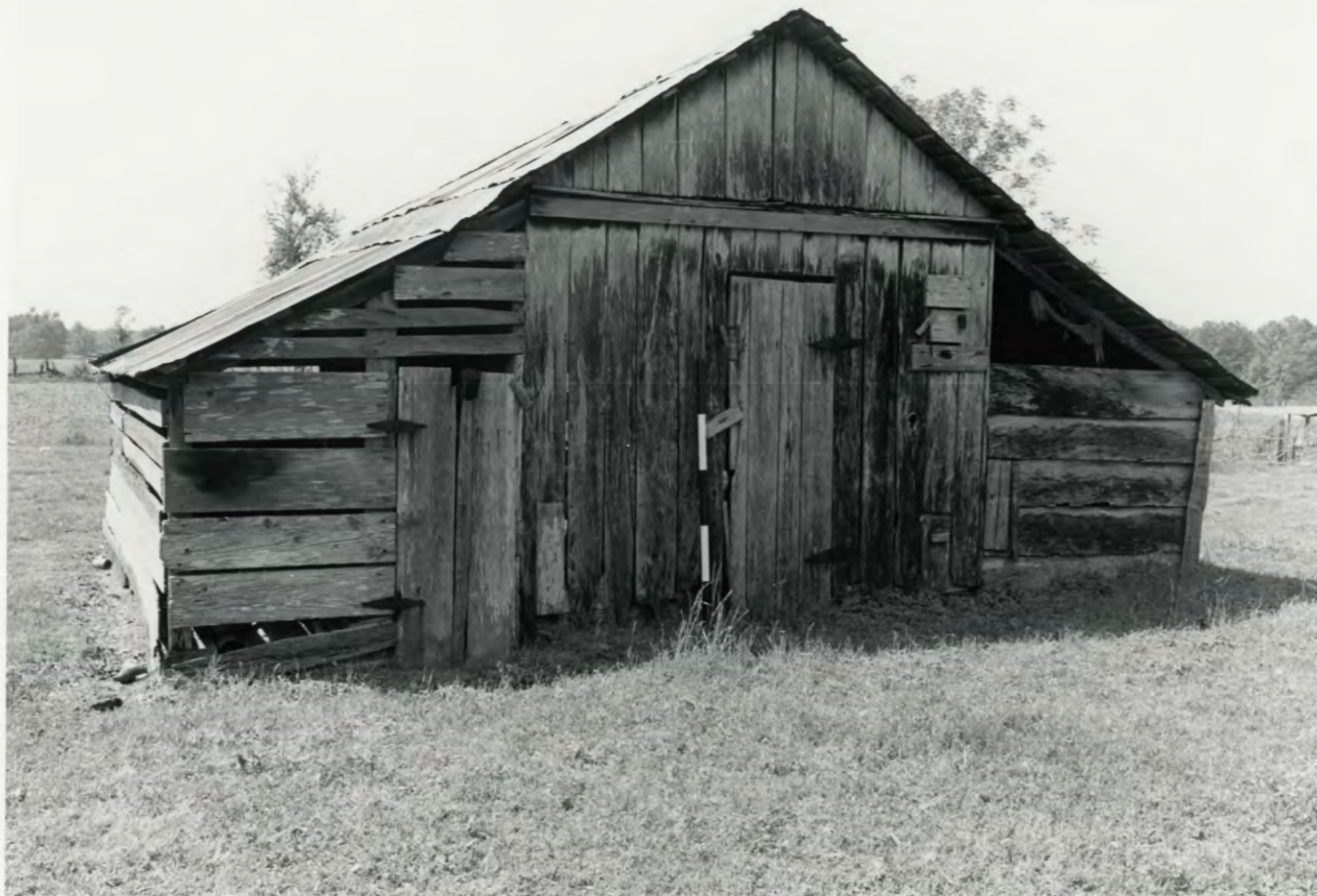
DA-4 Butler-Matthews Homestead, structure #6, hen house May 10, 1982 Negative on file at the AHPP View from the northwest