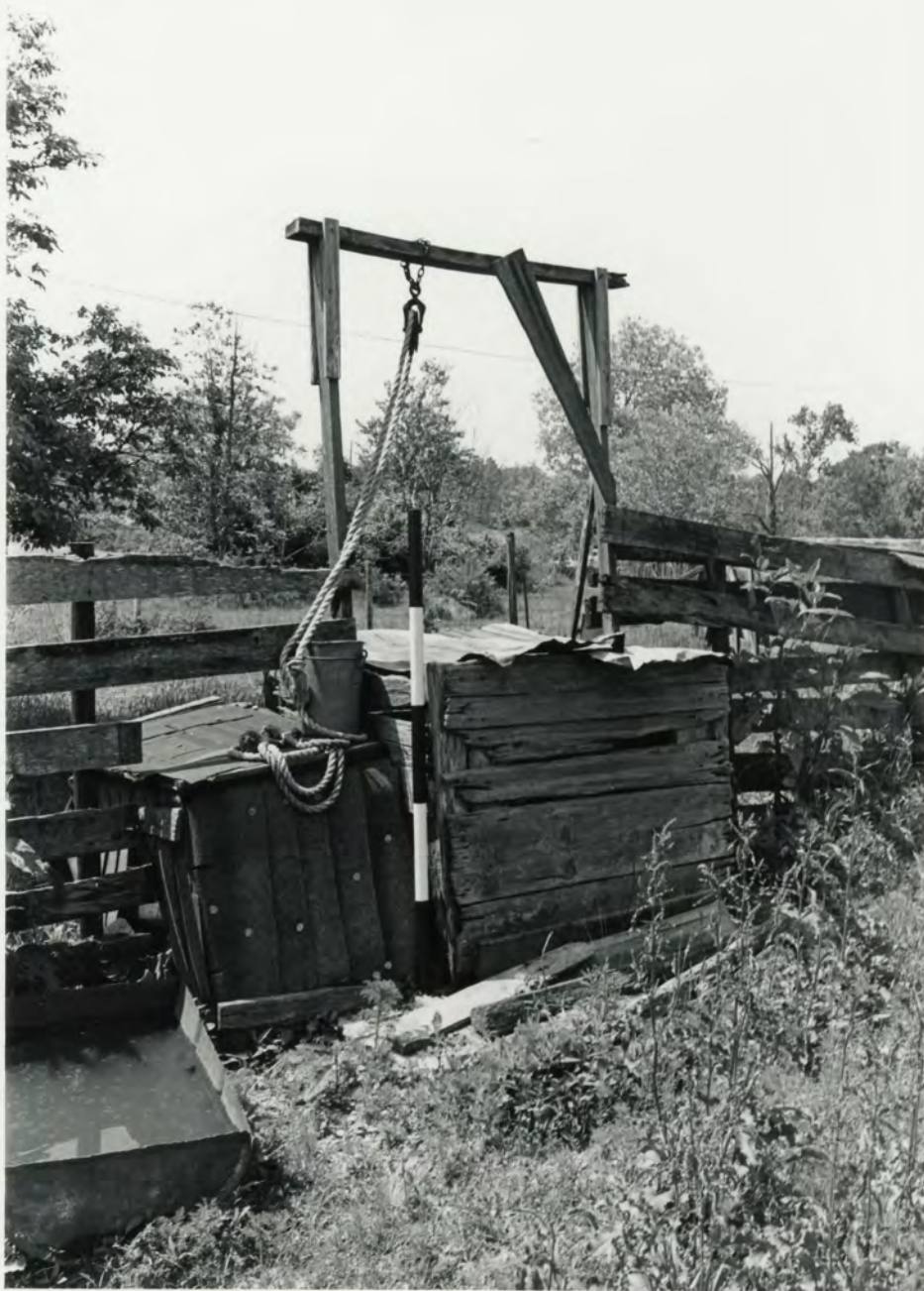
DA-4 Butler-Matthews Homestead, structure #12, well May 10, 1982 Negative on file at the AHPP View from the Northwest