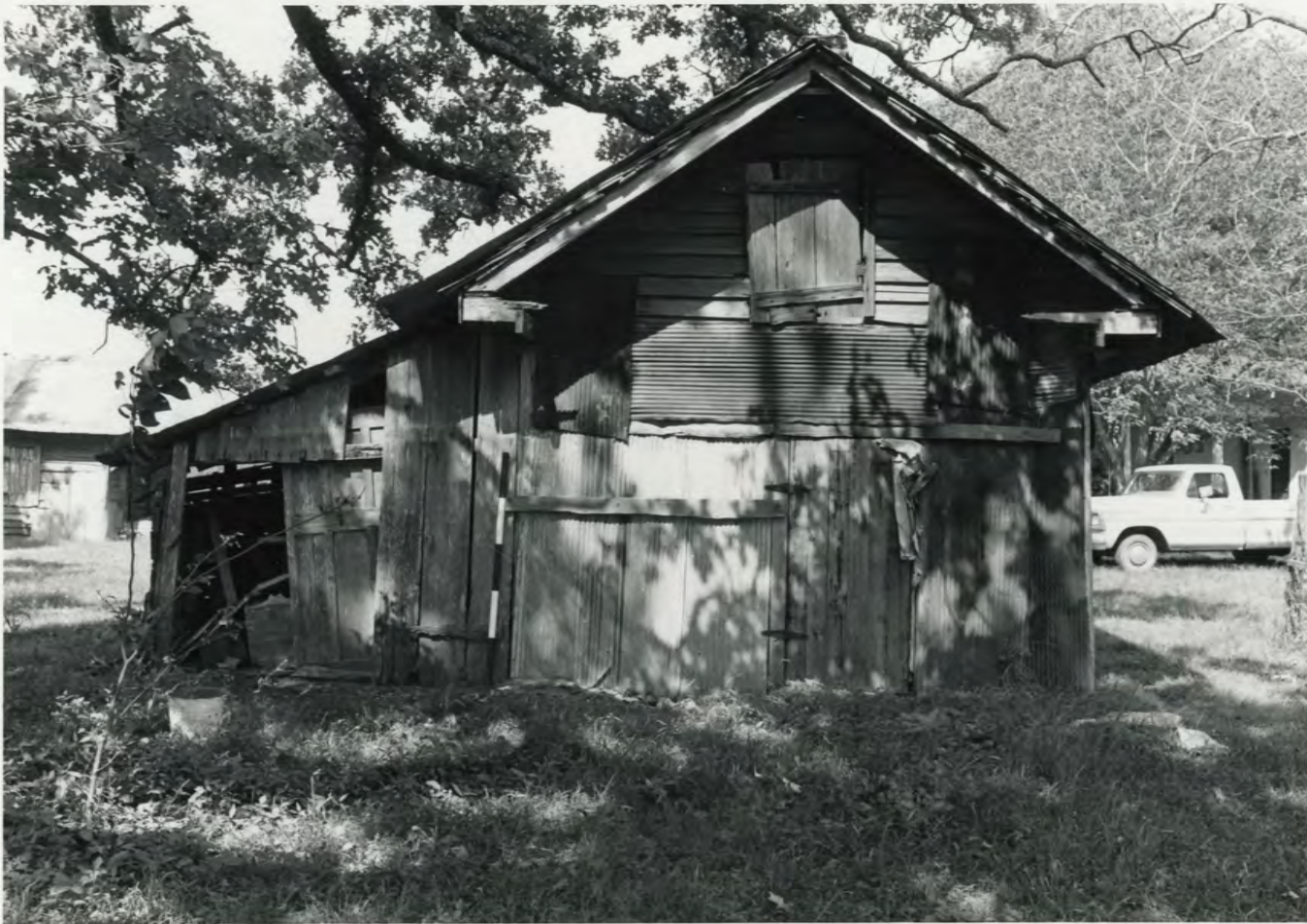
DA-4 Butler-Matthews Homestead, structure #4, potato house Sarah Brown, photographer May 10, 1982 Negative filed at the AHPP View from the North