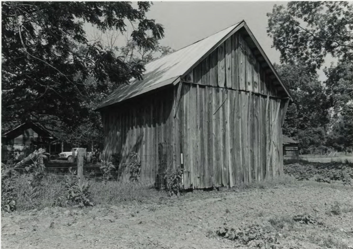
DA-4 Butler-Matthews Homestead, structure #3, smokehouse May 10, 1982 Negative filed at the AHPP View from the Northeast