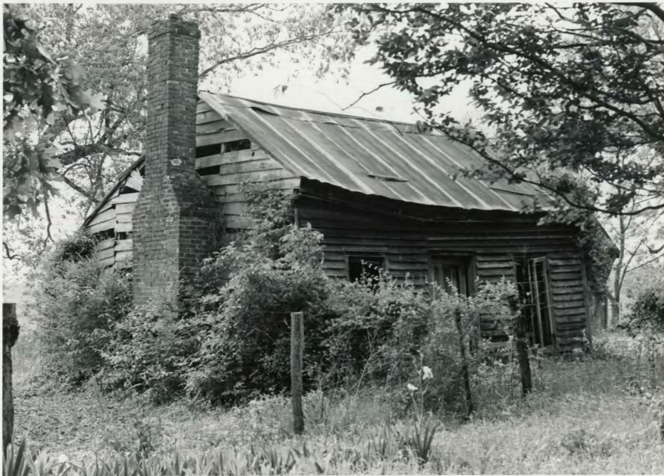
DA-4 Butler-Matthews Homestead structure #2, dwelling Sarah Brown, photographer May 7, 1983 Negative on file at the AHPP View from the Southwest