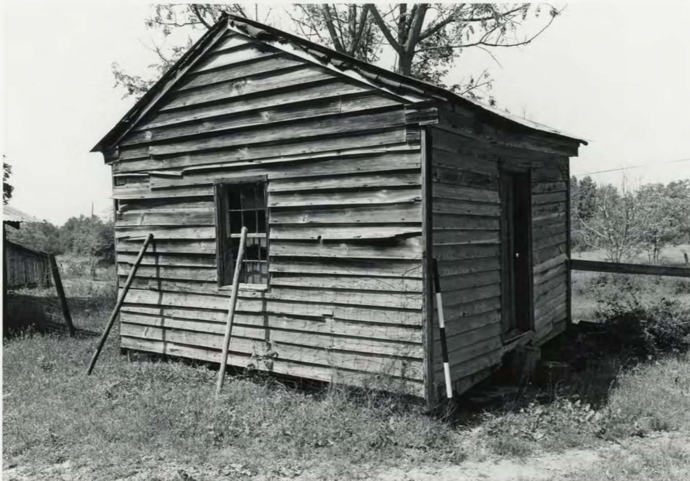
DA-4 Butler-Matthews Homestead, structure #11, office May 10, 1982 Negative on file at the AHPP View from the Northwest