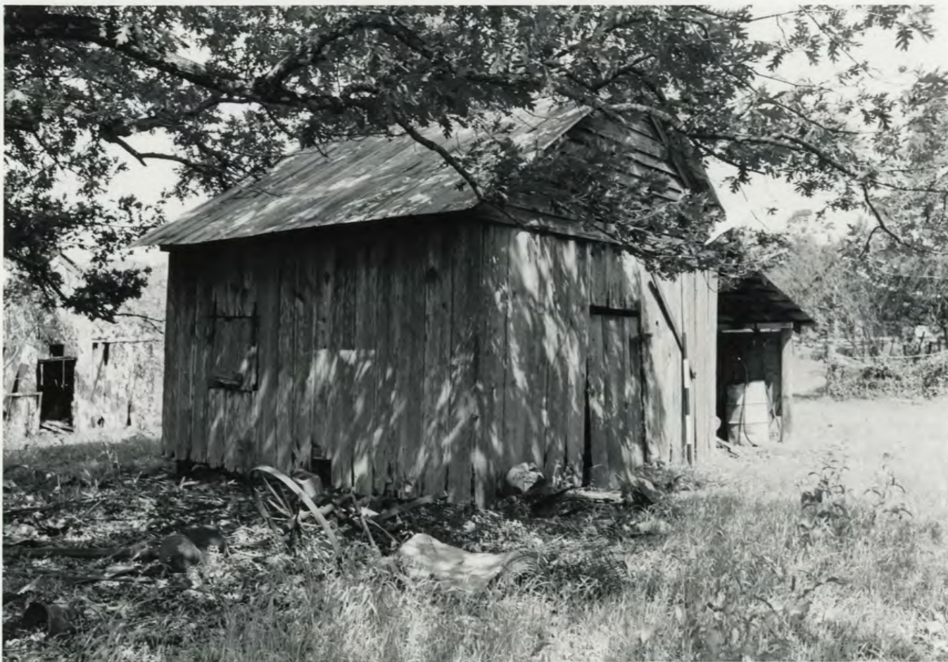
DA-4 Butler-Matthews Homestead, structure #9, blacksmith shop May 10, 1982 Negative on file at the AHPP View from the Northeast