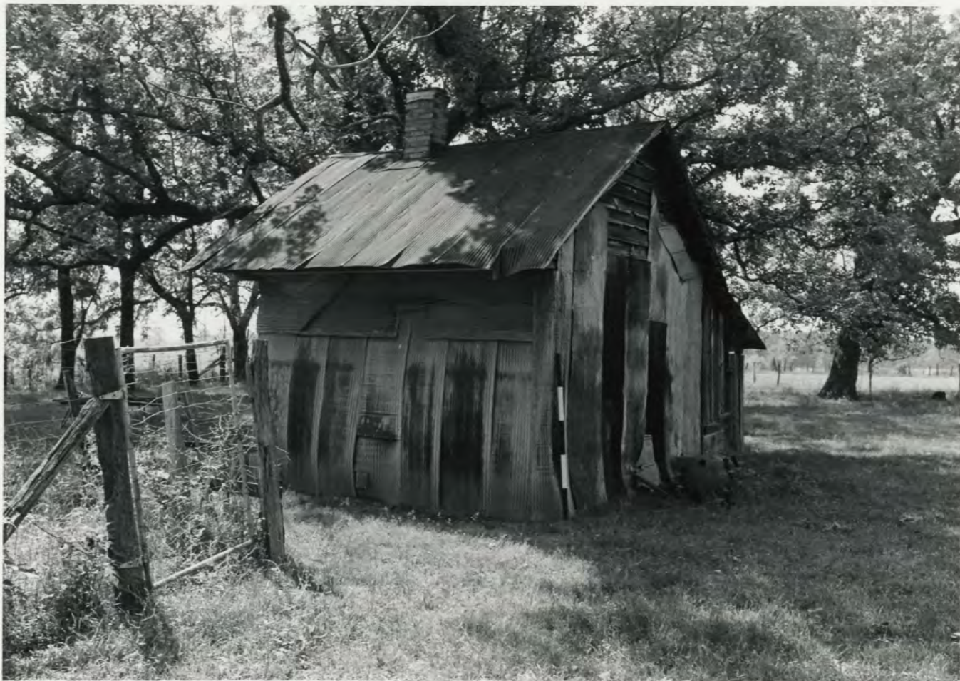
DA-4 Butler-Matthews Homestead, structure #4, potato house Sarah Brown, photographer May 10, 1982 Negative filed at the AHPP View from the southwest