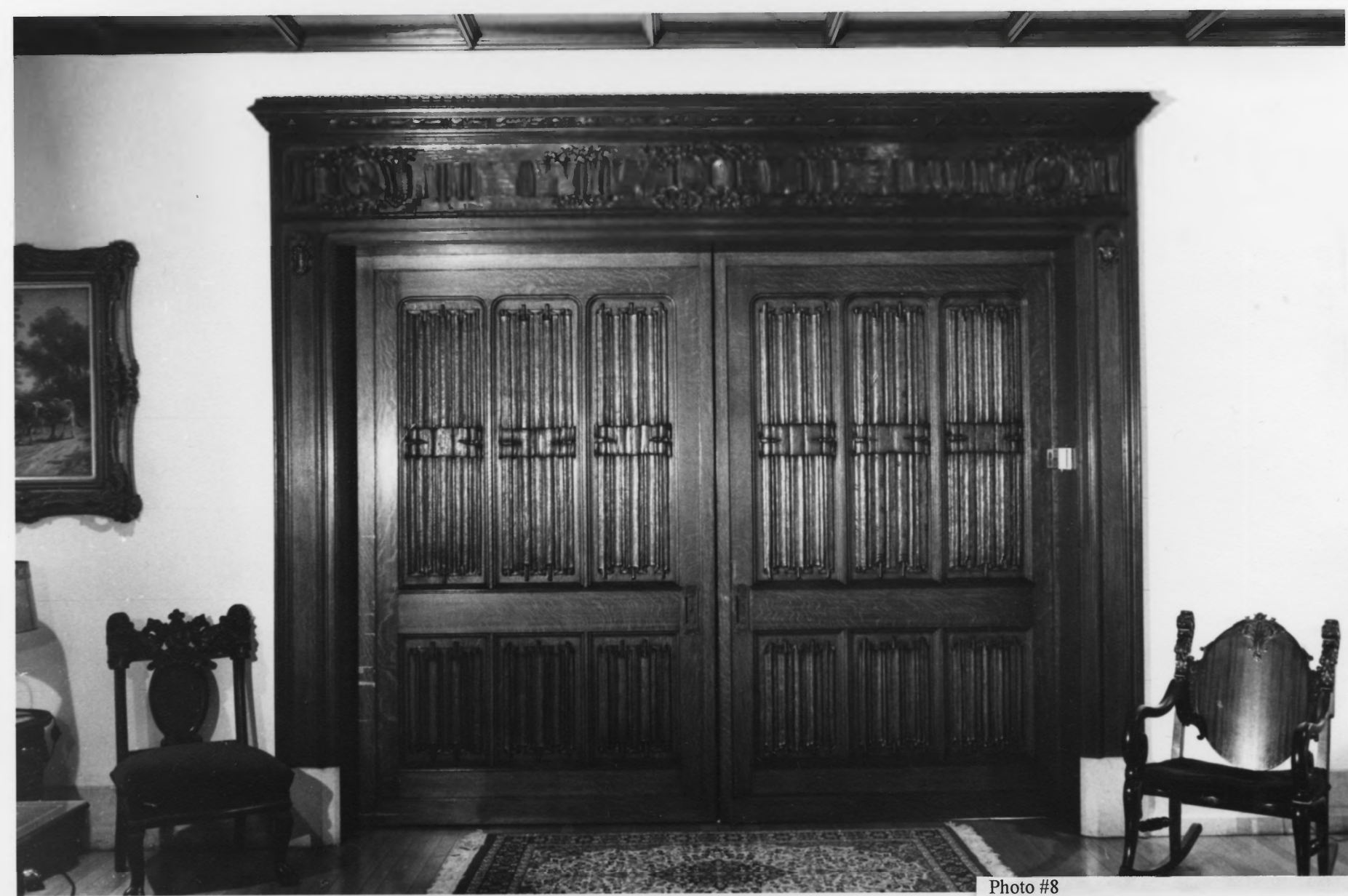
Photo #8 Woodmont Montgomery County, Pennsylvania Manor house, Great Hall, linenfold pocket doors, looking west Peter Zirnis, October 1996