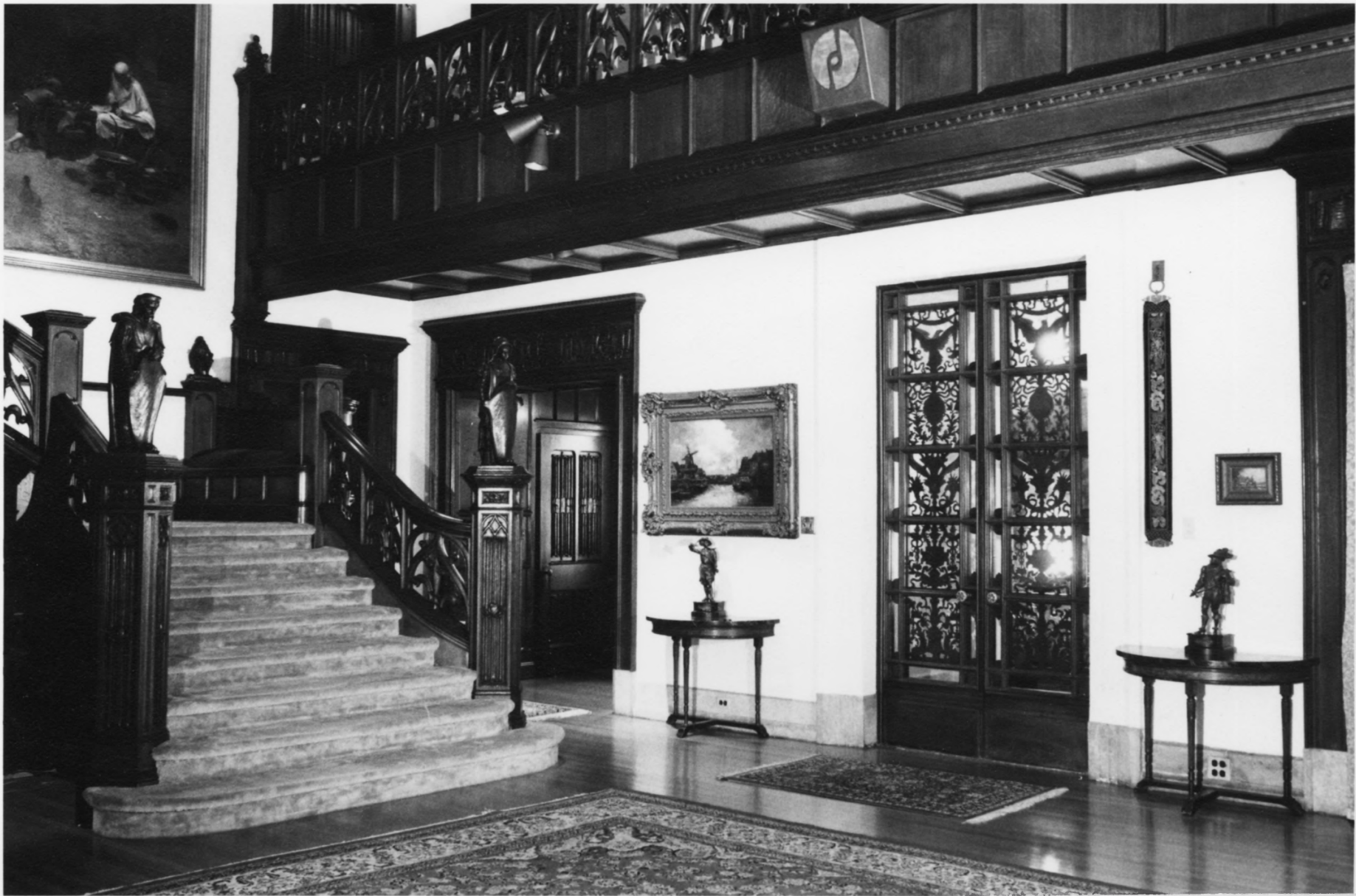
Photo #7 Woodmont Montgomery County, Pennsylvania Manor house, Great Hall, looking southeast