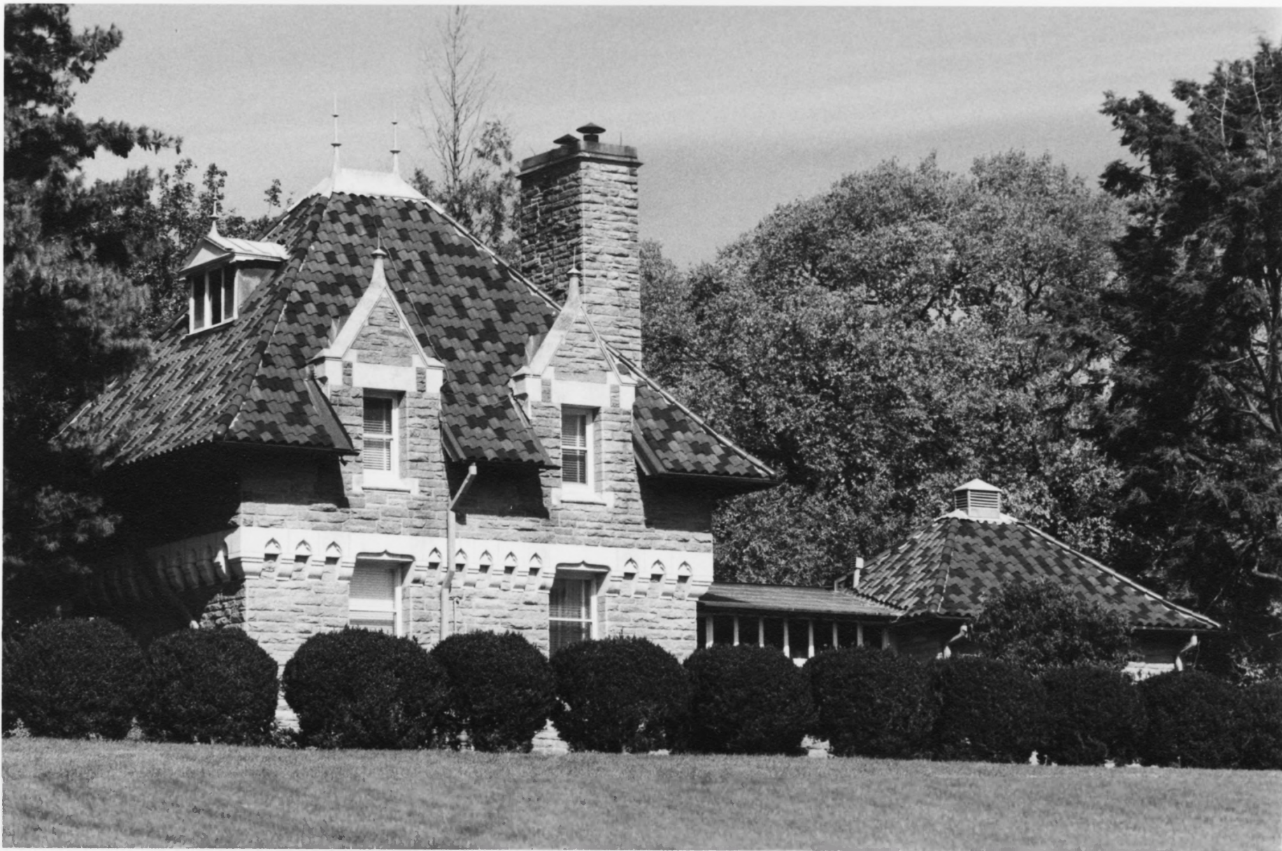
Photo #9 Woodmont Montgomery County, Pennsylvania Servants quarters, looking northeast Peter Zirnig, October 1996