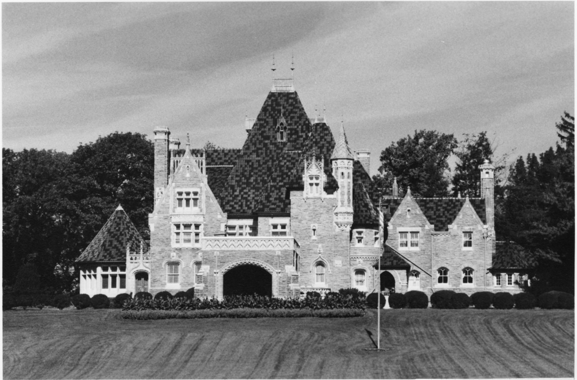
Photo #2 Woodmont Montgomery County, Pennsylvania Manor house, main elevation, looking north Peter Zirnig, October 1996