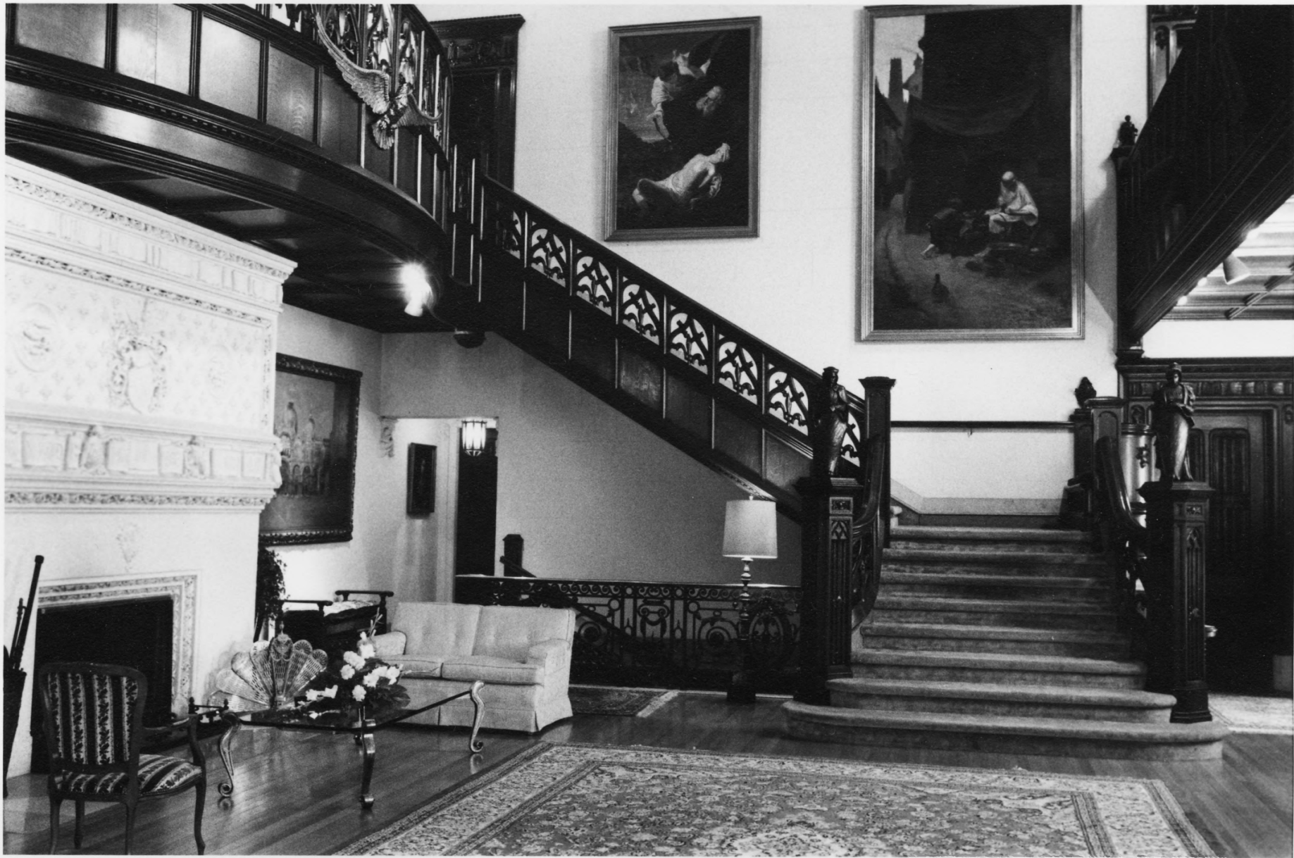
Photo #6 Woodmont Montgomery County, Pennsylvania Manor house, Great Hall, looking east Peter Zirmis, October 1996