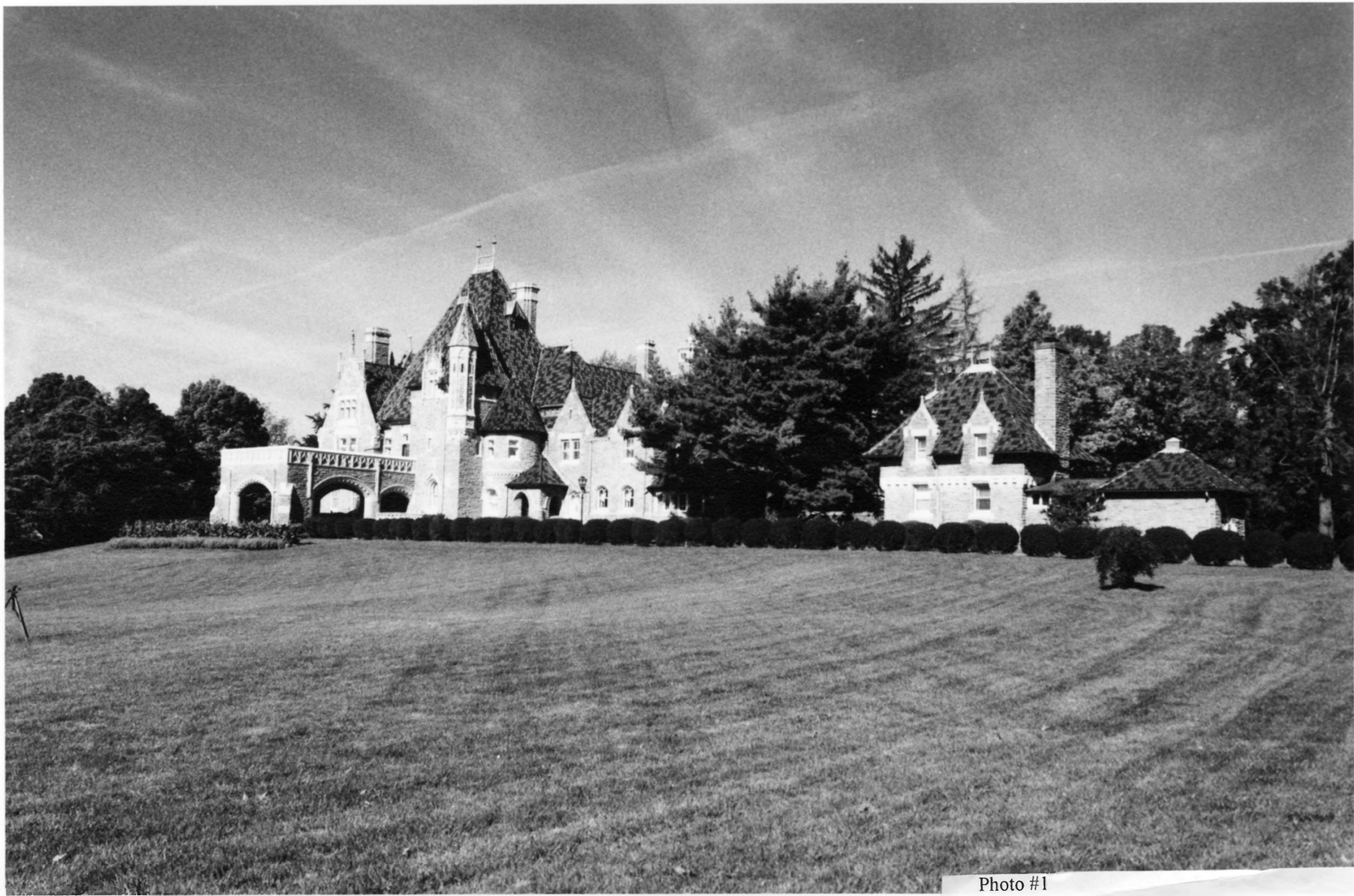
Photo #1 Woodmont Montgomery County, Pennsylvania Manor house and servants quarters, looking northwest Peter Zimis, October 1996