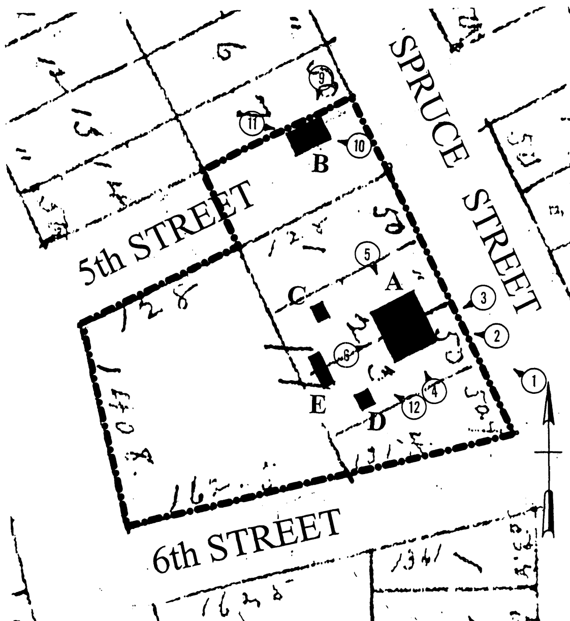
Annotated extract of "Plan of Como, Park County, Colorado, filed 2 July 1879." Dot and dash line indicates nominated area; letters identify buildings in narrative.

Como School, Park County, Colorado (Rural School Buildings in Colorado MPS)