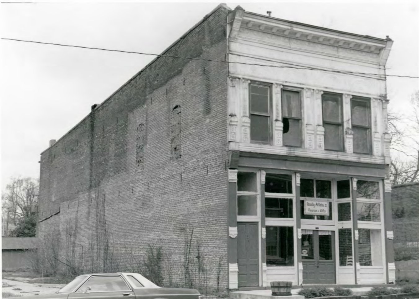
CL-2 Jefferies Building 122 Madison HISTORIC RESOURCES OF CLARENDON Viewed from the Southwest