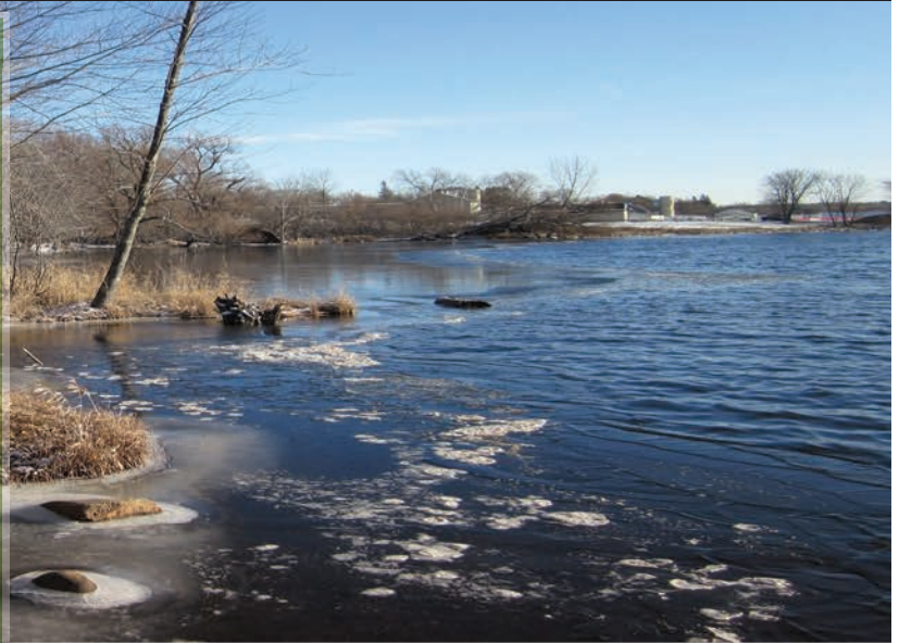
Merrill's River Bend Trail.