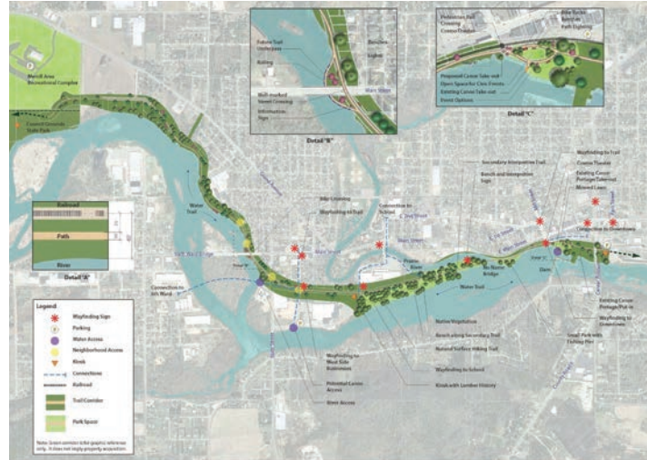
A concept map for the City of Merrill's River Bend Trail.

Staff from RTCA led the River District Development Foundation of Merrill in planning for a passive use trail along the riverfront; coordinated well-attended public design workshops and development of a trail concept plan; identified steps for trail implementation; and prepared the “River Bend Concept Plan Report.”