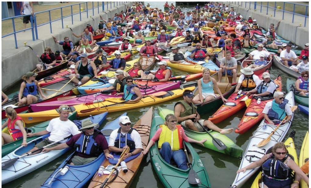
Fox-Wisconsin Heritage Parkway Water Trail.

As Phase 2 continues, the Great Rivers Confluence Project, intends through connections and partnerships, to: foster partnerships across national, state and local divisions; create and adopt a common vision of Great Rivers preservation and management; and plan and implement land and water