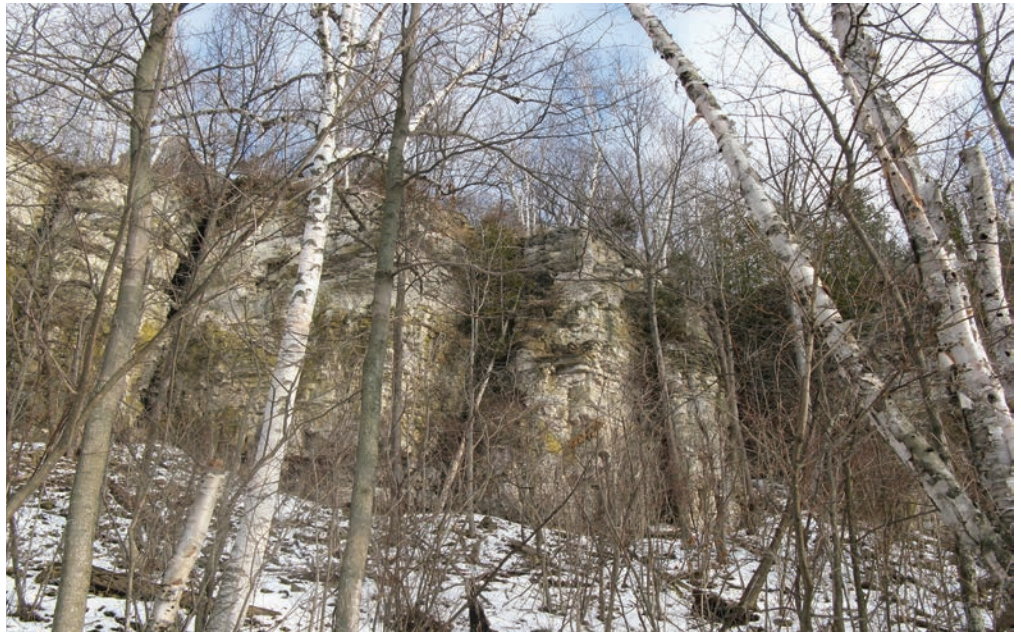
The Niagara Escarpment Greenway.

Continued assistance to the Mississippi River Connections Collaborative with a focus on expanding the Collaborative to additional partners