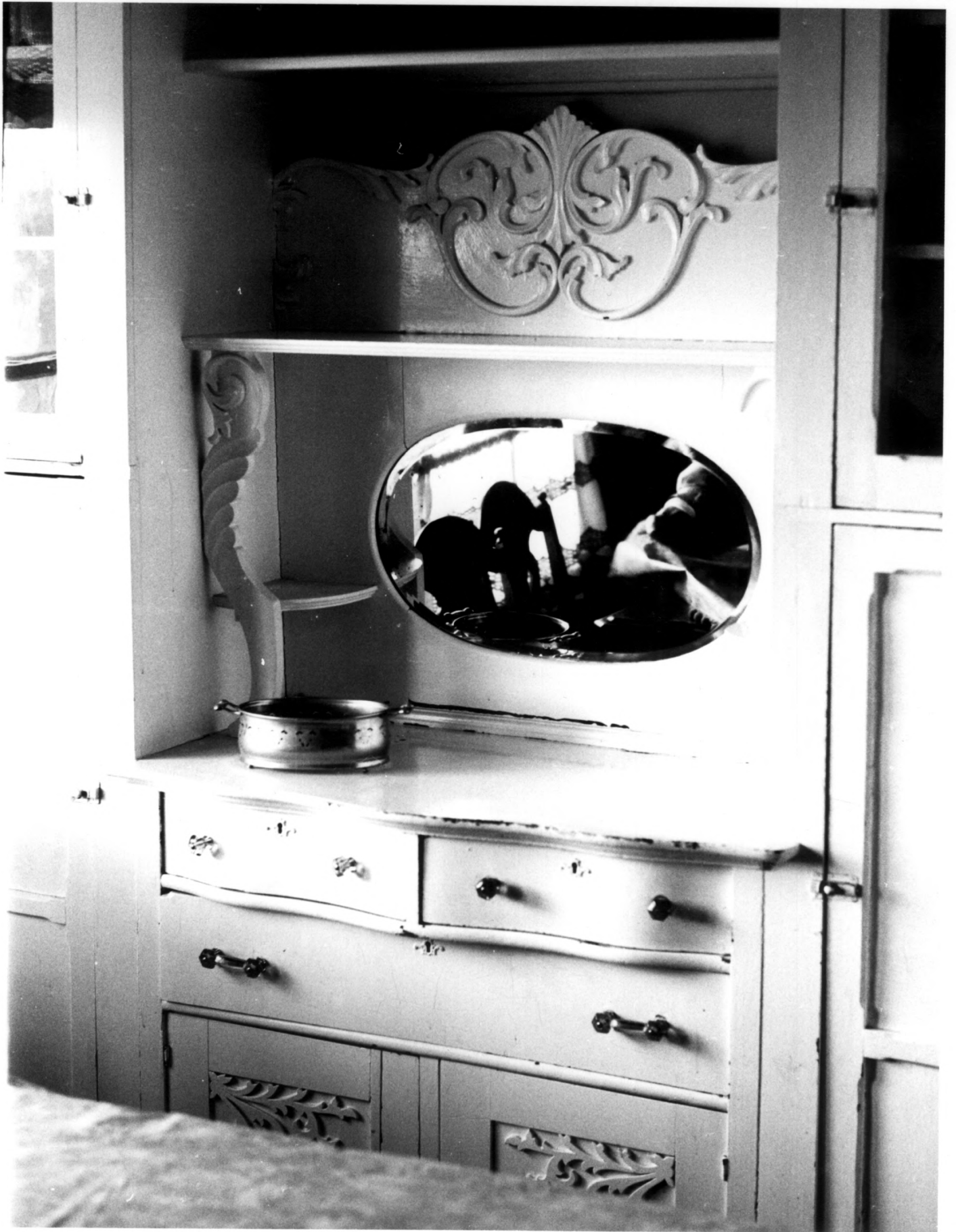
OSCAR ANDERSON HOUSE: BUILT-IN BUFFET IN DINING ROOM