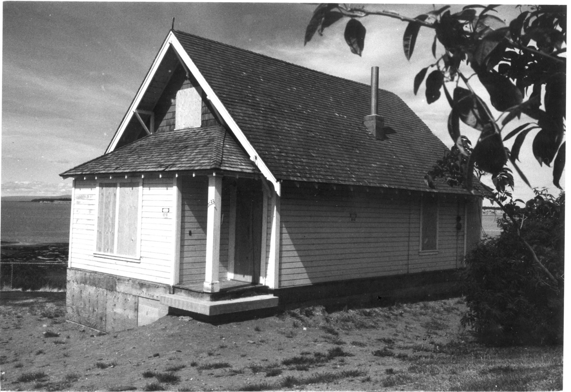
OSCAR ANDERSON HOUSE: 1977 PHOTOGRAPH