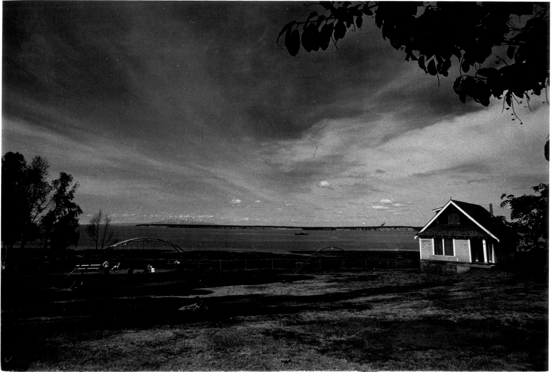
OSCAR ANDERSON HOUSE : PERMANENT LOCATION ADJACENT TO ELDERBERRY PARK