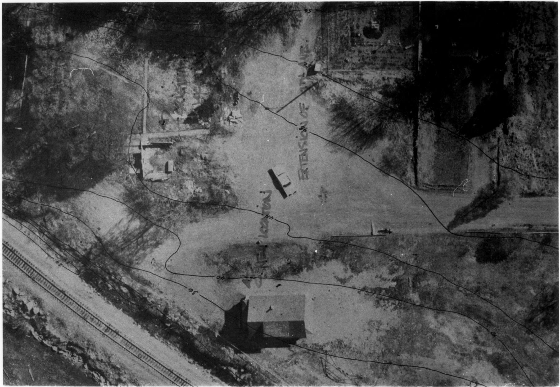
OSCAR ANDERSON HOUSE : RELOCATION