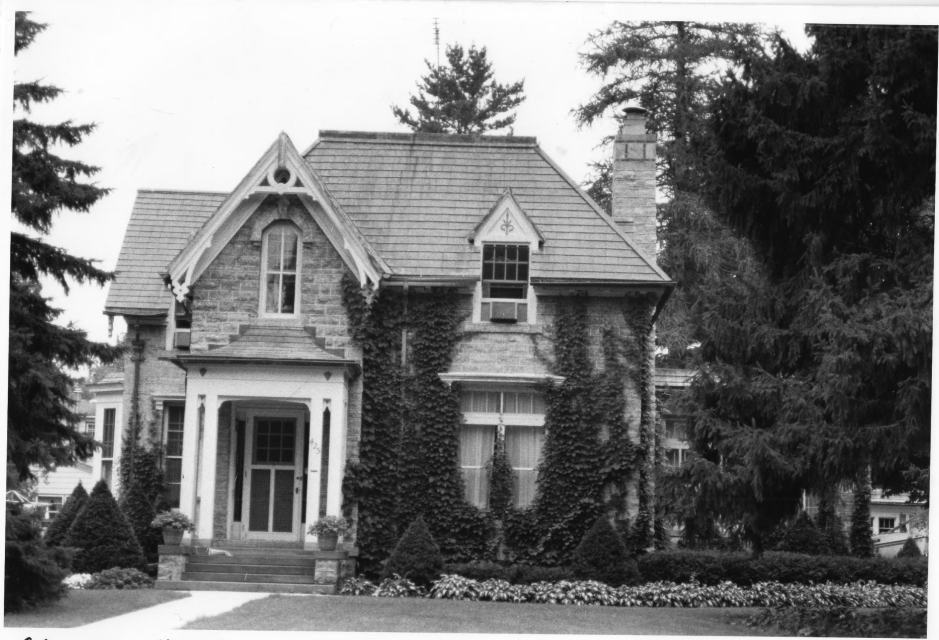
CARUFEL HOUSE FARIBAULT RICE CO., MAI PHOTO 1.D. 09503 # 14