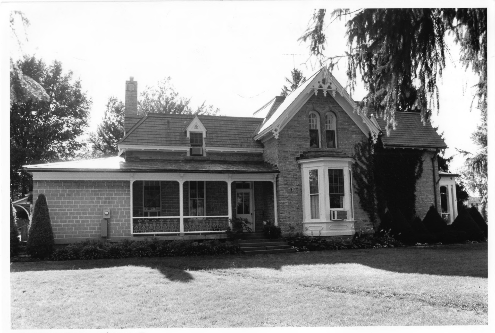
CARUFEL HOUSE FARIBAULT RICE CO., MN PHOTO 1.D. 09930 # 10