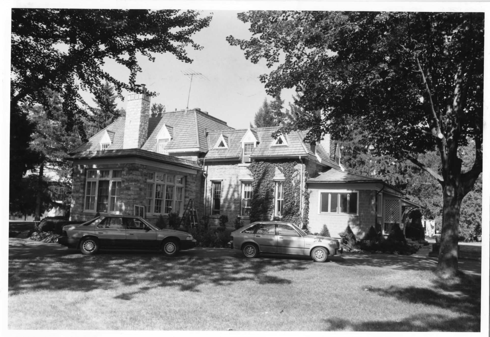
CARUPEL HOUSE PARIBAULT RICE CO., MN 09930 # 11