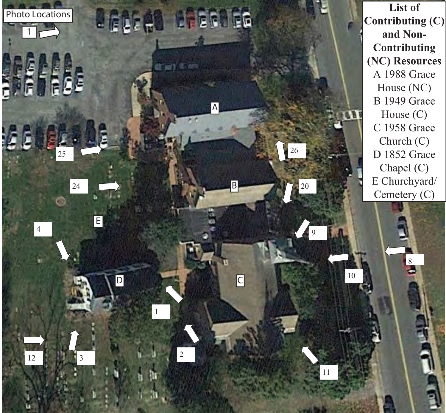
Grace Episcopal Church Kilmarnock, Lancaster County, VA DHR No. 249-5007 Exterior Photo Key