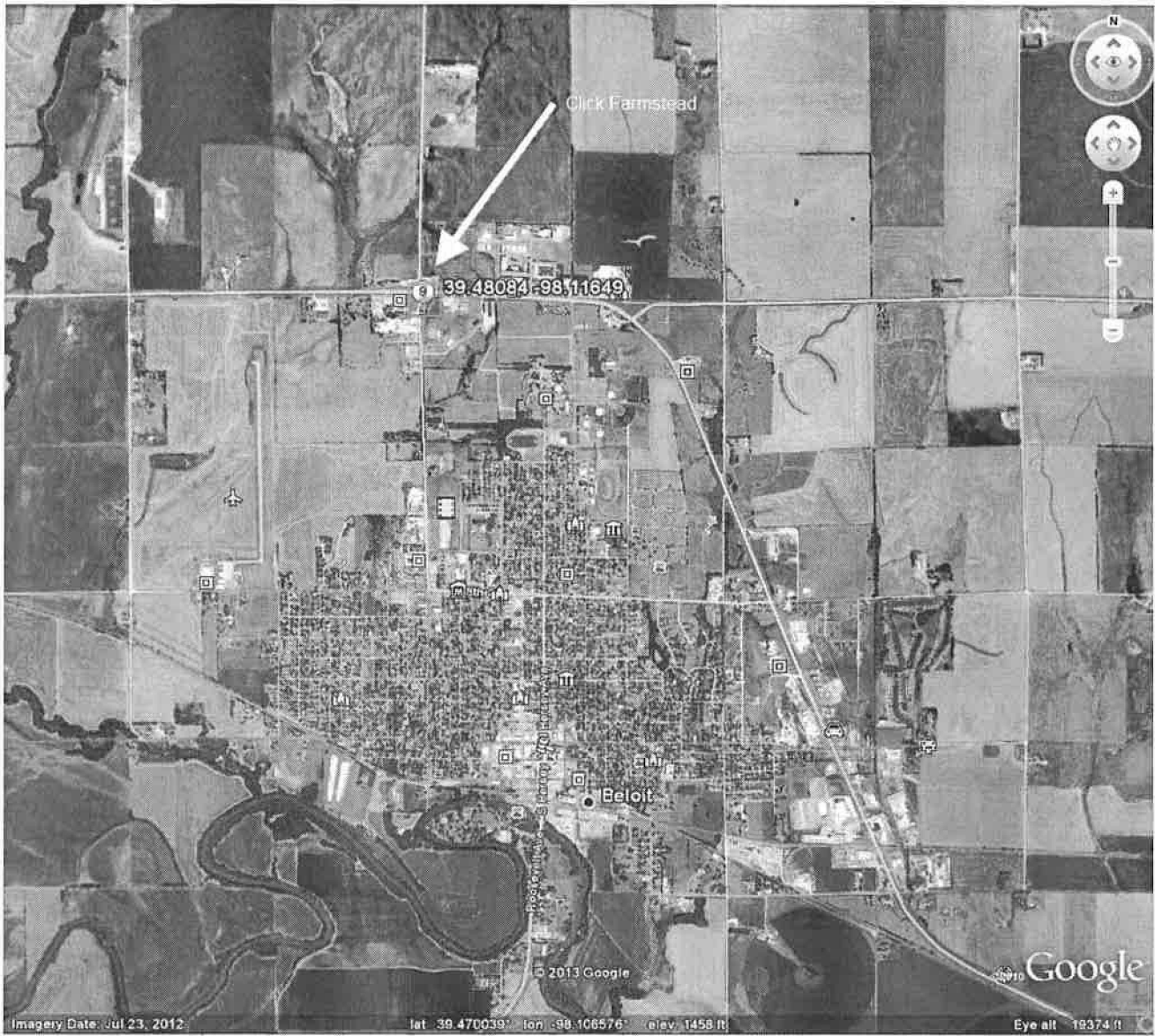
Figure 6: Click Farmstead, Contextual Map Latitude / Longitude: 39.48084 / -98.11649 Datum: WGS84