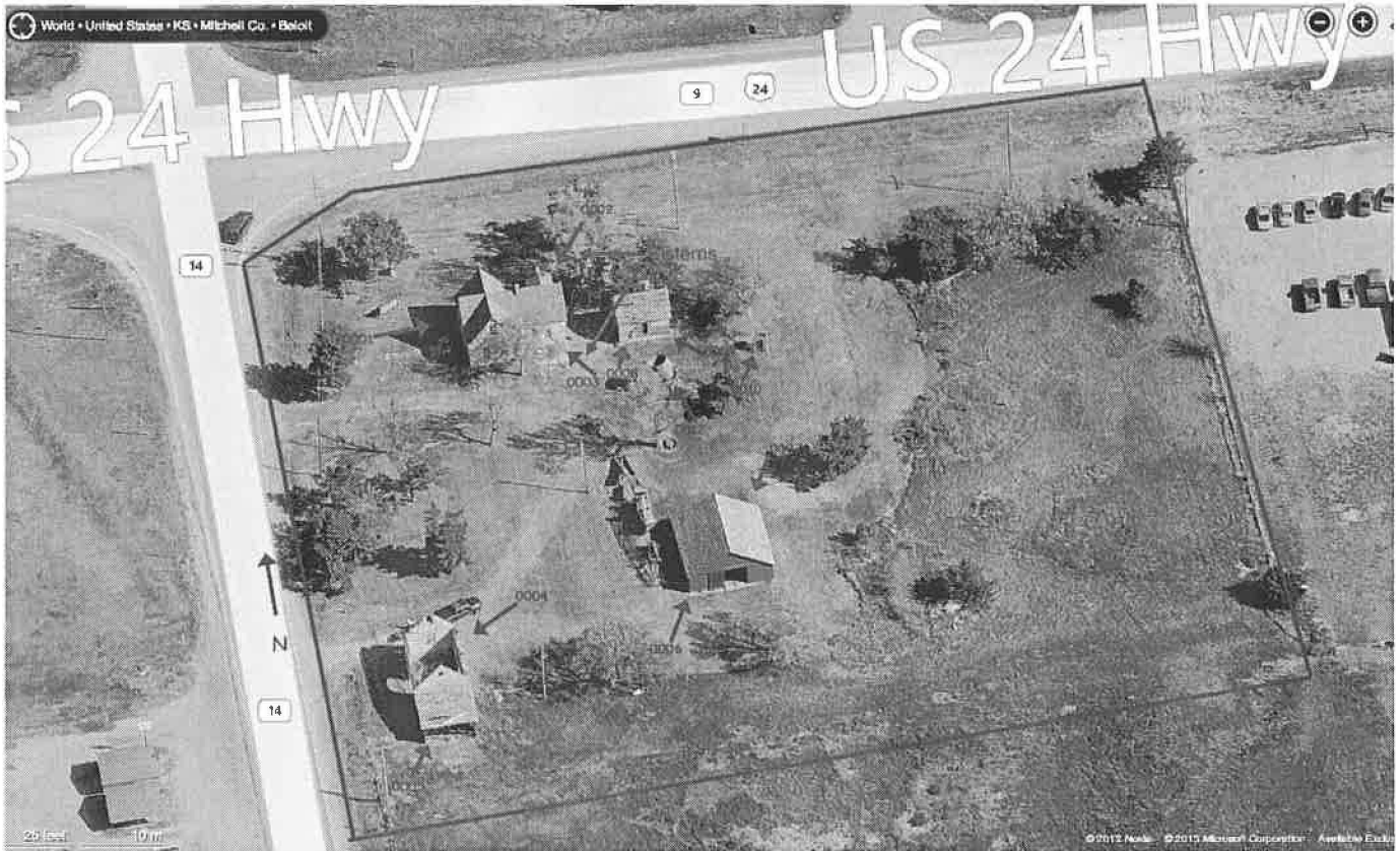
Figure 3: Aerial photograph showing buildings and photograph locations.