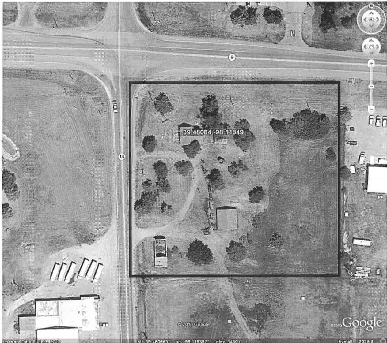
Figure 5: Click Farmstead Latitude / Longitude: 39.48084 / -98.11649 Datum: WGS84 Google Earth, 2013