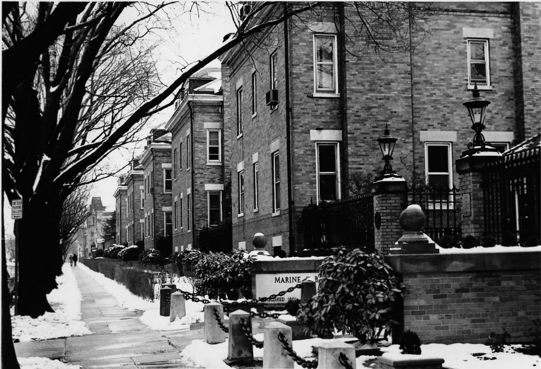
U.S. Marine Corps Barracks and Commandant's House—officers' Quarters, Washington, D.C.