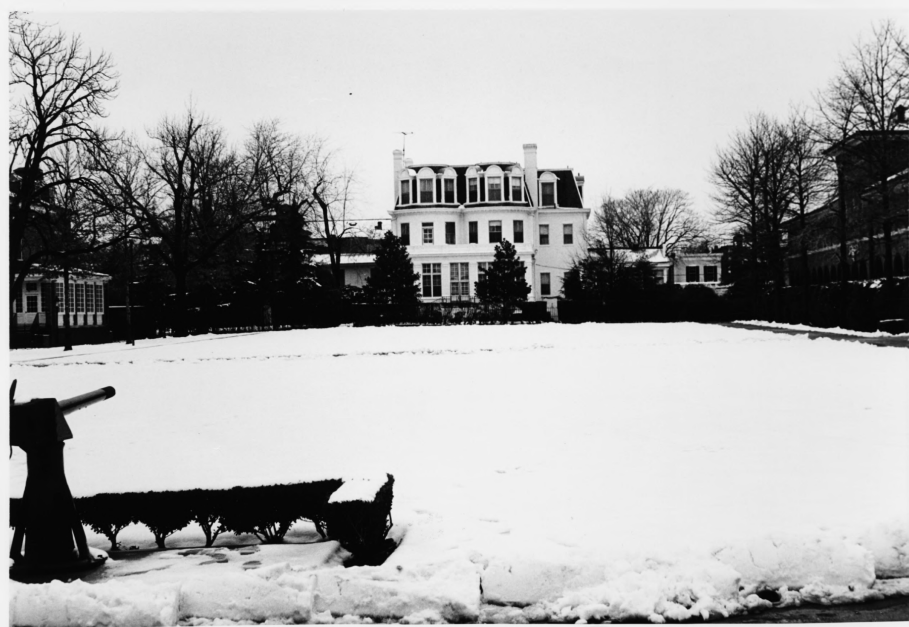
U.S. Marine Barracks and Commandant's House Washington, D.C.