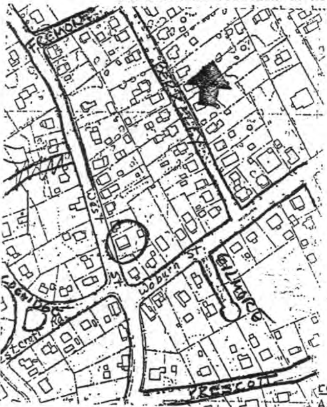
Draw map showing property location in relation to nearest buildings

DESCRIPTION: Date c. 1800 Source Rooftrees, Concerning the Past Style Federal Architect n/a Exterior wall fabric Frame/granite foundation Outbuildings Garage Major alterations (with dates) _____ Bay window on west, and porch on south. Moved NO Date _____ Approx. acreage 11,215 sq. ft. Reservation Setting Set on slight slope, the main door faces south Organization Reading Historical Commission Associates