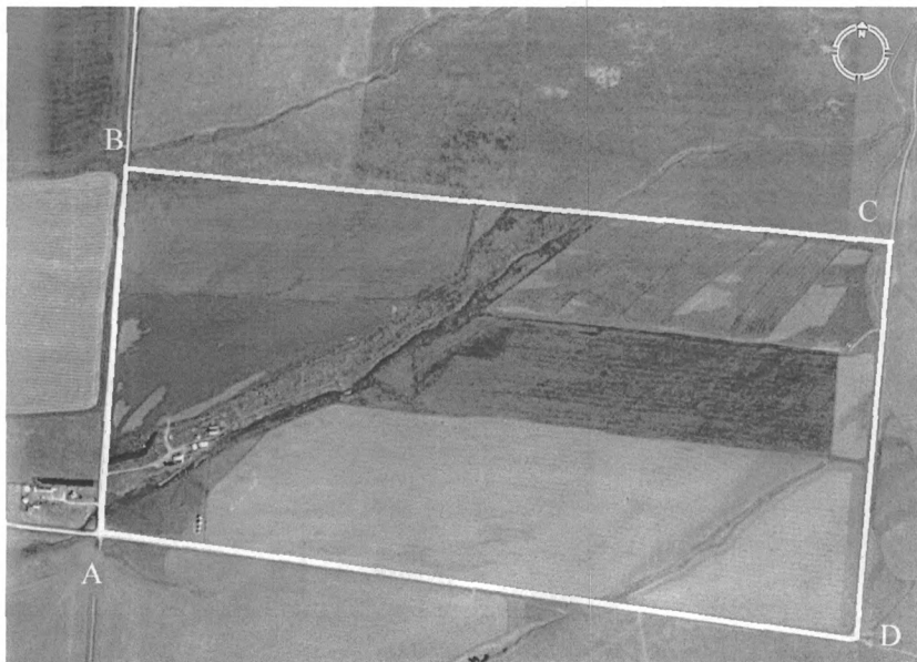
2005 aerial view of Chicken Creek Farmstead showing the historic district boundary.