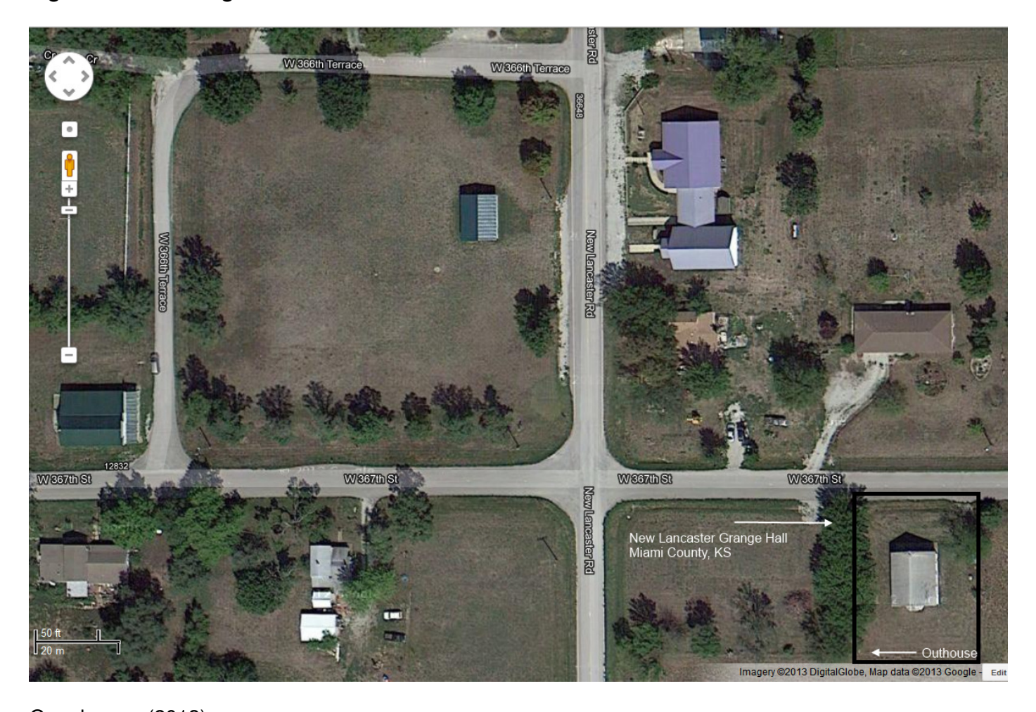
Figure 1: Aerial Image

Google.com (2013) New Lancaster Grange Hall, No. 223 New Lancaster, Miami County, KS Latitude/Longitude: 38.461819 -94.731893