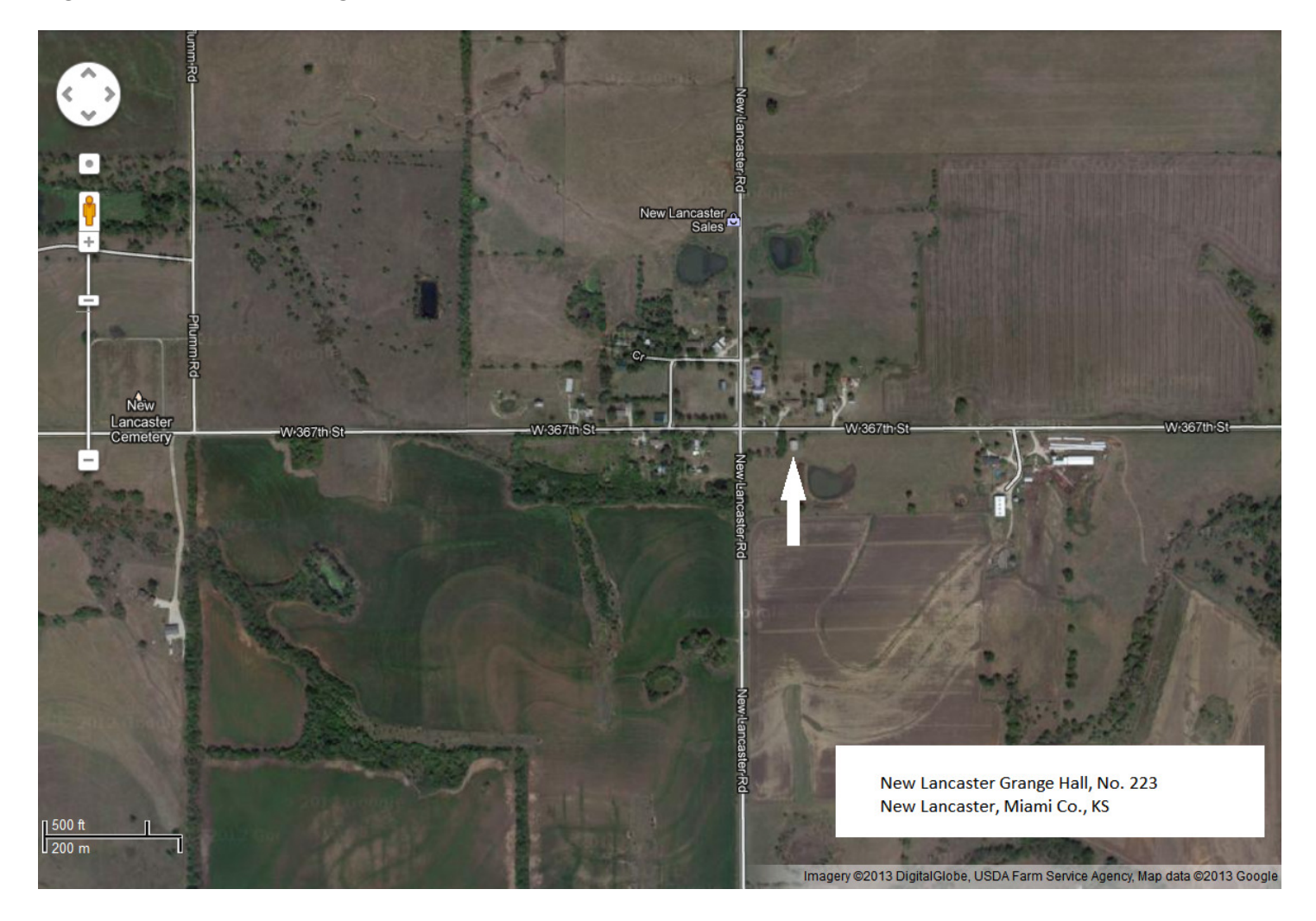
Figure 2: Contextual Image