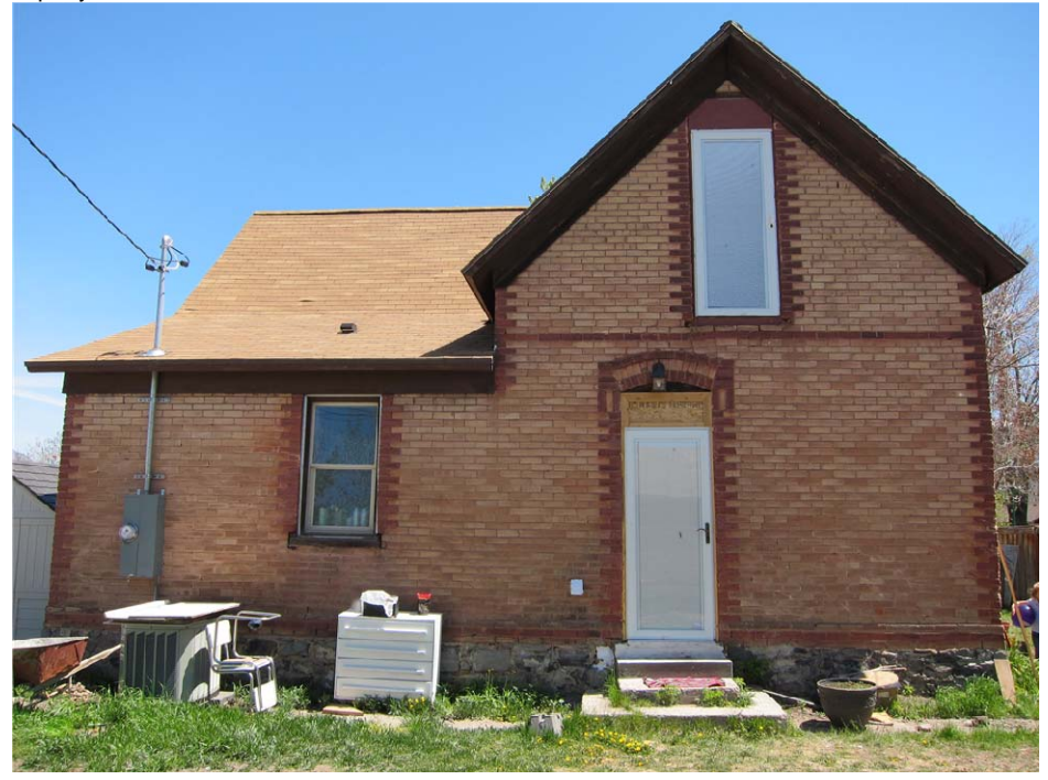
Photo No. 6 Detail of handwritten names on brick exterior wall. Camera facing south.