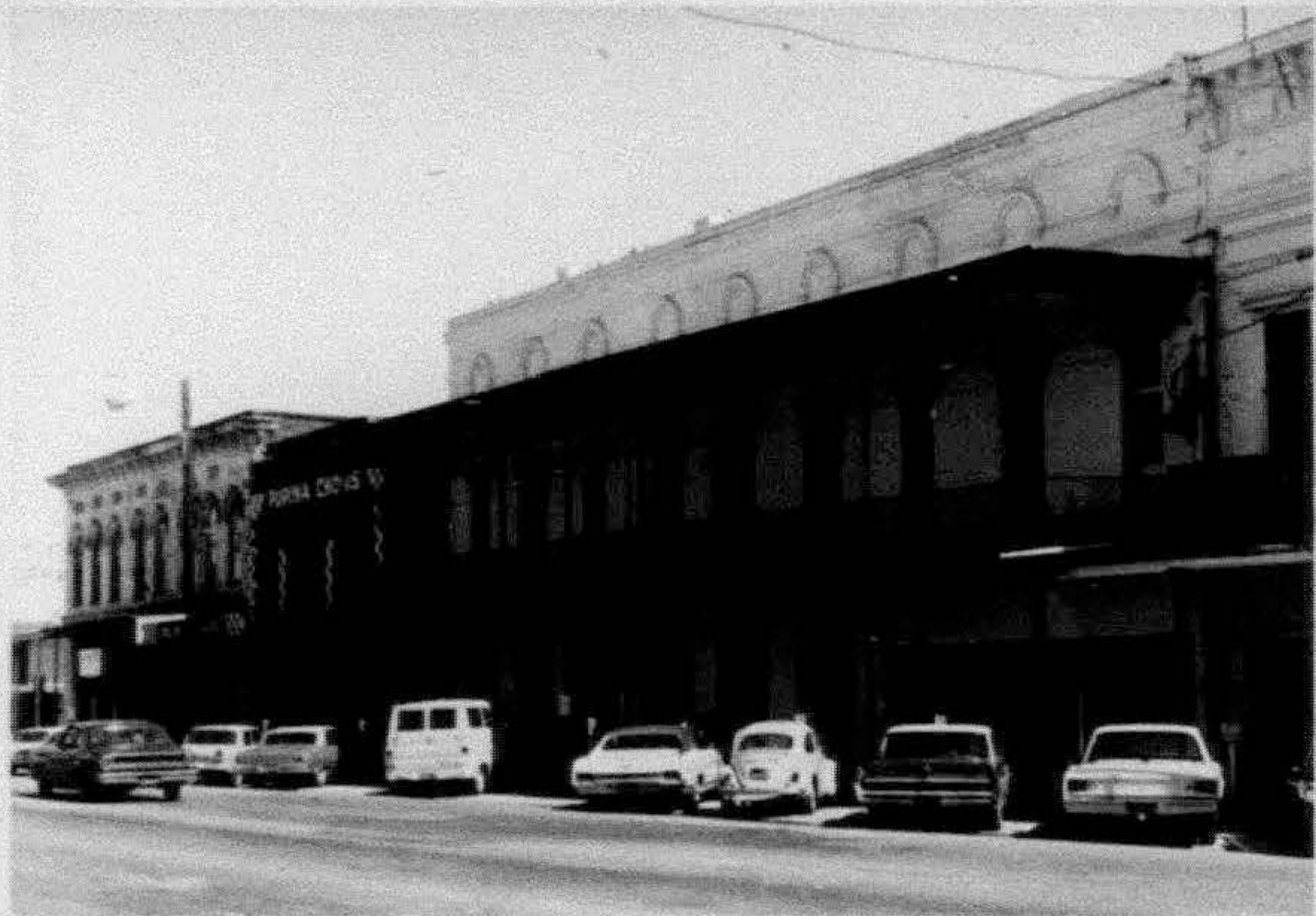
South side of Water between Franklin and Broad