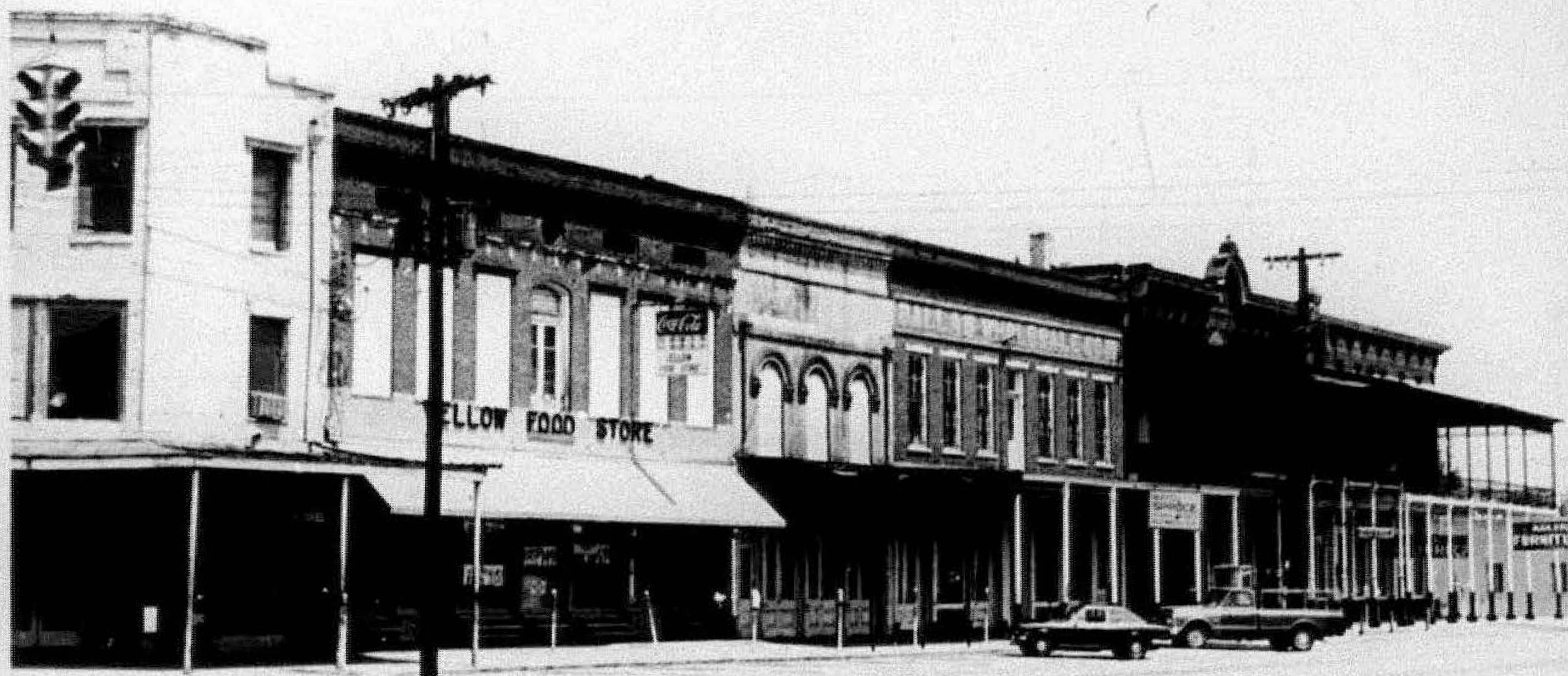
Northside of Water Avenue between Franklin & Washington