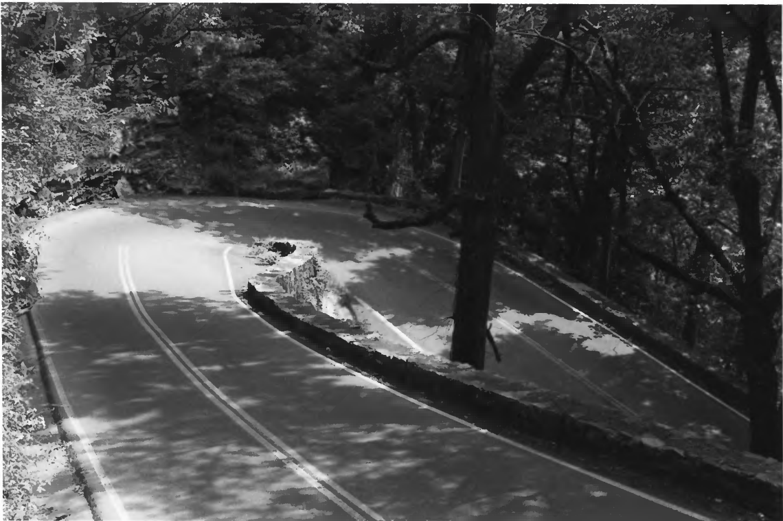
W ROAD HAMILTON CO. TN