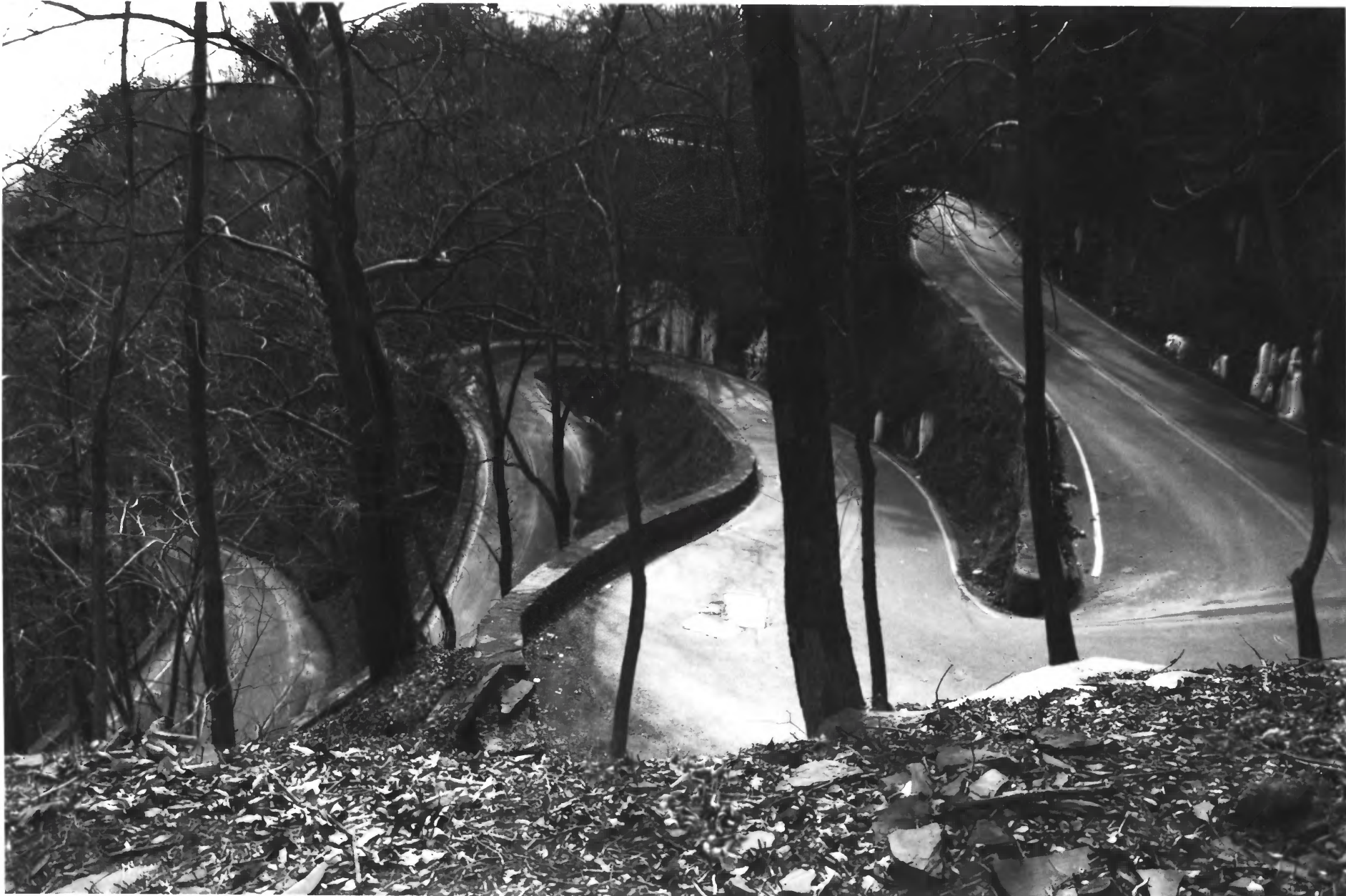
W ROAD HAMILTON CO. TN