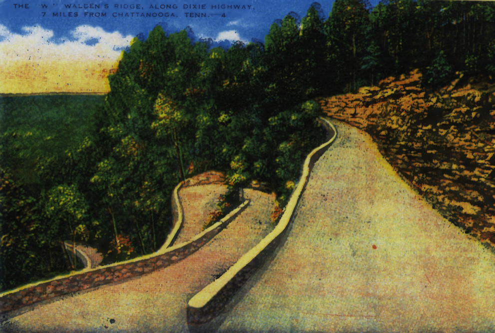
THE W. WALDEN S RIDGE, ALONG DIXIE HIGHWAY, 7 MILES FROM CHATTANOOGA, TENN. 4