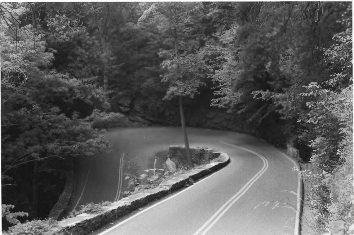
W ROAD HAMILTON CO. TN