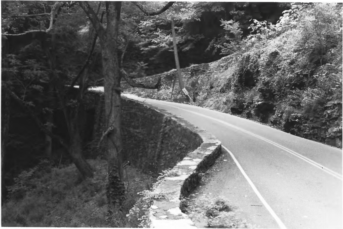
W ROAD HAMILTON Co. TN