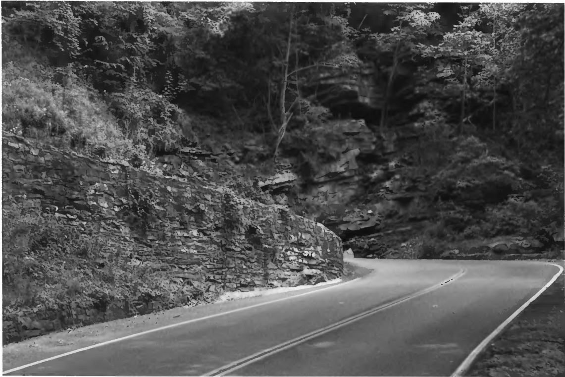
W ROAD HAMILTON CO. TN