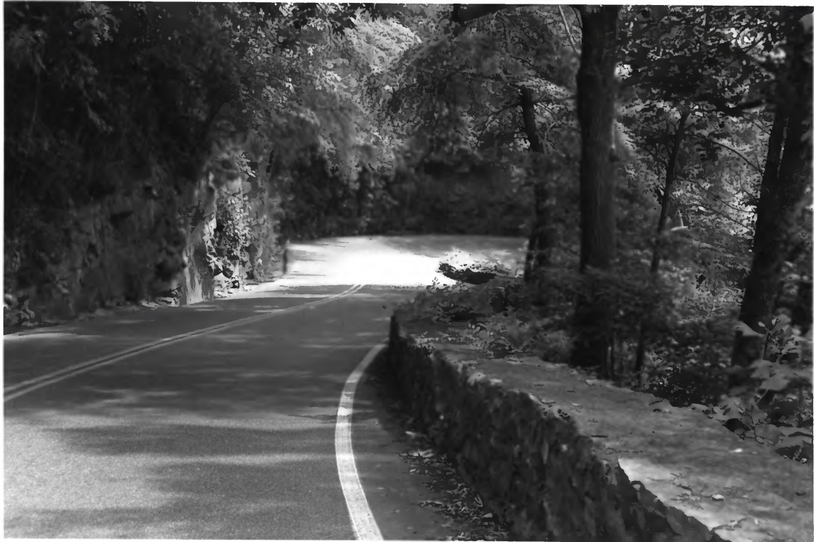
W ROAD HAMILTON CO. TN