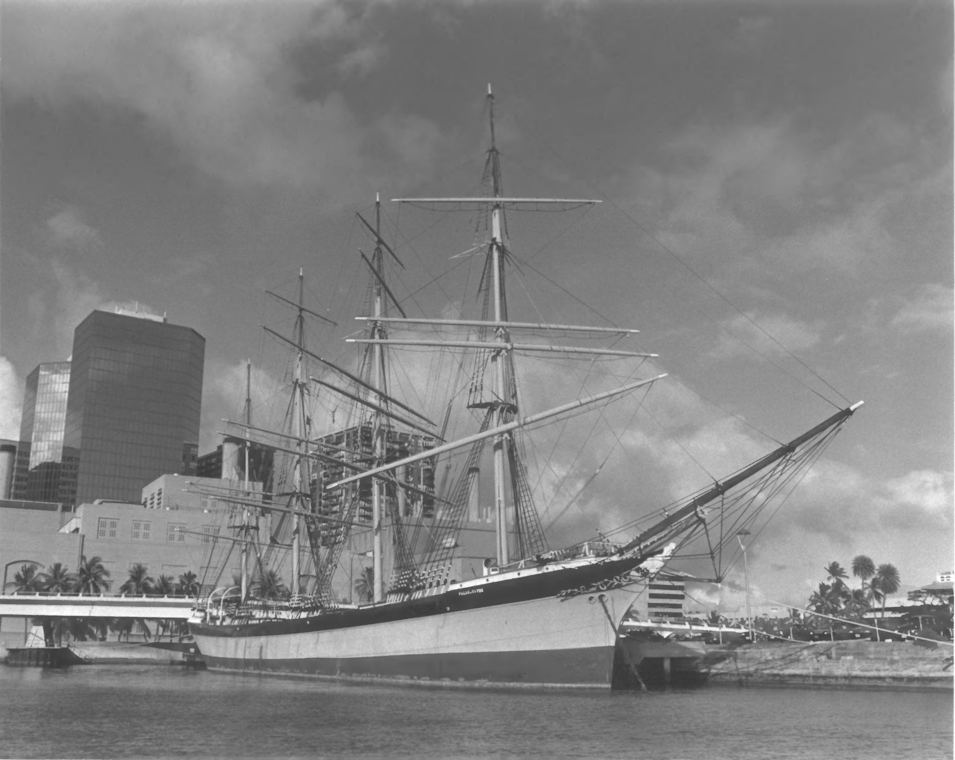
FALLS OF CLYDE, Honolulu, Hawaii Falls of Clyde as restored and on display at Pier 7, Honolulu. Photo #3