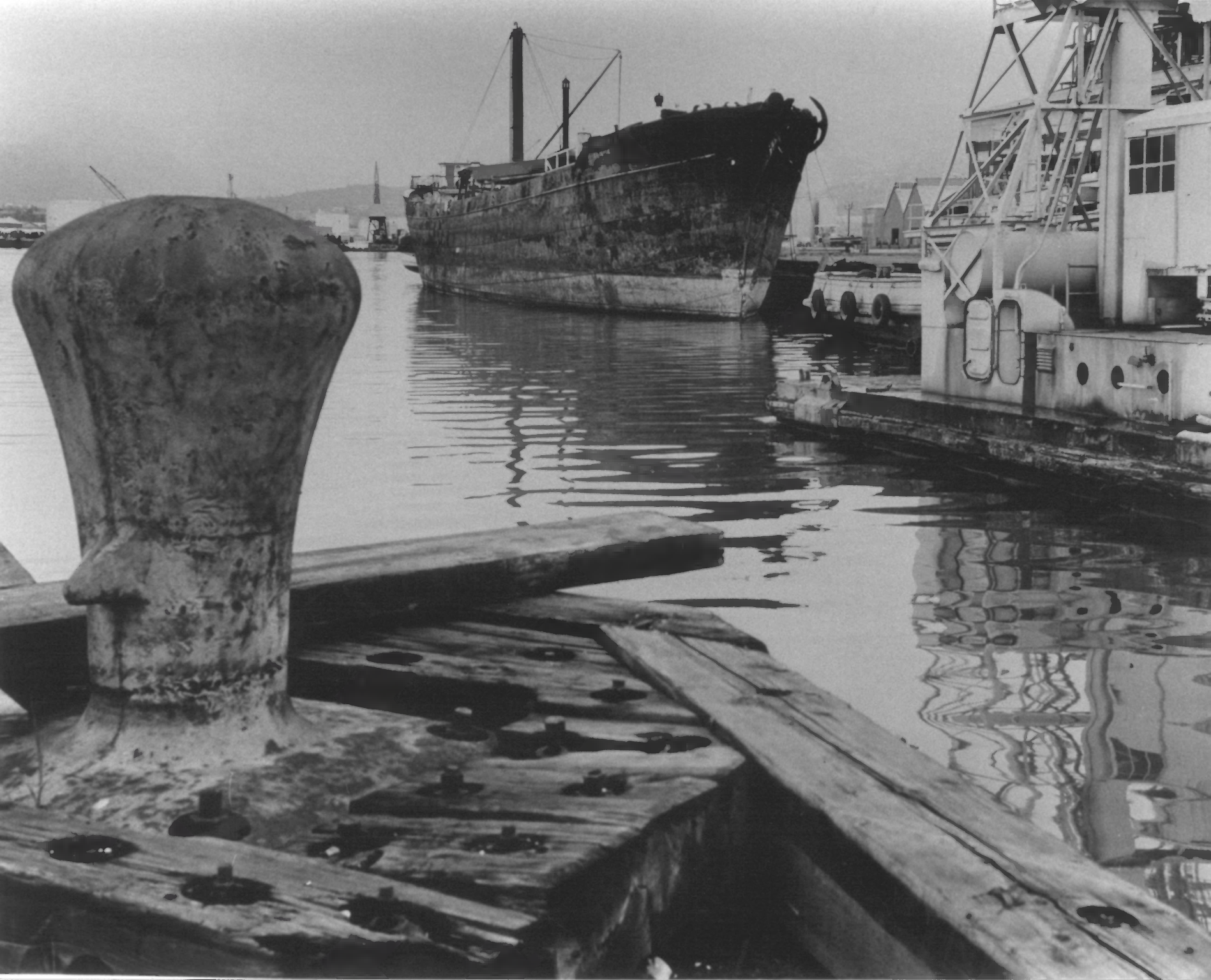
FALLS OF CLYDE, Honolulu, Hawaii Falls of Clyde as a Ketchikan fuel barge prior to restoration. Photo #2