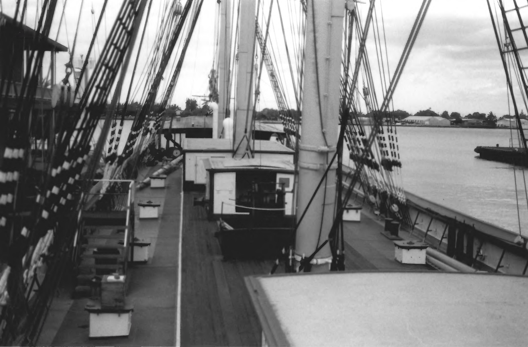
FALLS OF CLYDE , Honolulu, Hawaii National Park Service Photograph by James P. Delgado, 1988 Hawaii Maritime Center, Inc. Deck view showing deckhouses, forecastle, wooden and steel sections of the weather deck and oil tank expansion trunks. Photo #5