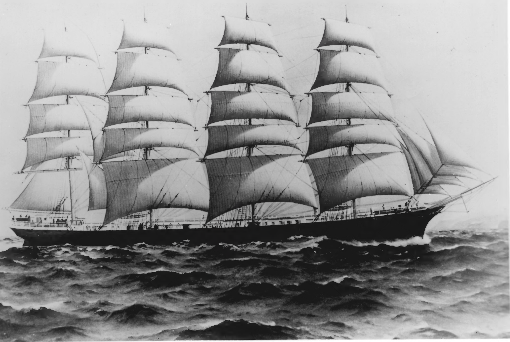
FALLS OF CLYDE , Honolulu, Hawaii Historic Photograph Courtesy of the Hawaii Maritime Center, Inc. Hawaii Maritime Center, Inc. Falls of Clyde as built in 1878 as a four- masted full-rigged ship. Photo #1