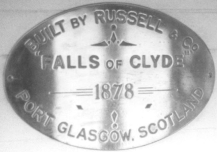
FALLS OF CLYDE, Honolulu, Hawaii Builder's name plate, Falls of Clyde. Photo #6