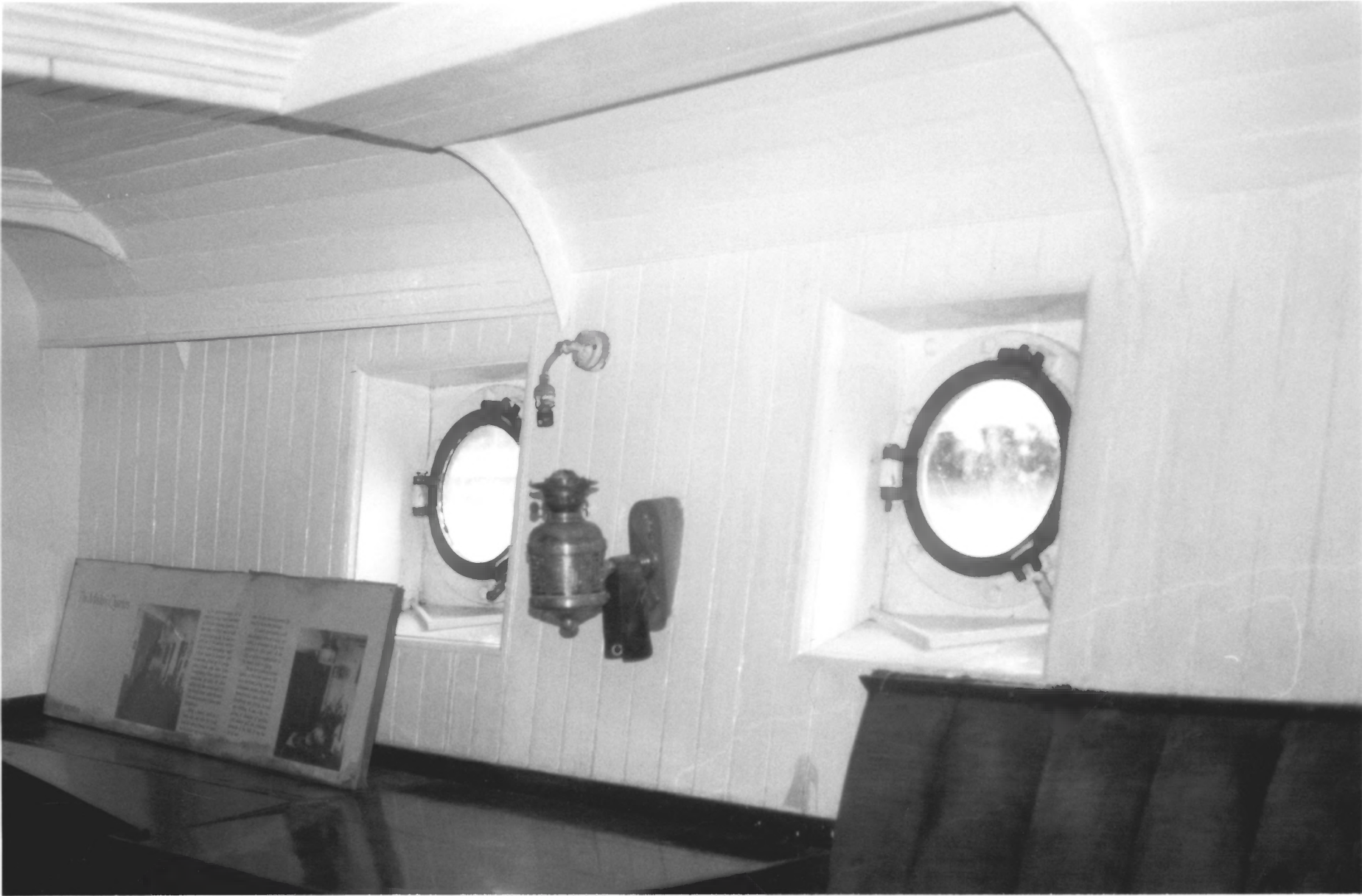
FALLS OF CLYDE, Honolulu, Hawaii Typical joiner's work--master's stateroom. Note deadlights. Photo #9