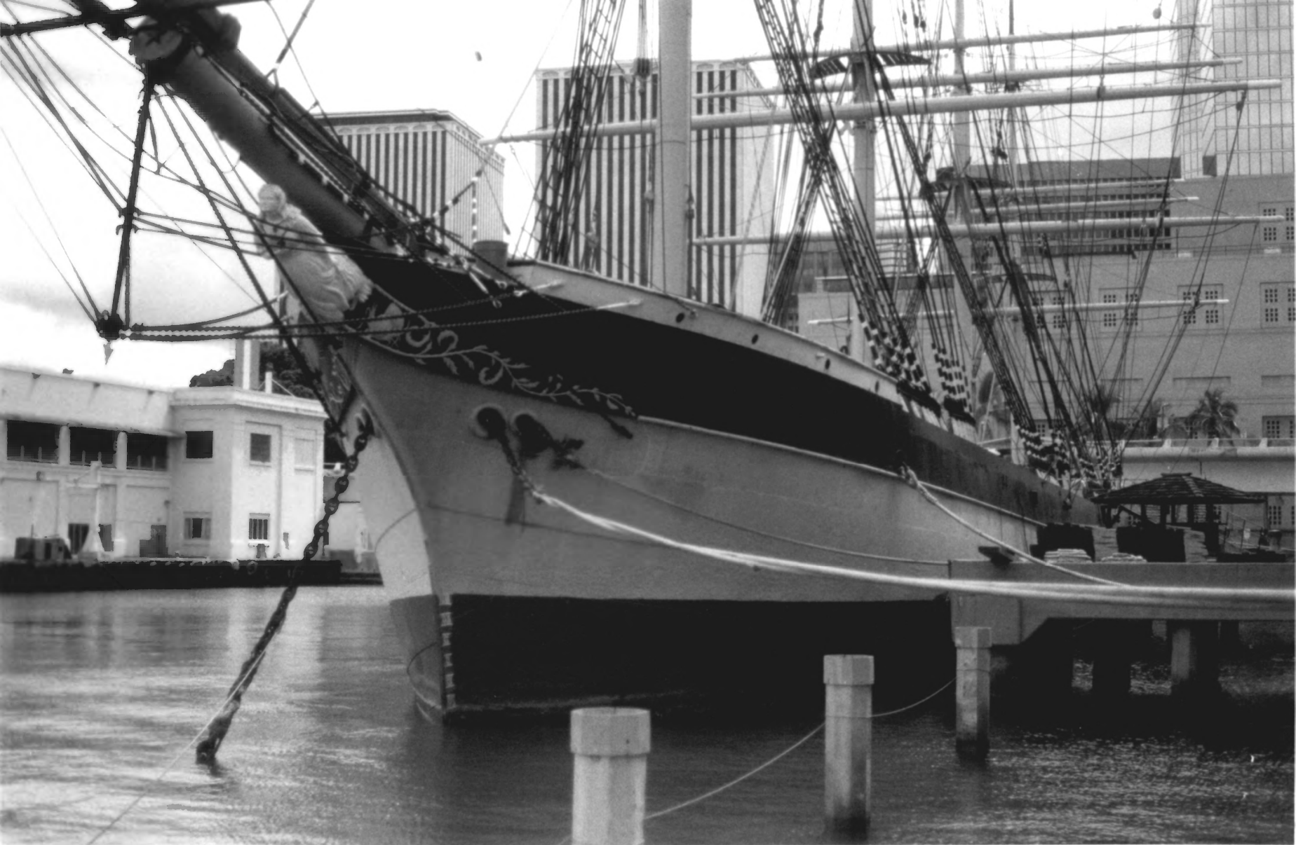
FALLS OF CLYDE, Honolulu, Hawaii Hawaii Maritime Center, Inc. Bow view, port quarter, Falls of Clyde. Photo #4