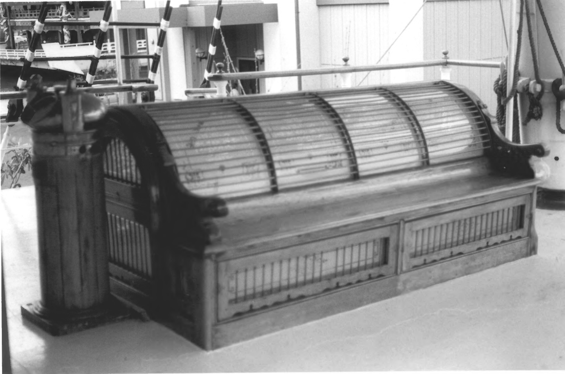
FALLS OF CLYDE, Honolulu, Hawaii Hawaii Maritime Center, Inc. Skylight on poopdeck and binnacle. Photo #8