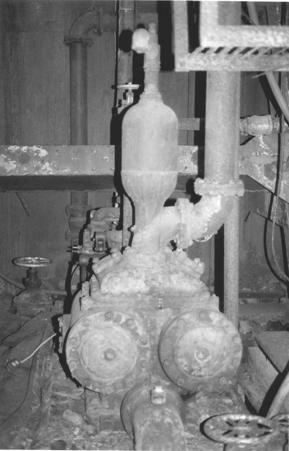
FALLS OF CLYDE, Honolulu, Hawaii Horizontal salt-water ballast pump in tanker pump room. Photo #10