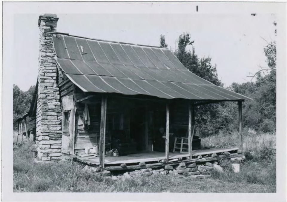
Historic Resources of Stone County Clark-King House, ST-153 Mountain View vicinity 1983 Viewed from the east