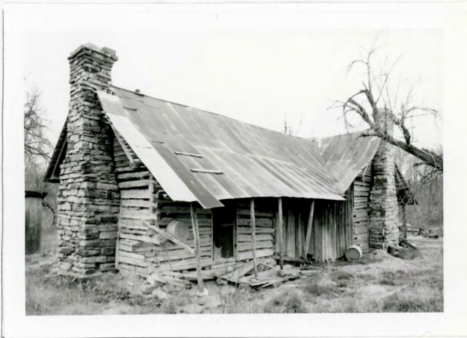
Historic Resources of Stone County Clark-King House, ST-153 Mountain View vicinity 1983 Negative on file at the AHPP Viewed from the southwest