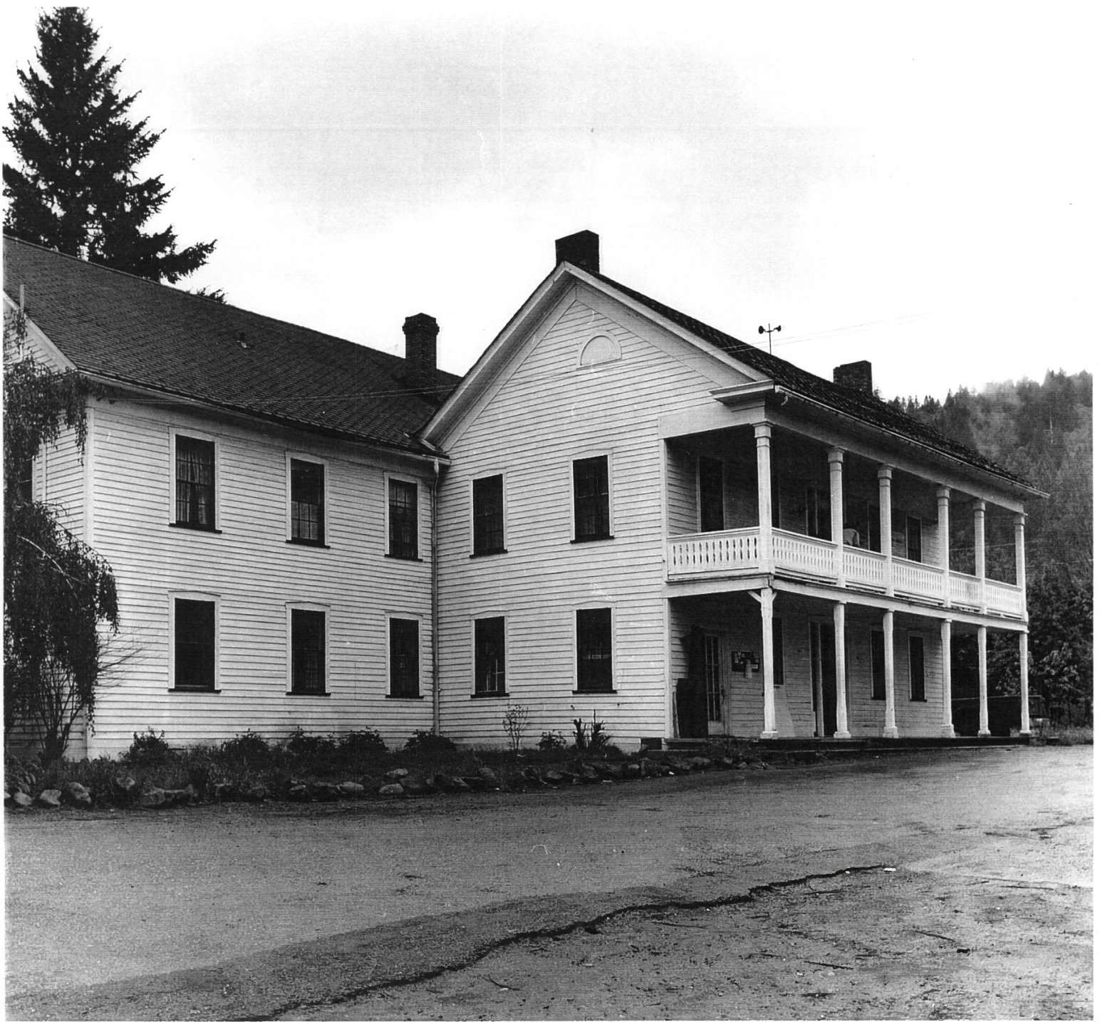
Wolf Creek Tavern - East face, c. 1970, prior to State acquisition, restoration, State Highway Dept.