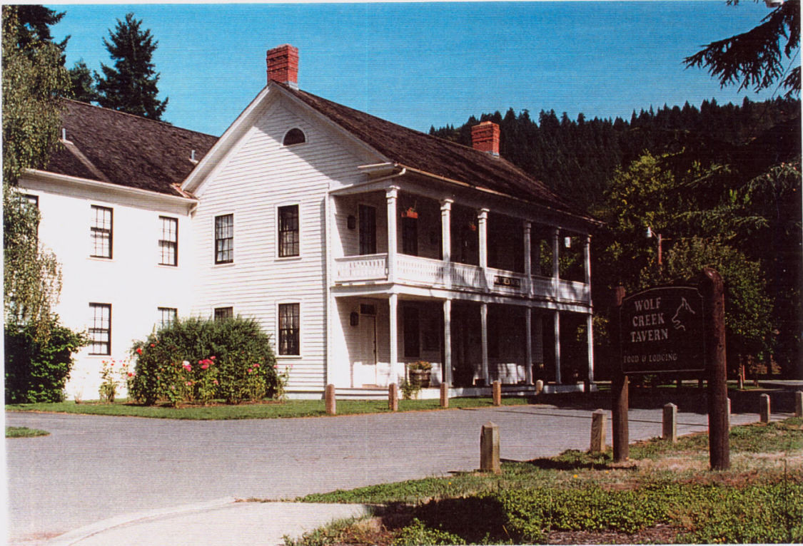
Wolf Creek Tavern - East front as restored, July 1992