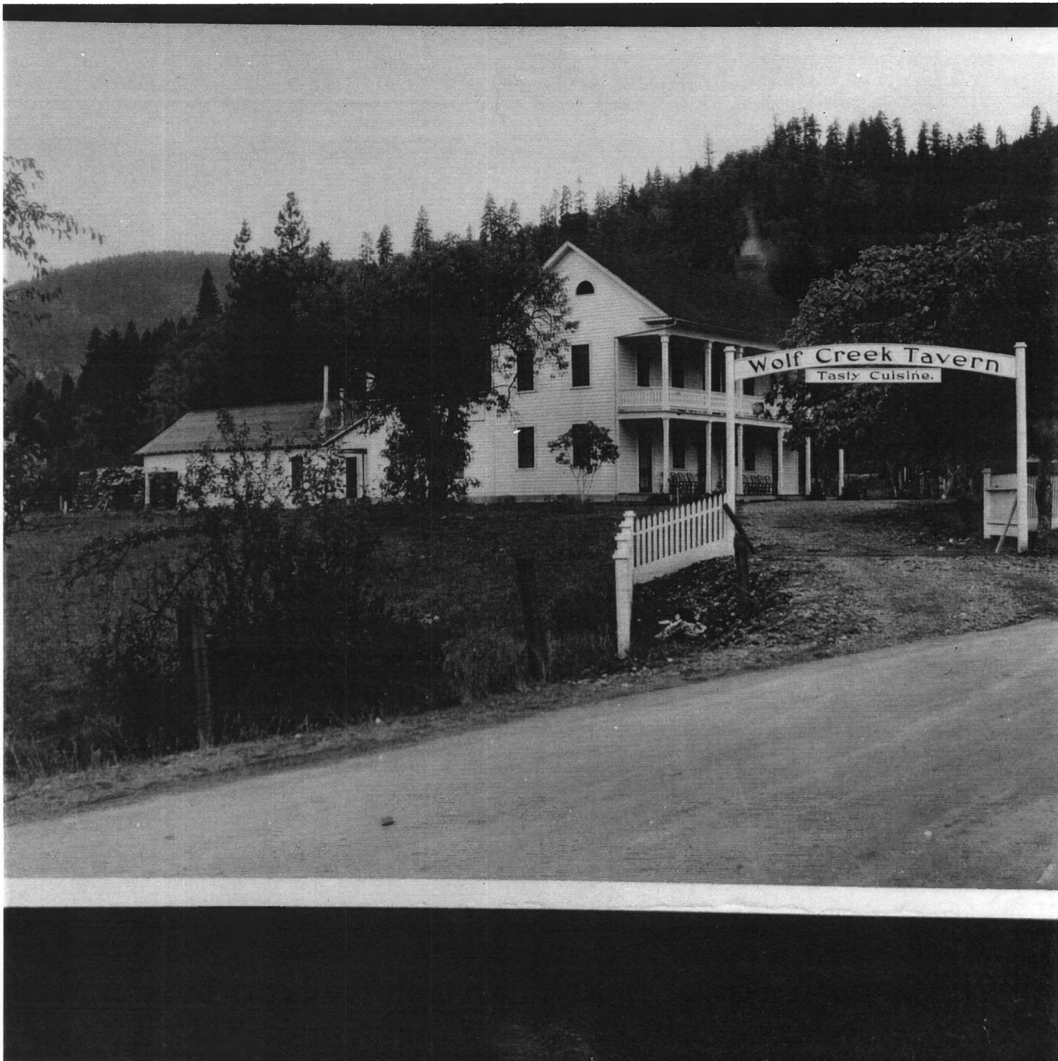
Wolf Creek Tavern - View from the southeast, c. 1922-1925, prior to construction of south wing