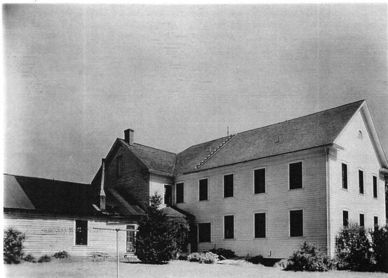
Wolf Creek Tavern, southwest view Historic American Buildings Survey ORE-17 1934