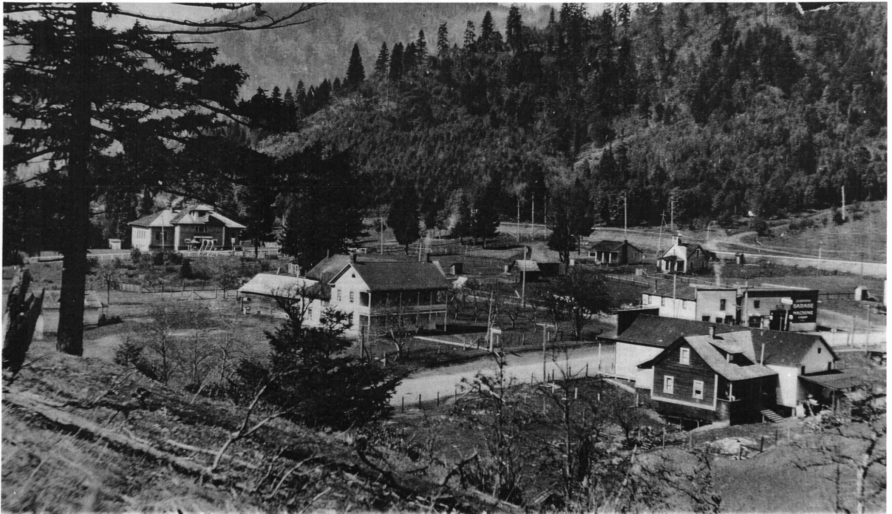
General view of Wolf Creek, c. 1920, looking west/northwest, photographer unknown. Pictured are the school, hotel, and rebuilt store on opposite side of highway. Note the one-and-a-half-story lean-to on the ell's south elevation which housed four sleeping rooms prior to construction of the eight-room guest wing in 1925. Also shown are the woodshed, parallel with the diningroom and kitchen ell, and, c. 100 feet to the south, an outbuilding understood to have been a cook's residence.