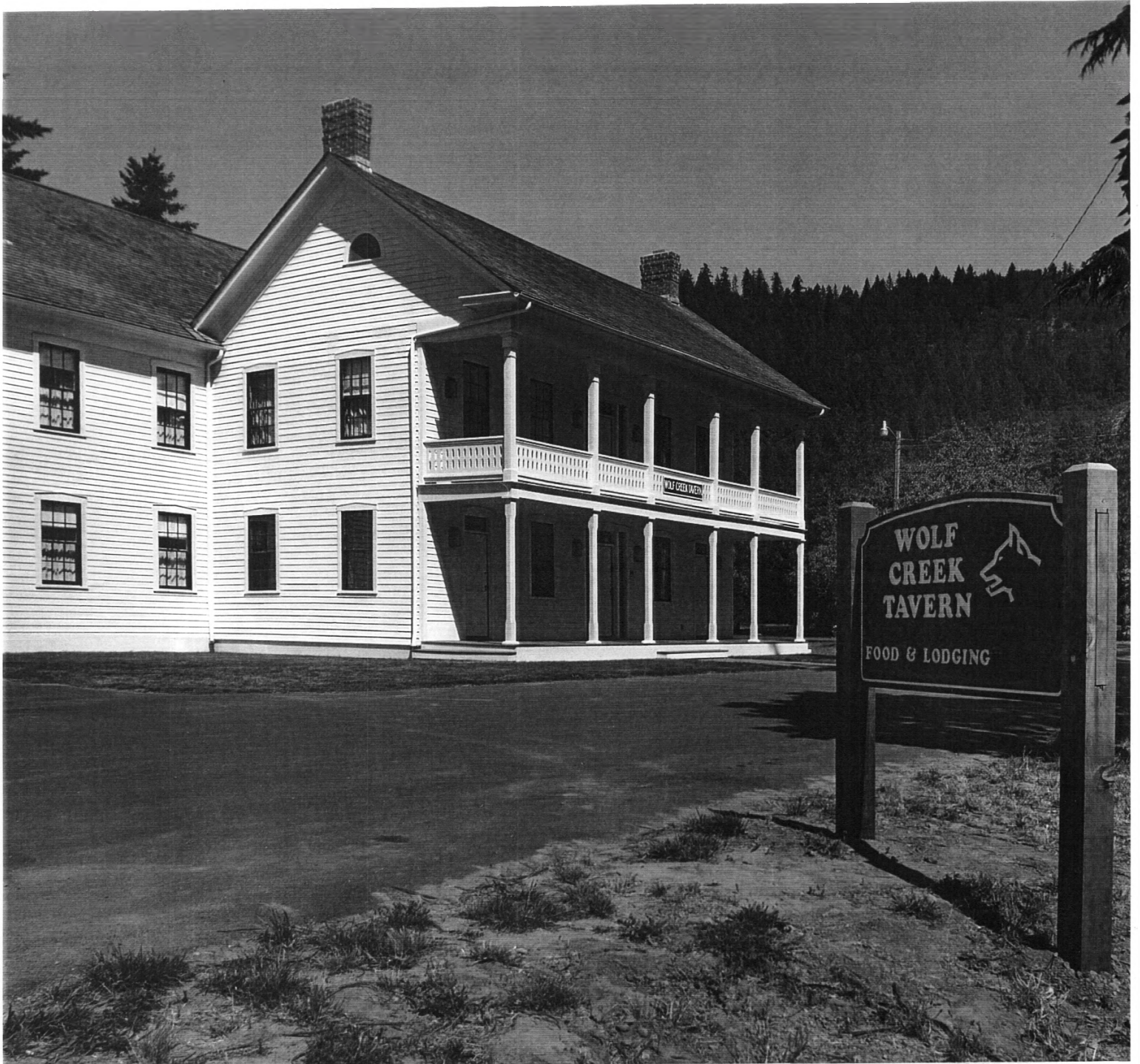
Wolf Creek Tavern - East face, c. 1980, after completion of 1976-1979 restoration