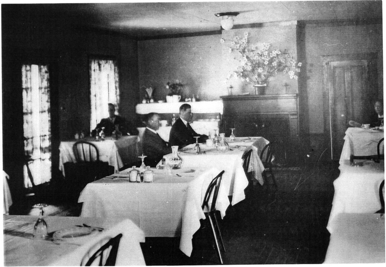
after Wolf Creek Tavern - Historic view, diningroom interior, prior to 1925