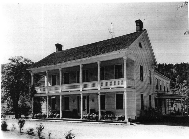
Wolf Creek Tavern, northeast view Historic American Buildings Survey ORE-17 1934