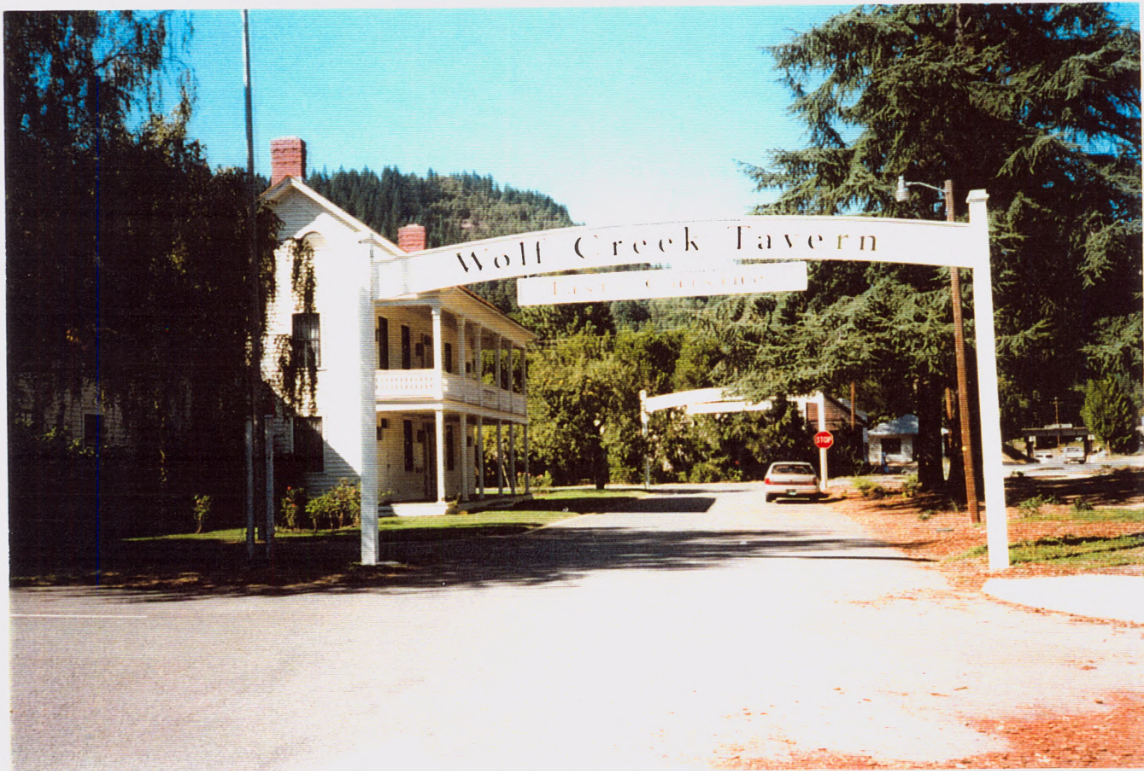
Wolf Creek Tavern - View to north, reconstructed entrance arches, 9-7-97