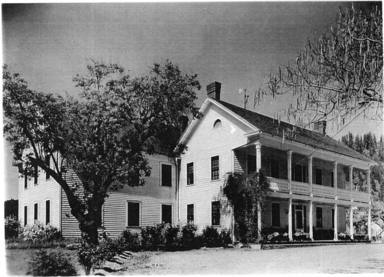
Wolf Creek Tavern, southeast view ORE-17 1934