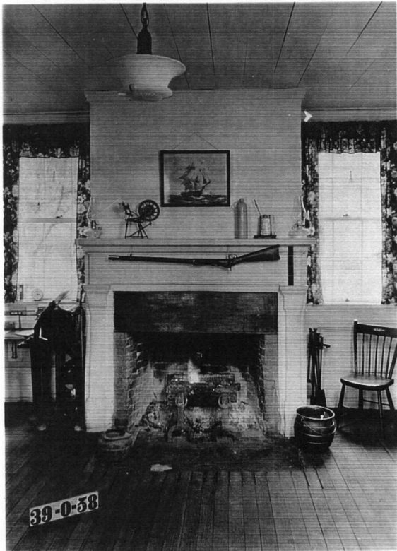
Wolf Creek Tavern, men's parlor Historic American Buildings Survey ORE-17 1934