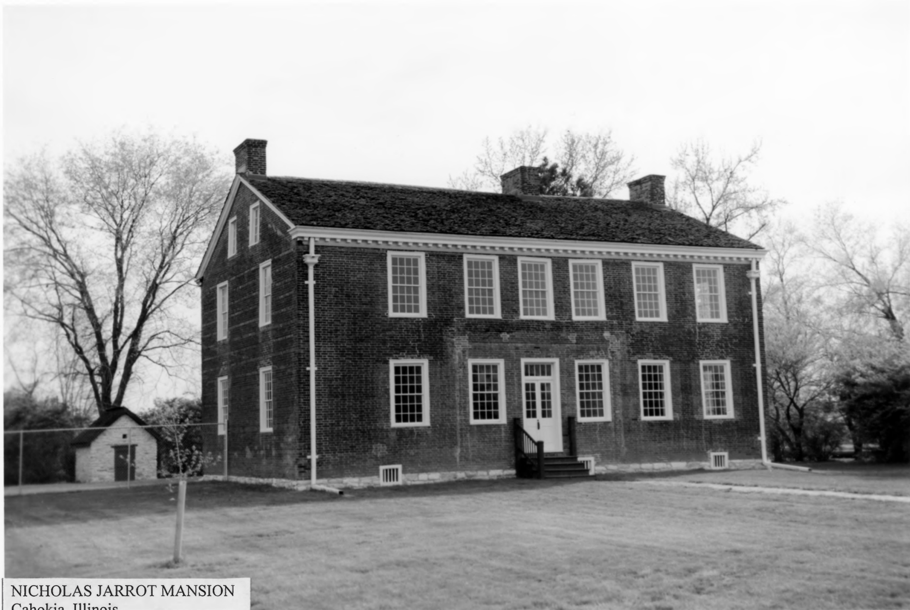
NICHOLAS JARROT MANSION Cahokia, Illinois North elevation, southwest view Photo by Jane Rhetta, 2000