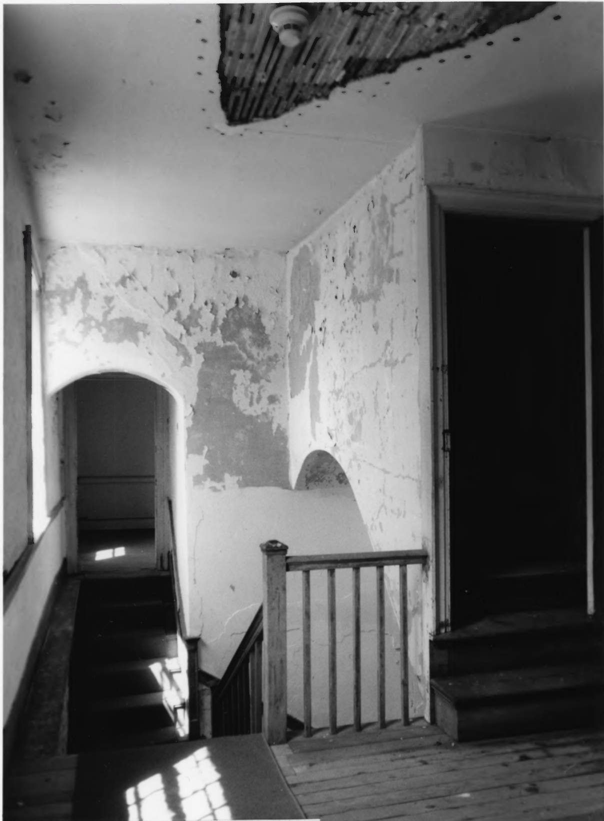
NICHOLAS JARROT MANSION Cahokia, Illinois Second floor view of stair assembly, Attic access (right), rear southwest room (left)