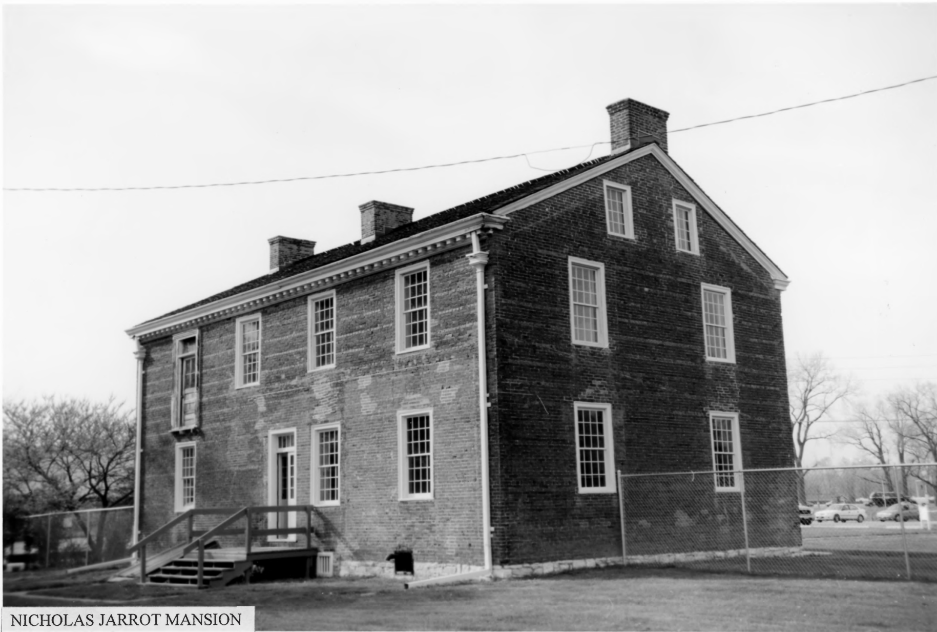
NICHOLAS JARROT MANSION Cahokia, Illinois South elevation, northwest view Photo by Jane Rhetta, 2000