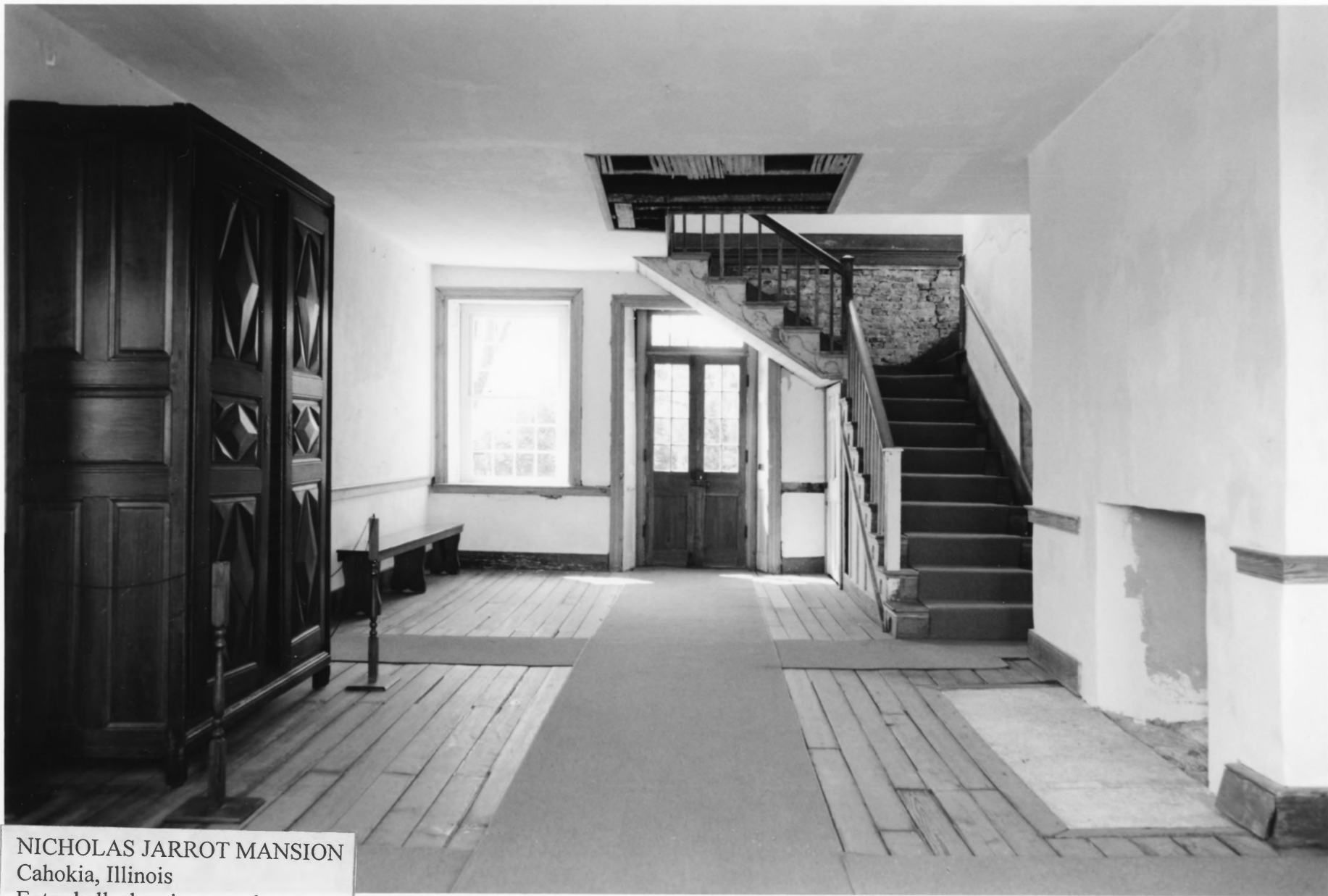
NICHOLAS JARROT MANSION Cahokia, Illinois Entry hall, showing rear doors South view Photo by Jane Rhetta, 2000