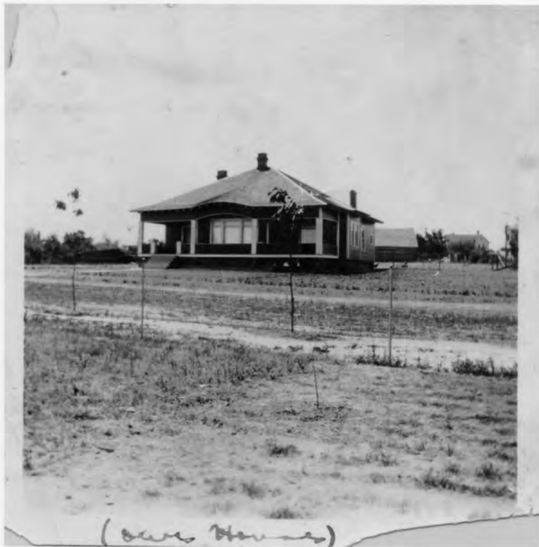
10. F. W. Welborn House 405 North Weston Street, Fountain Inn Greenville County, South Carolina