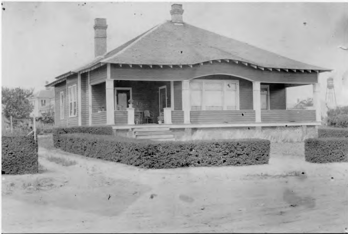
11. F. W. Welborn House 405 North Weston Street, Fountain Inn Greenville County, South Carolina