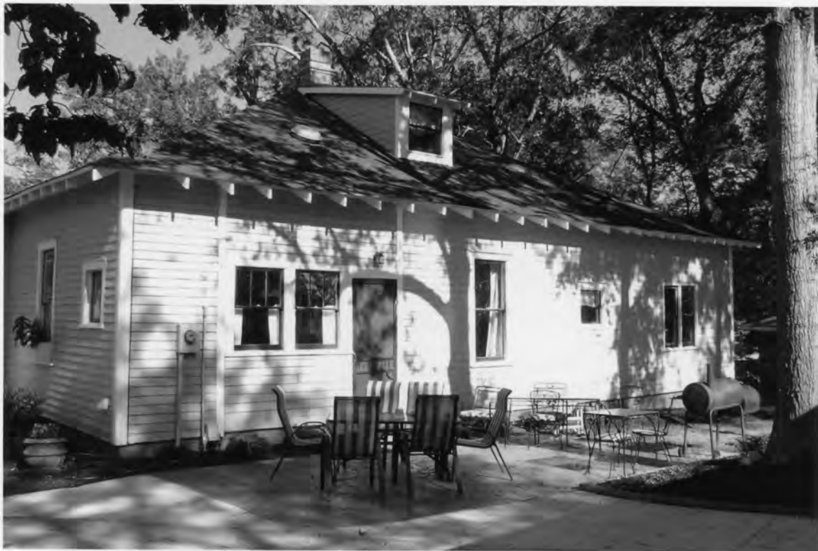
3. F. W. Welborn House 405 North Weston Street, Fountain Inn Greenville County, South Carolina