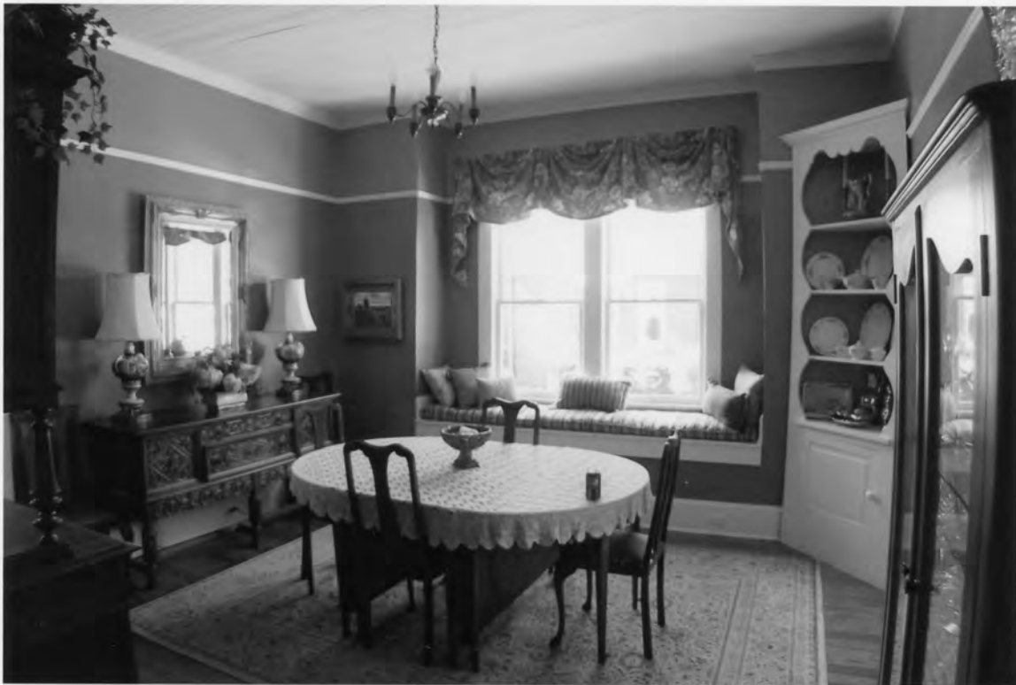
6. F. W. Welborn House 405 North Weston Street, Fountain Inn Greenville County, South Carolina