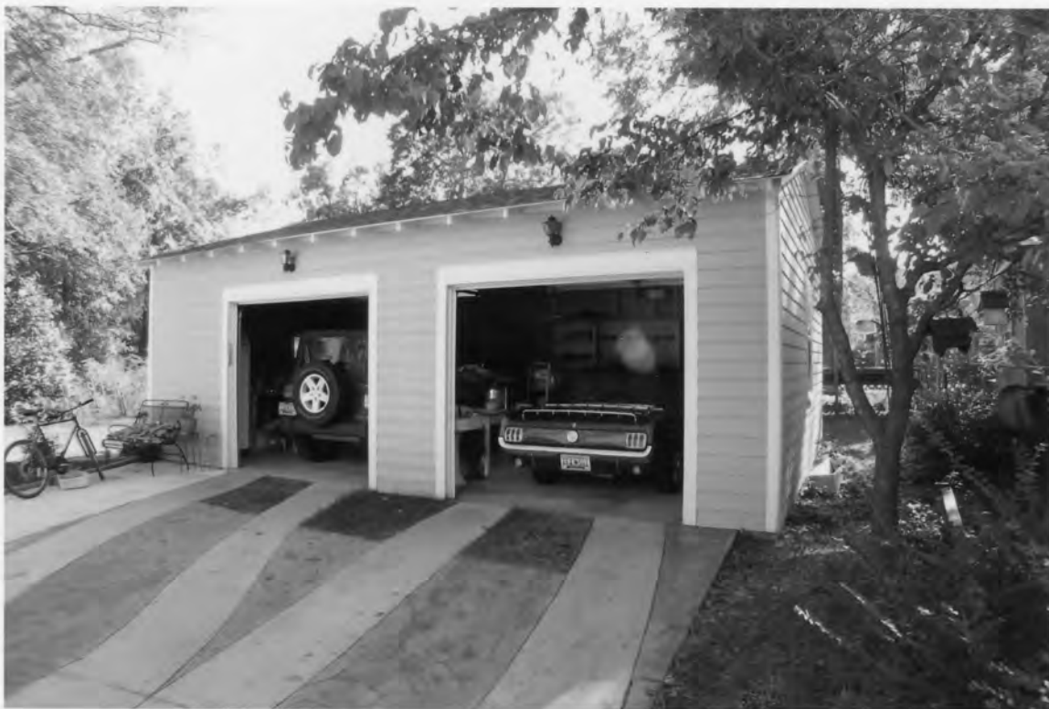
8. F. W. Welborn House 405 North Weston Street, Fountain Inn Greenville County, South Carolina

Modern two-car garage located behind the house (west elevation)