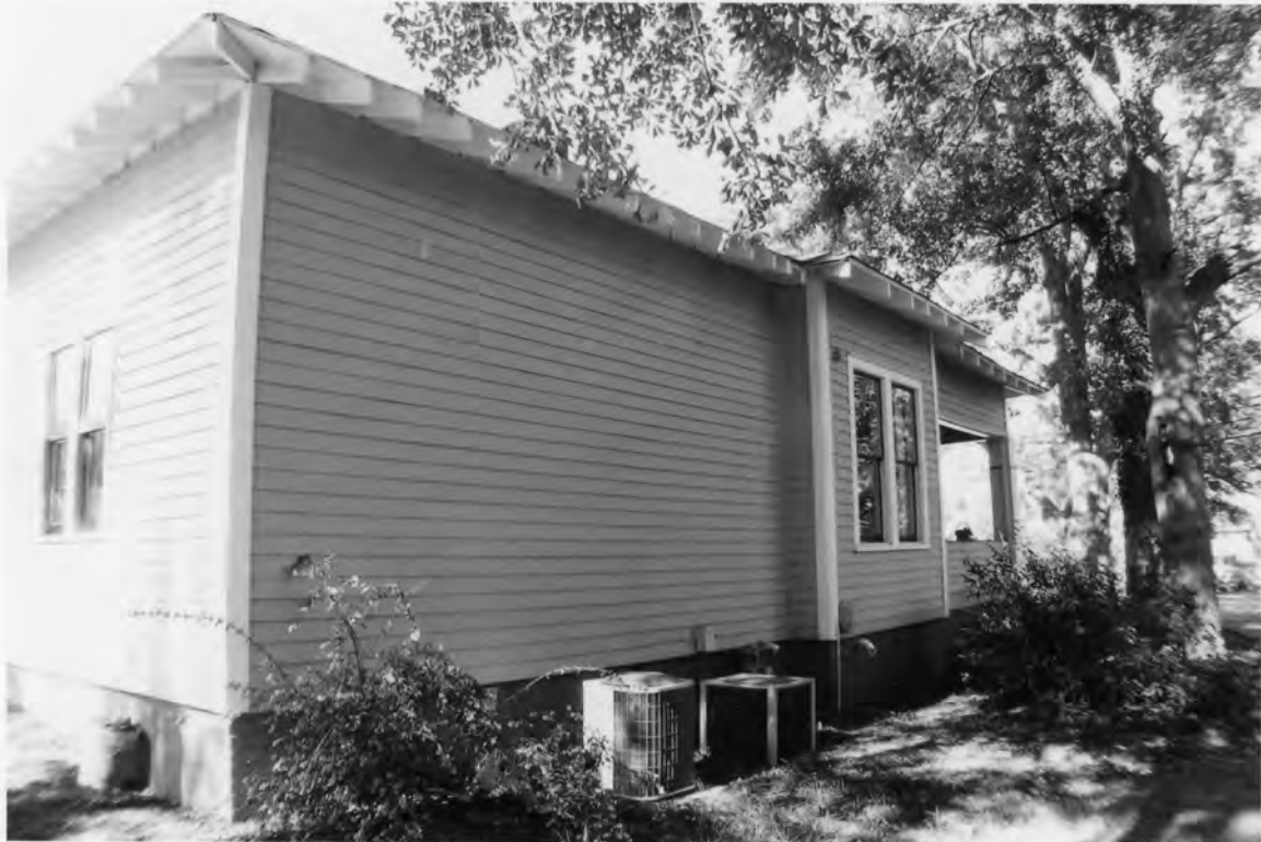
2. F. W. Welborn House 405 North Weston Street, Fountain Inn Greenville County, South Carolina