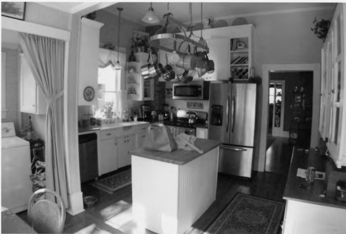
7. F. W. Welborn House 405 North Weston Street, Fountain Inn Greenville County, South Carolina