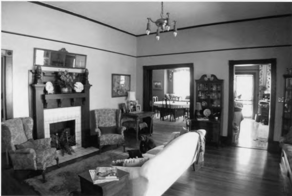
5. F. W. Welborn House 405 North Weston Street, Fountain Inn Greenville County, South Carolina