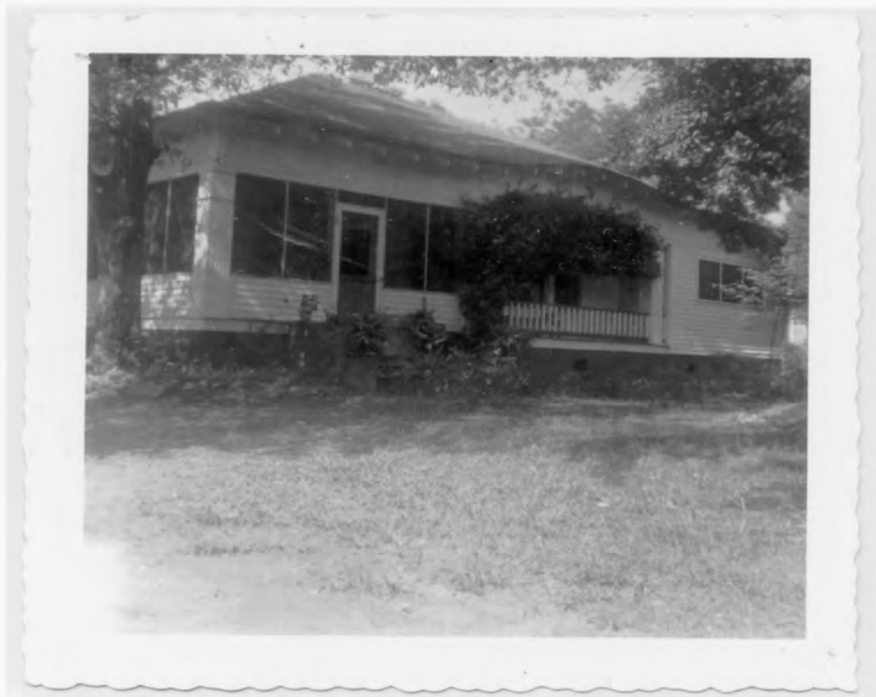
12. F. W. Welborn House 405 North Weston Street, Fountain Inn Greenville County, South Carolina