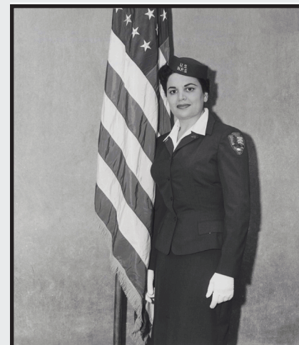
1961 Standard Women's Uniform