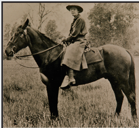
Before 1920 Temporary Ranger Riding Uniform (1st official uniform not authorized until 1920)