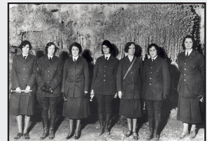
ca. 1930 - 1943 Standard NPS Uniform (with Breeches and Approved Alternative Skirt)