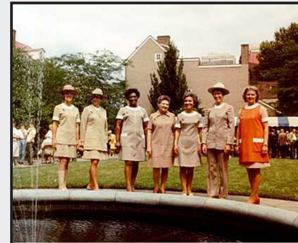
1970 - 1974 Women's Uniform Variations