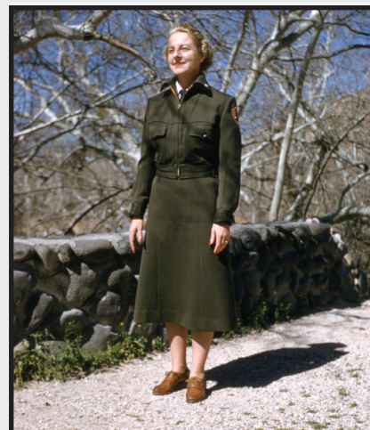
1956 - 1960 Standard Women's Uniform