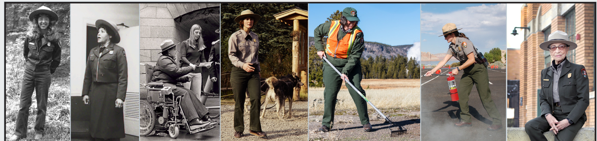
1978 - Today Class A Dress and Class B Field Uniforms