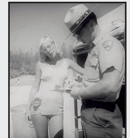
1974 - ca. 1982 Women's Lifeguard Uniform