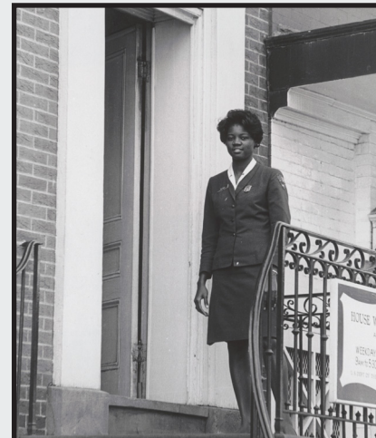
1962 - 1970 Standard Women's Uniform "Stewardess"