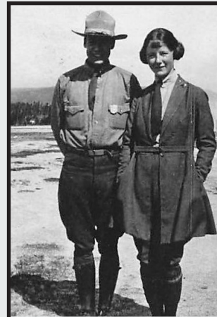
1920 - 1922 Prescribed Temporary Ranger Uniform