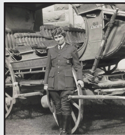
1923 - 1943 Standard NPS Uniform