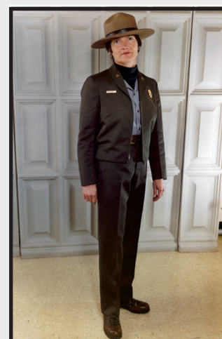
1974 - 1977 Women's Traditional Uniform