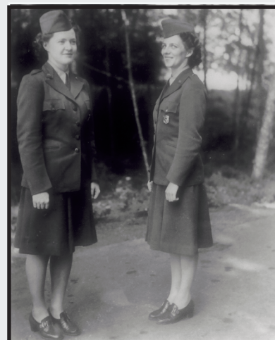
1943 - 1956 First Separate Women's Uniform