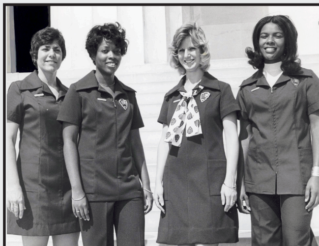
1974 - 1977 Women's Dress Uniform Variations