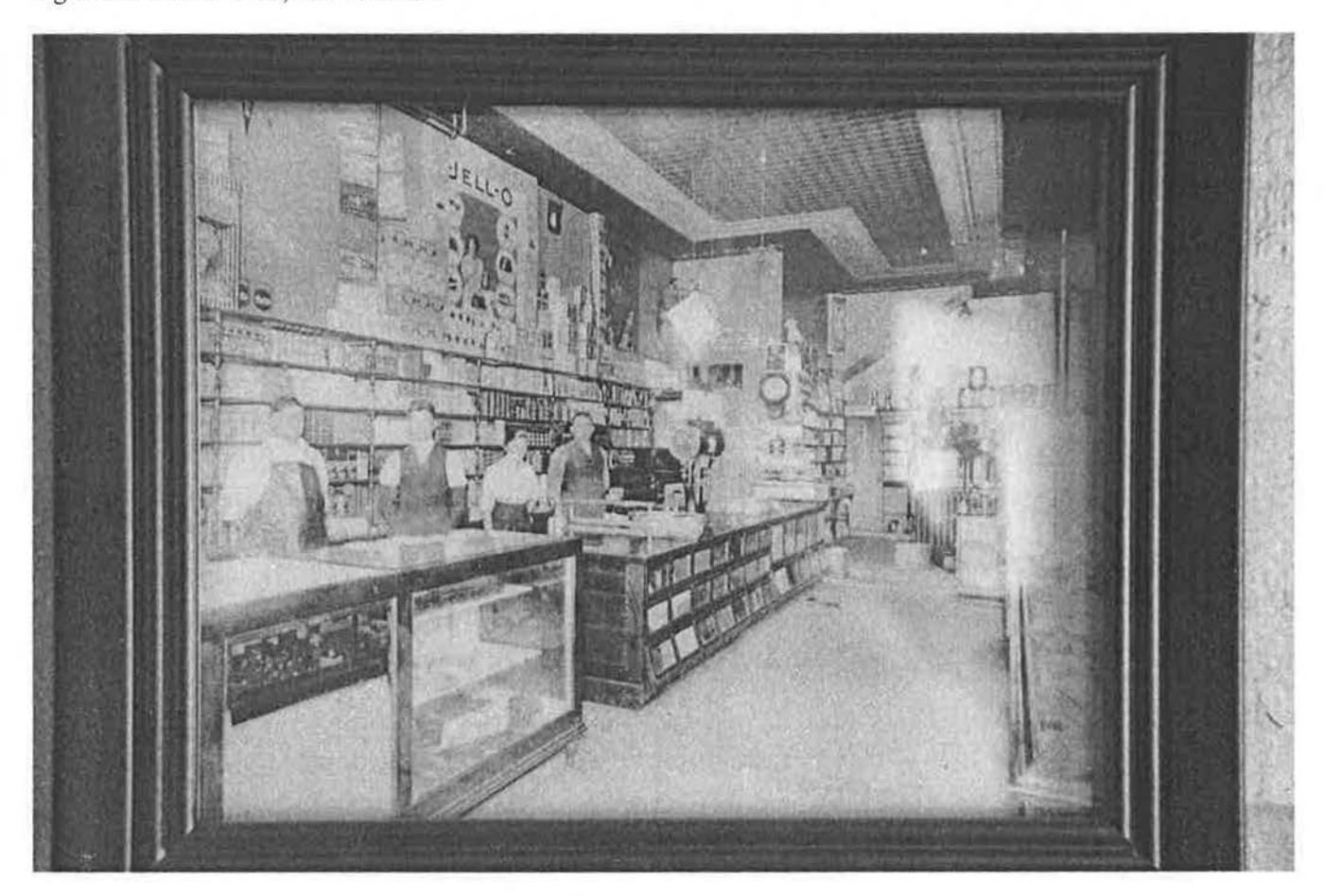
Figure #2: Interior View, date unknown