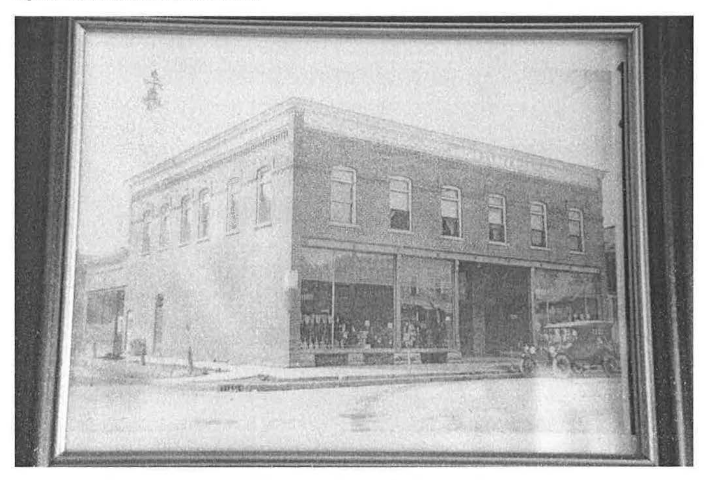
Figure #1: Front façade view, date unknown

Baeten, John, Store Building De Pere, Brown County, Wisconsin