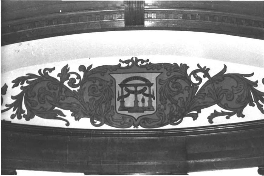
DETAIL - PAINTED CARTOUCHE OVER JUDGES BENCH