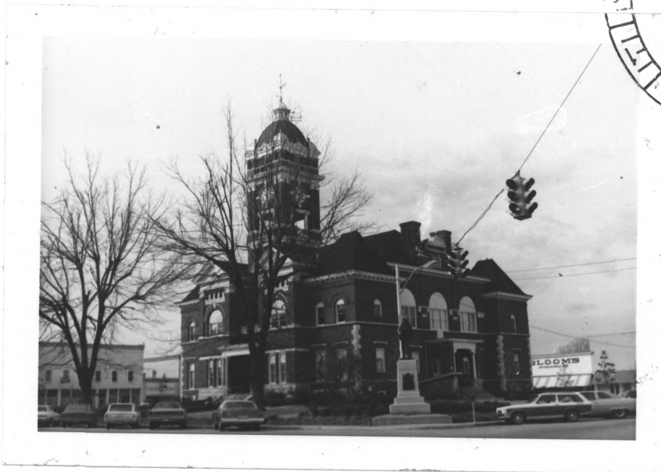
MONROE COUNTY COURTHOUSE