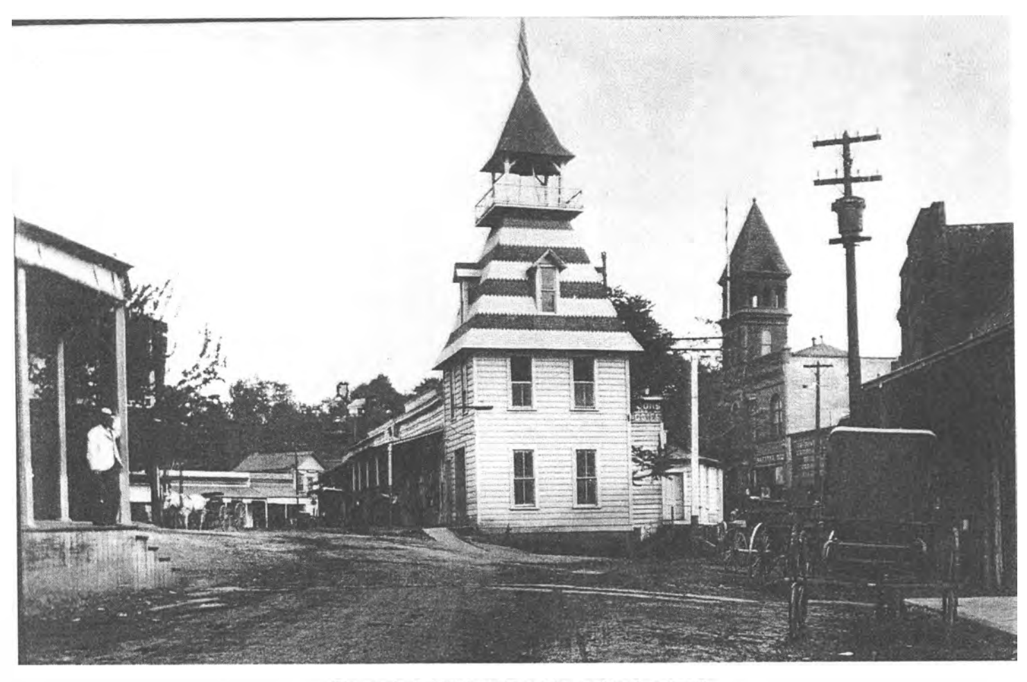
Figure 1 of 4 Historic Fire House No 2 c 1896