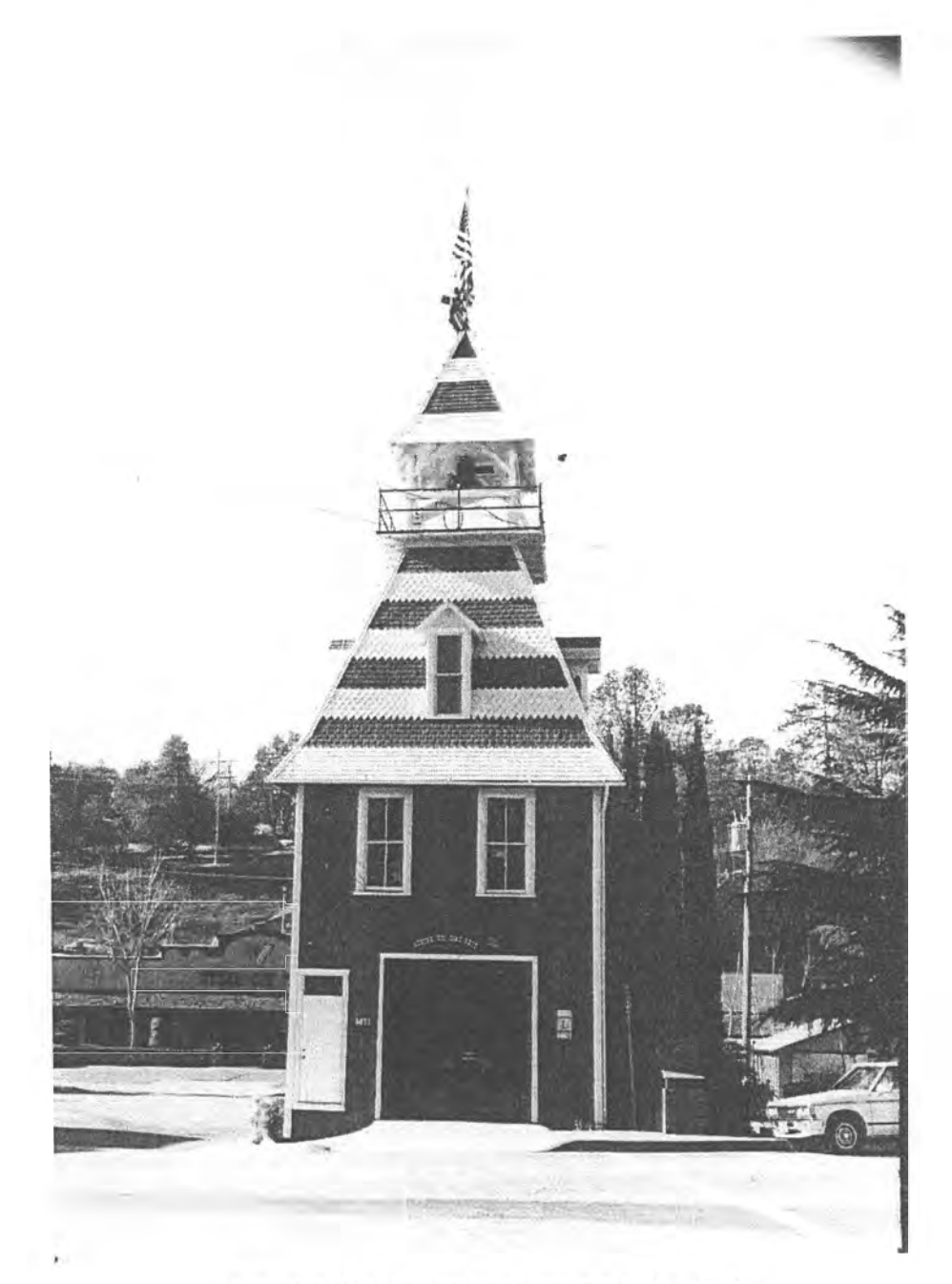
Figure 4 of 4 Historic Fire House No. 2 c 1980

Auburn Fire House No. 2 Name of Property Placer, CA County and State Architectural and Historic Resources of Auburn, California Name of multiple listing (if applicable) Page 12