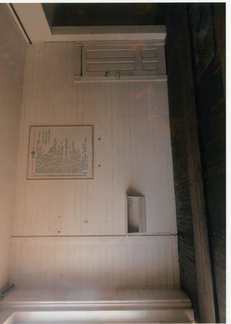
2. AUBURN FIRE HOUSE NO. 2 PLACER COUNTY, CA

I. AUBURN PIRE HOUSE NO. 2 PLACER COUNTY, CA