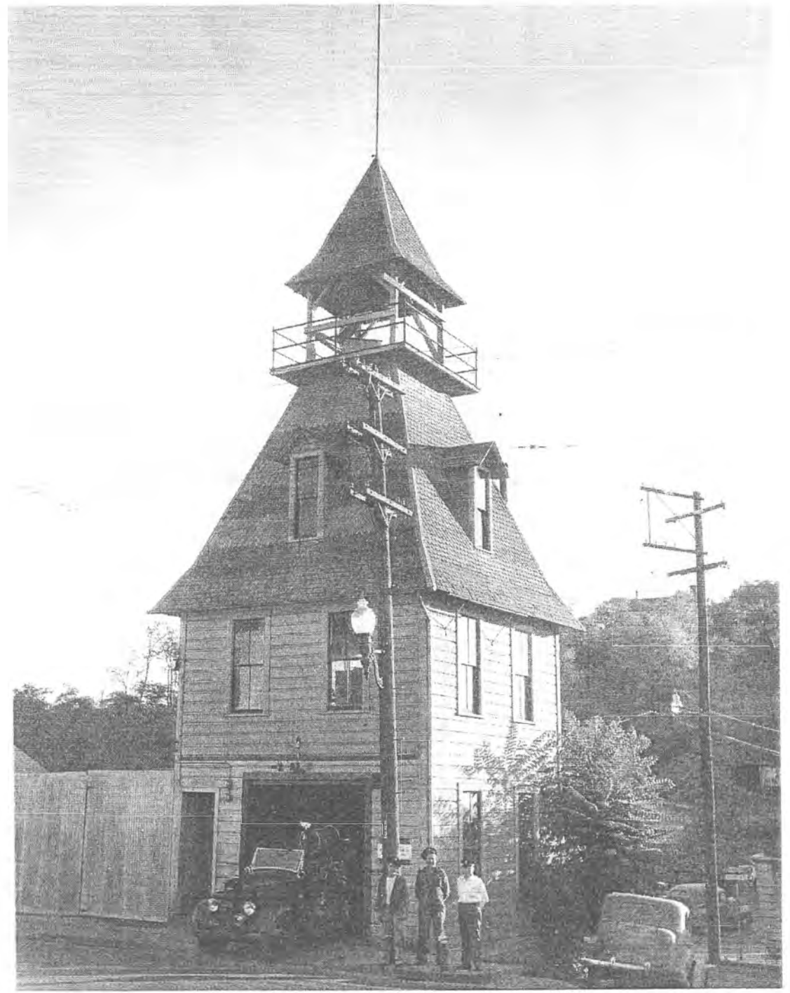
Figure 2 of 4 Historic Fire House No 2 c. 1940