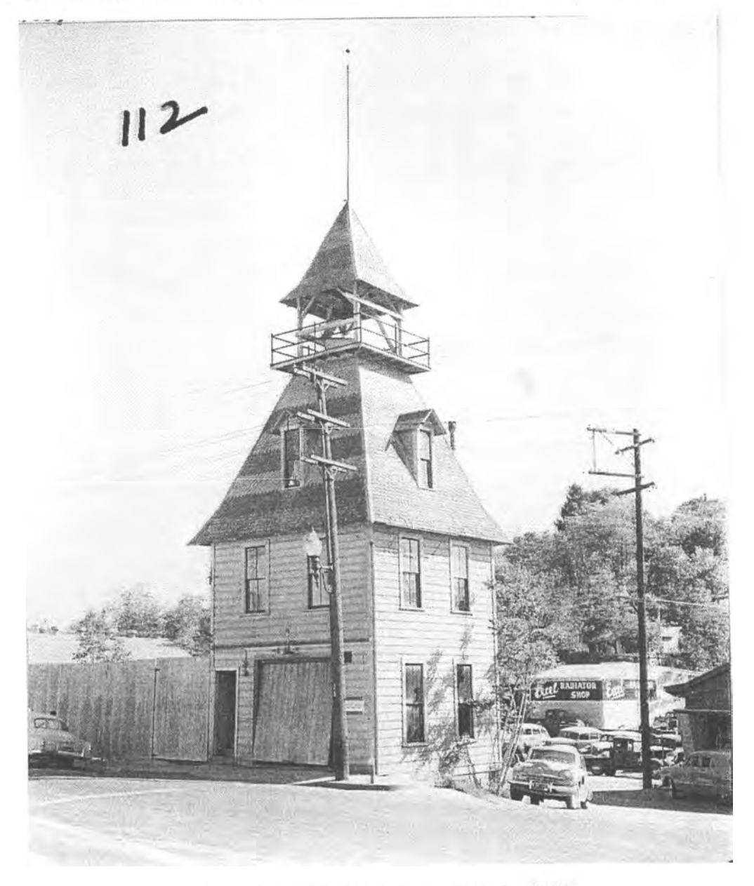
Figure 3 of 4 Historic Fire House No. 2 c.1954