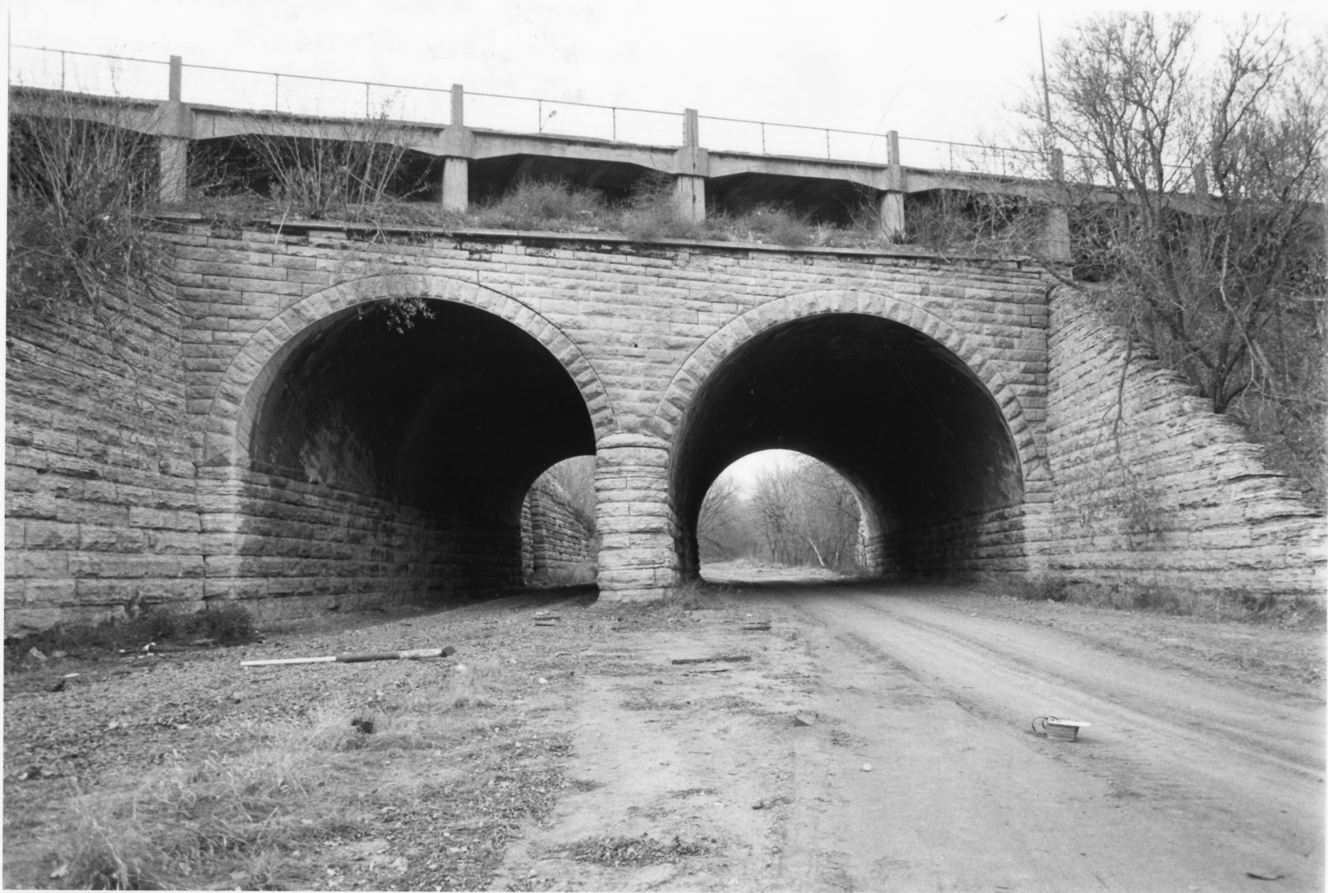
SEVENTH STREET IMPROVEMENT ARCHES BRIDGE # 90836 RAMSEY CO. MN PHOTO I.D. 09131 # 12