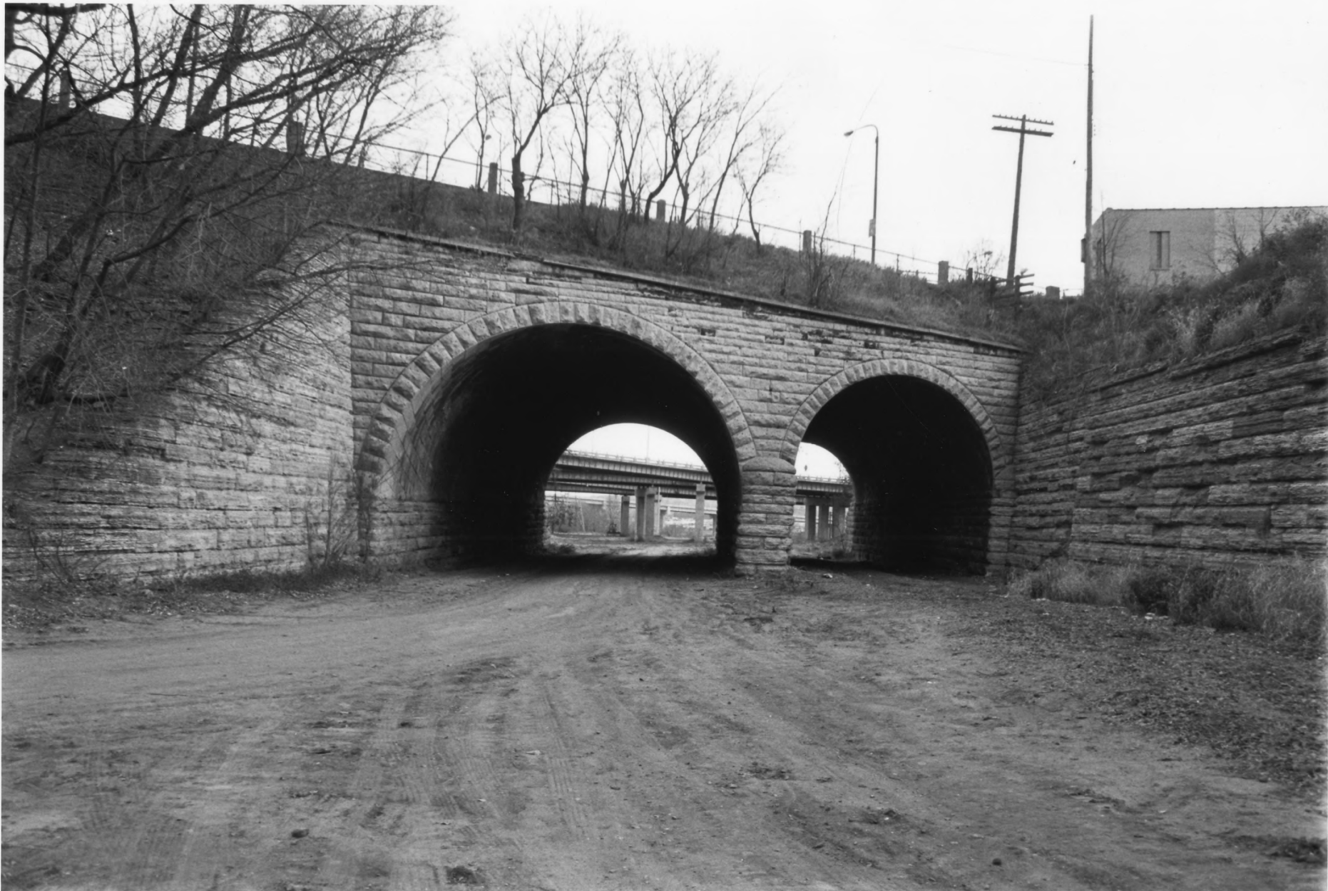
SEVENTH STREET IMPROVEMENT ARCHES BRIDGE # 90836 RAMSEY CO., MN PHOTO I.D. 09131 #4