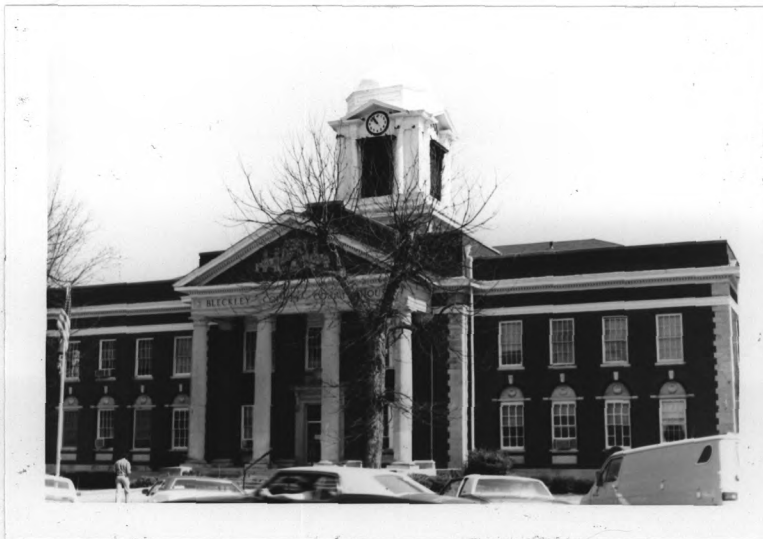
BLECKLEY COUNTY COURTHOUSE