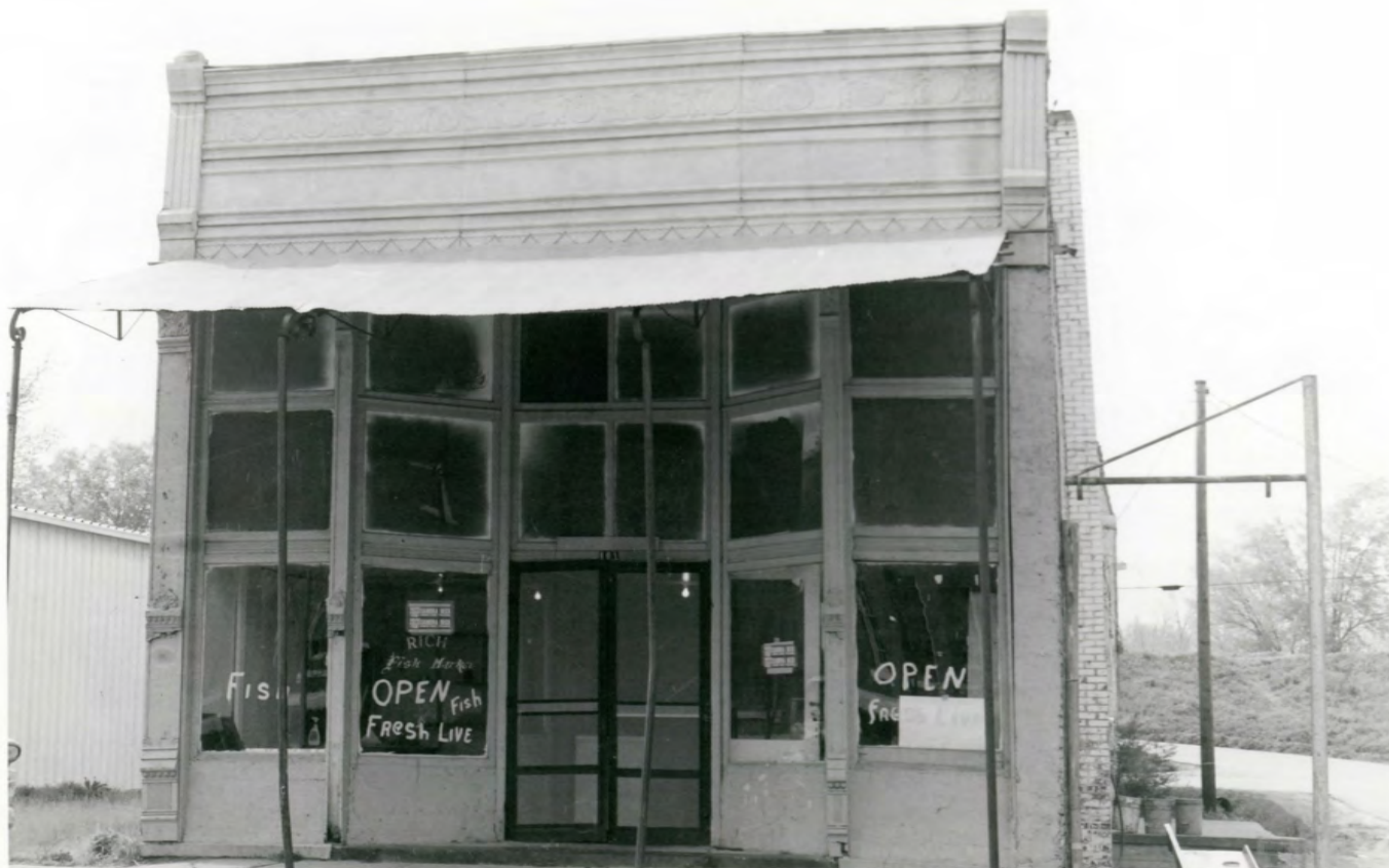
CL-4 Goldman and Son Store HISTORIC RESOURCES OF CLARENDON Negatives at AHPP Viewed from the East