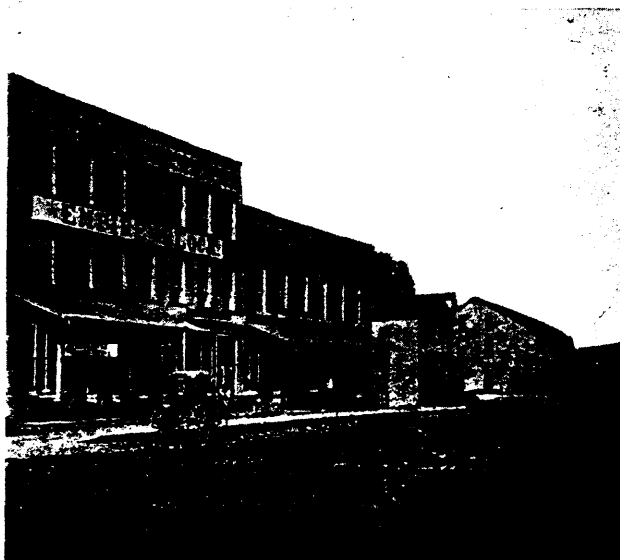
East Main Street, 1856