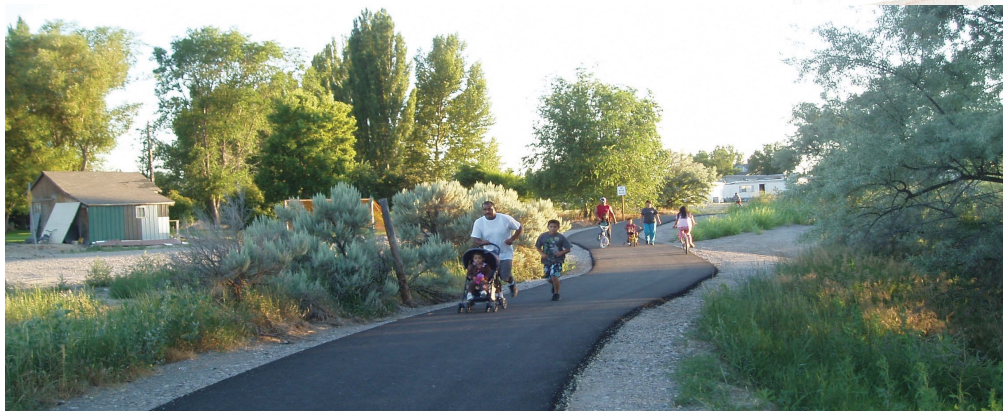
Aberdeen residents enjoy the Hazard Creek Trail, part of a network of in-town trails designed to provide safer places to recreate. Sketch: Alissa Salmore