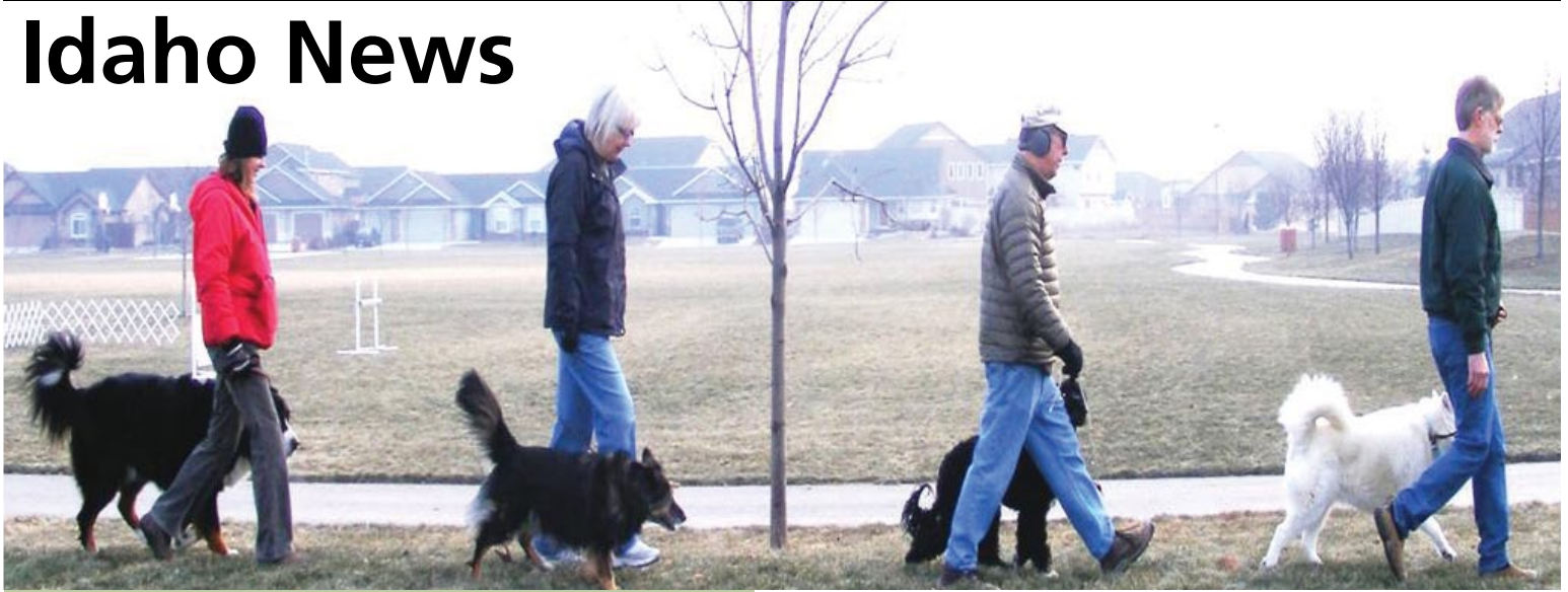
Boise River Trail partners published a guide highlighting the health benefits of community trails.