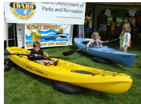
Idaho Department of Parks and Recreation promotes boating and safety outreach at last year's "Unplug" event.

RTCA will work with project partners on a master plan for trail development, interpretation, and restoration at the Conservation Area, which is in walking distance of the Boise River and near Idaho Parks & Recreation Headquarters and the Idaho Shakespeare Outdoor Amphitheater. A design workshop for youth, co-sponsored by the NPS and the American Society of Landscape Architect's Idaho/Montana Chapter, will be a component of the second