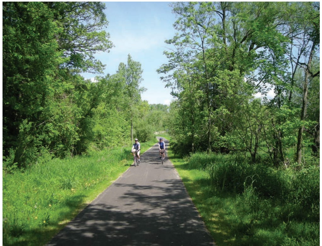
Goodhue Pioneer Trail.

As the Task Force sees it, achieving their vision for a countywide trail network will increase recreational opportunities; connect people to the history, culture, and natural beauty of their county; and increase tourism.