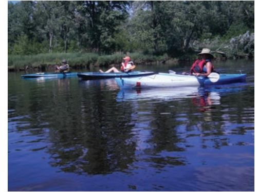
Paddling the St. Croix River.