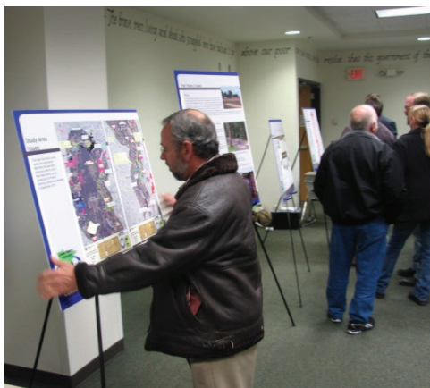
Camp Ridley/Veterans State Trail Open House.

Assist in developing a Master Action Plan and a conservation plan for the 37-acre park; assist in identifying funding sources and other resources for implementation, establishing a volunteer program, developing community participation and support, and connecting with national conservation and recreation partners.