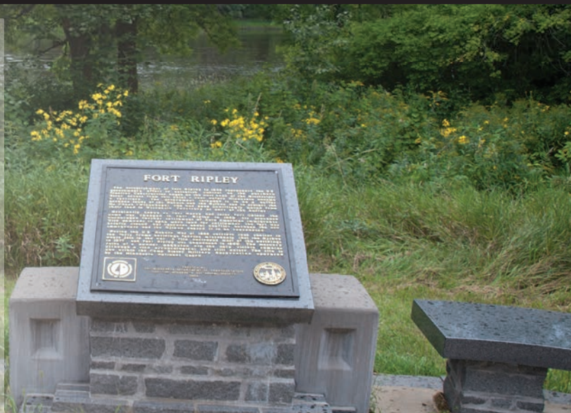
Resting spot along Camp Ripley/Veterans State Trail.