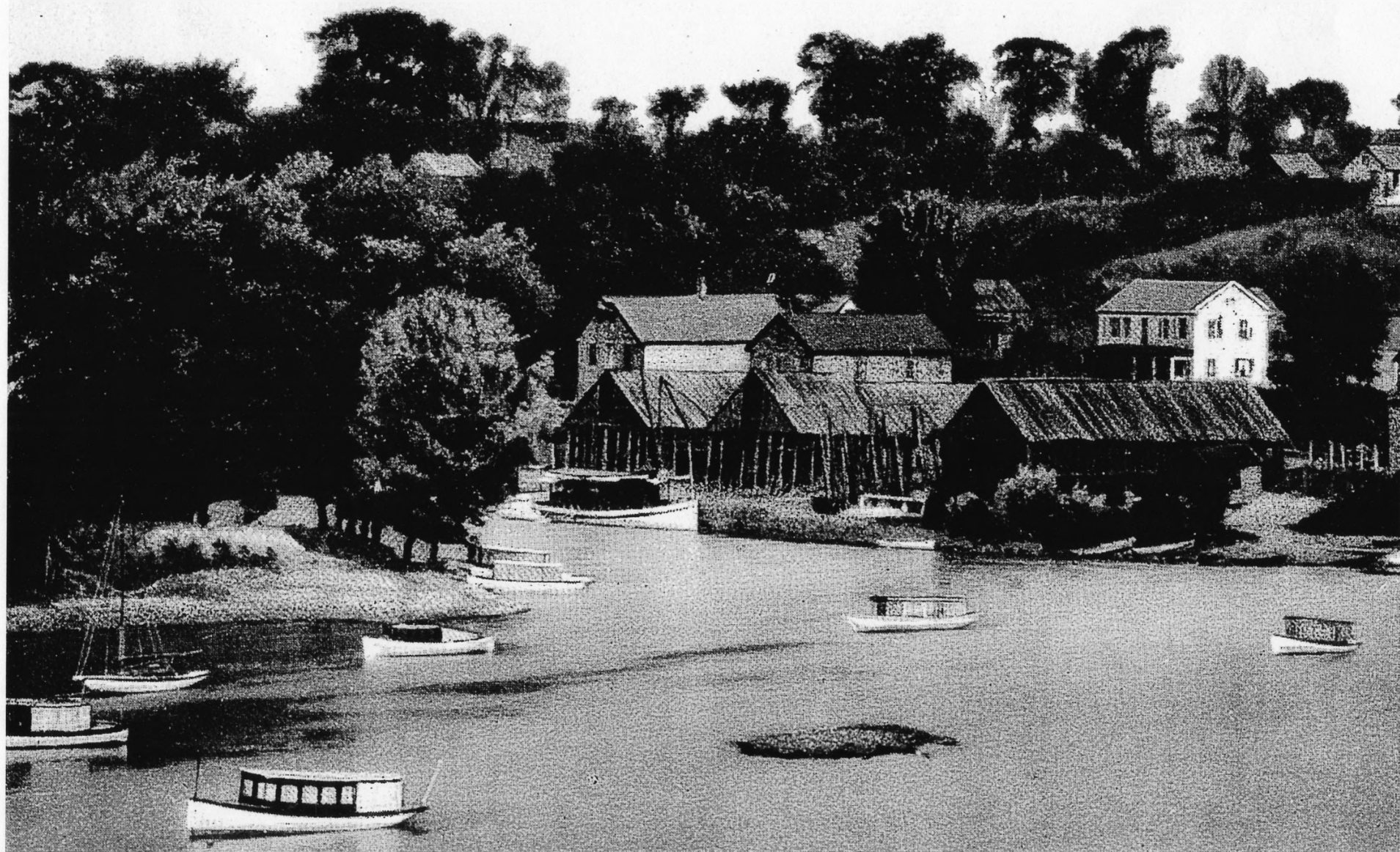
Vergennes, Vt. - Otter Creek from Bridge