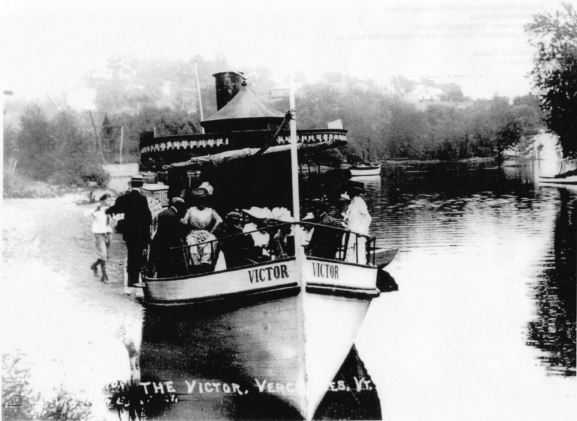
THE VICTOR, VERMONT, VT.