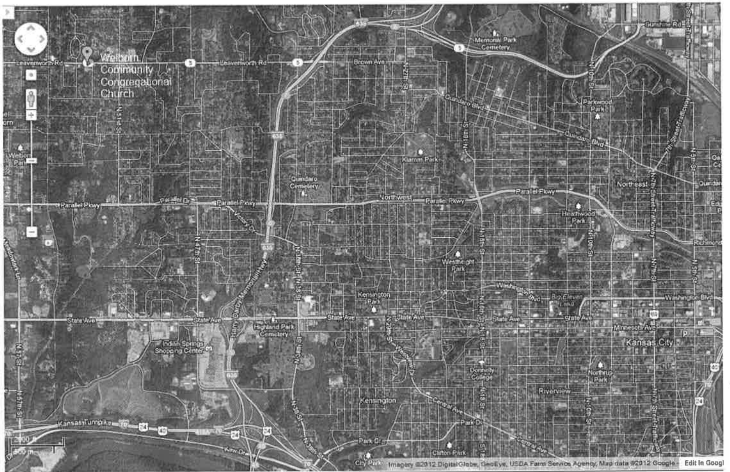
Figure 3: Google Contextual Map

Welborn Community Congregational Church 5217 Leavenworth Road, Kansas City, Wyandotte County, KS Latitude / Longitude: 39.14267 / -94.70079 Datum: WGS84