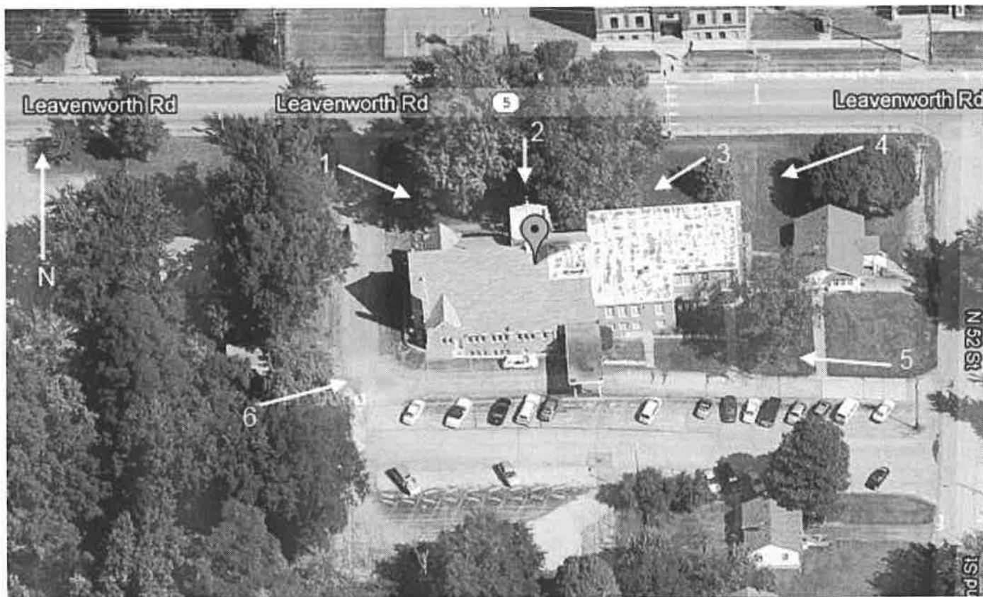
Figure 4: Exterior Photograph Directions (1 through 6)