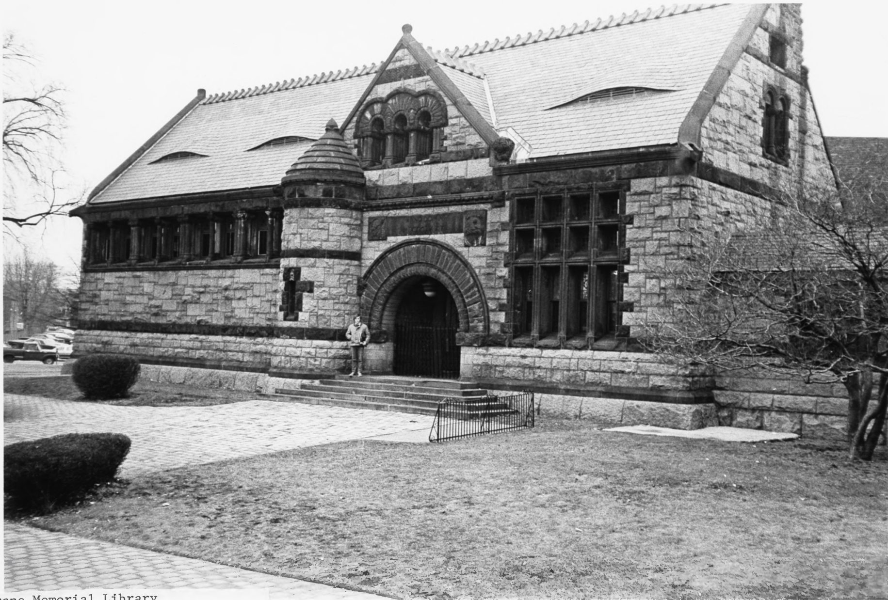
Crane Memorial Library Quincy, Massachusetts South facade