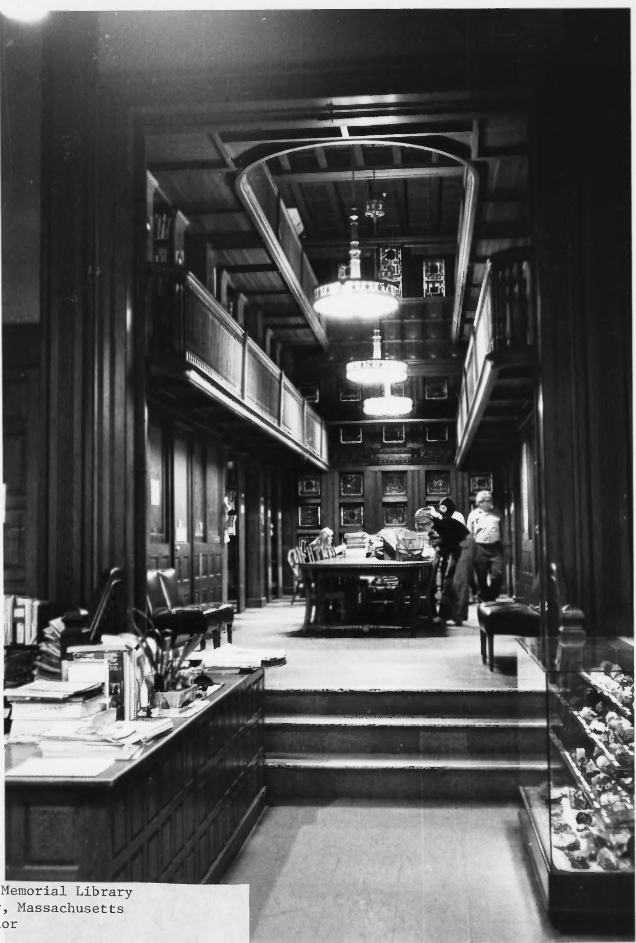
Crane Memorial Library Quincy, Massachusetts Interior