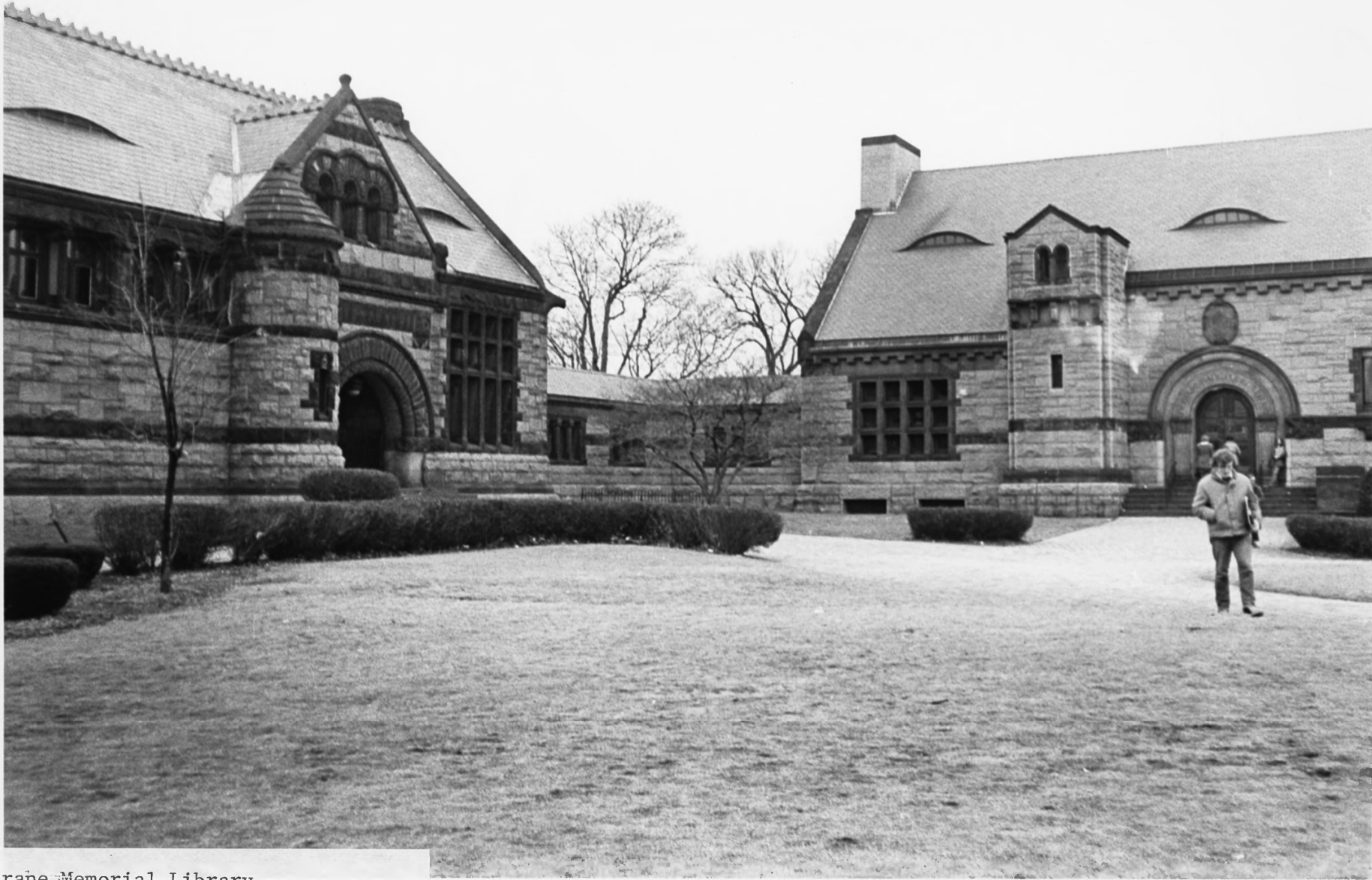
Crane Memorial Library Quincy, Massachusetts South facade and 1908 wing