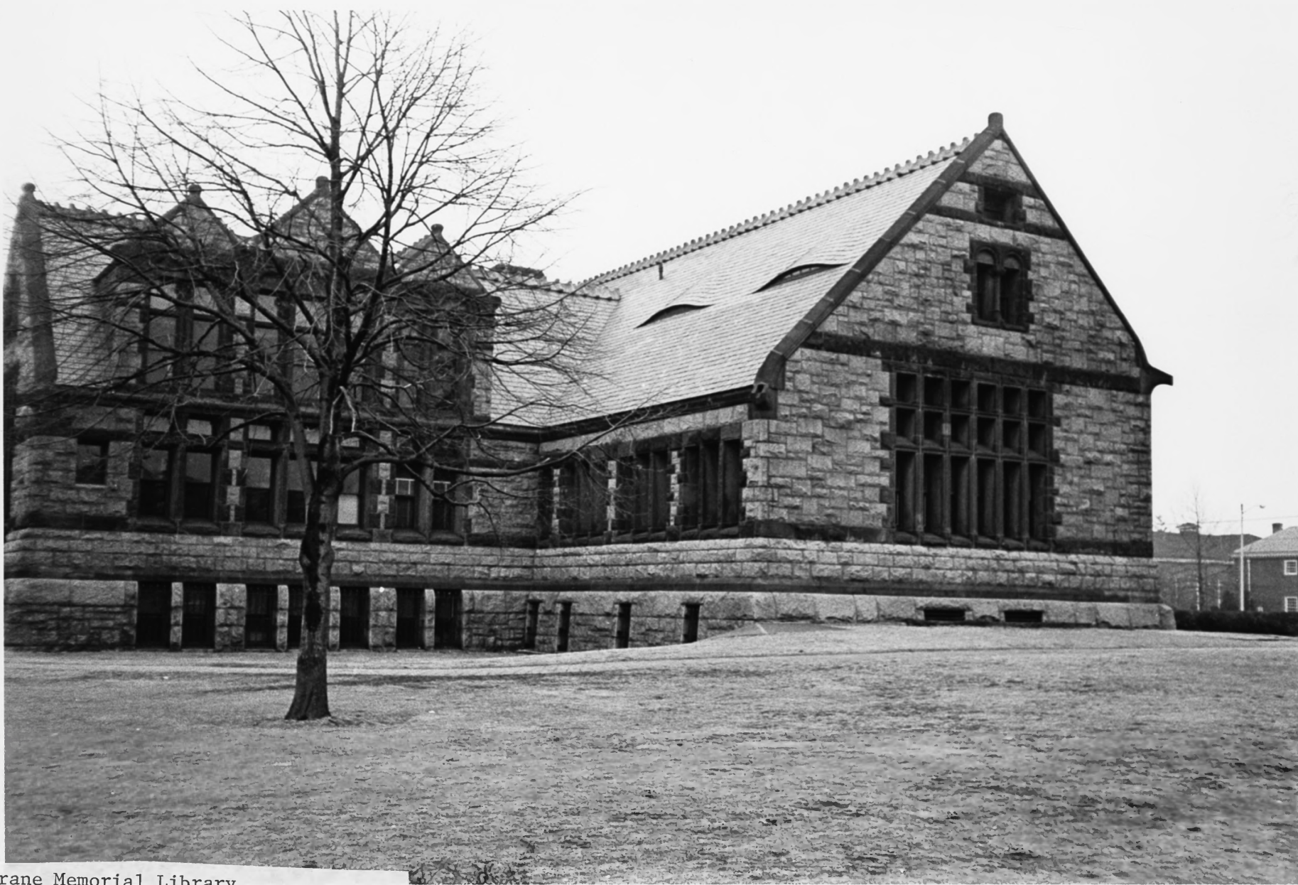
Crane Memorial Library Quincy, Massachusetts North Wing