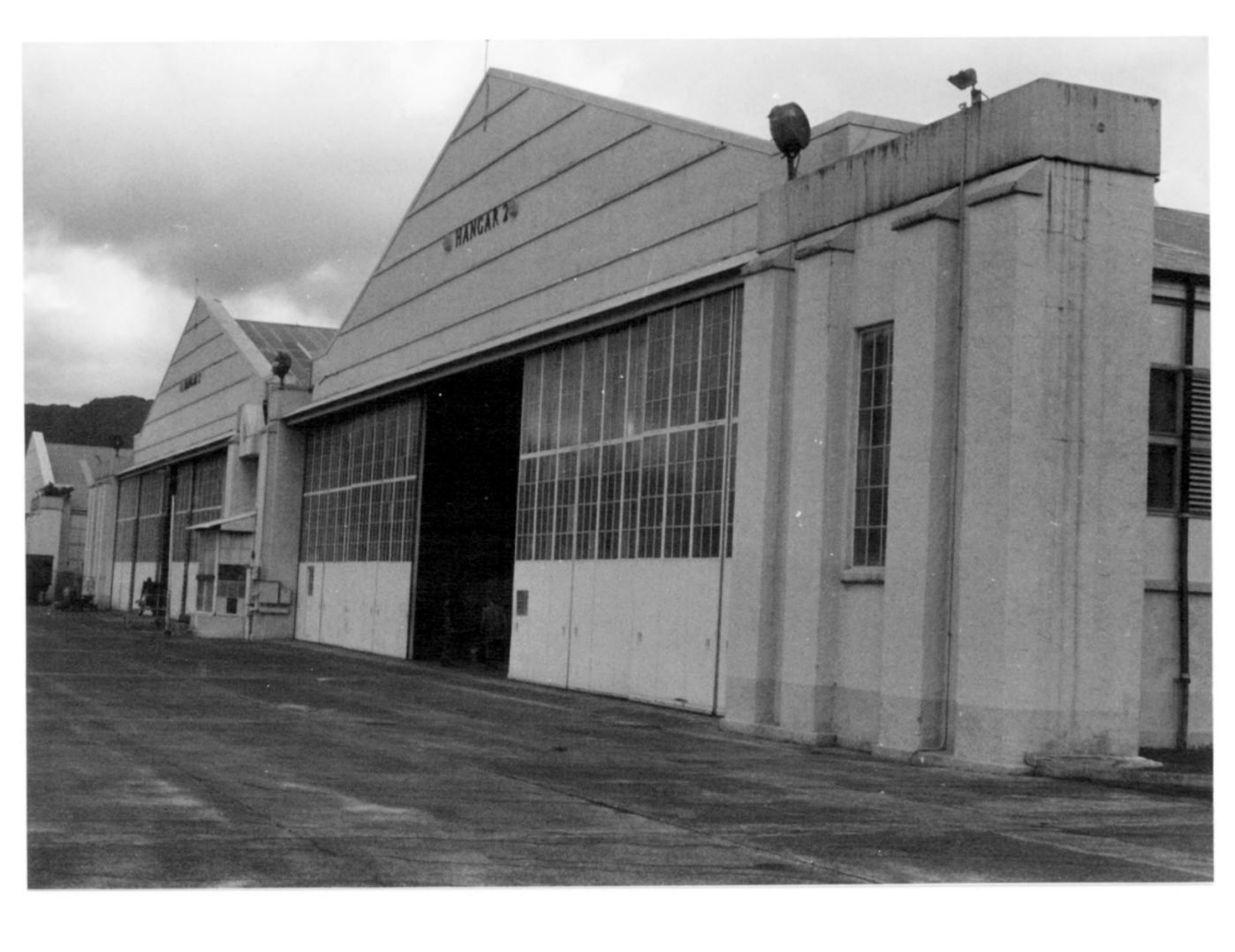
Hangars at Wheeler Air Force Base today.