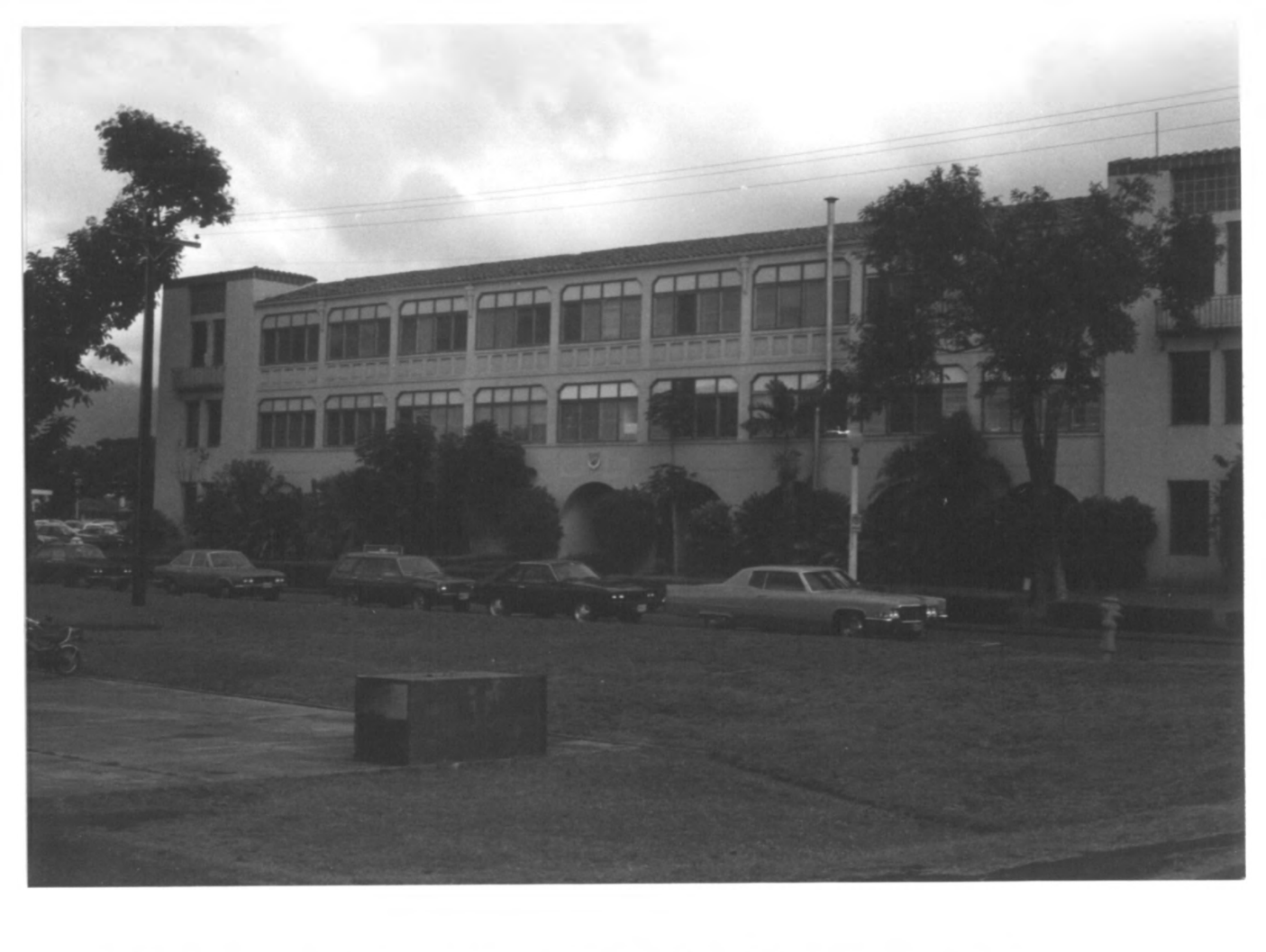
Enlisted men's barracks, Wheeler Air Force Base, 1983.