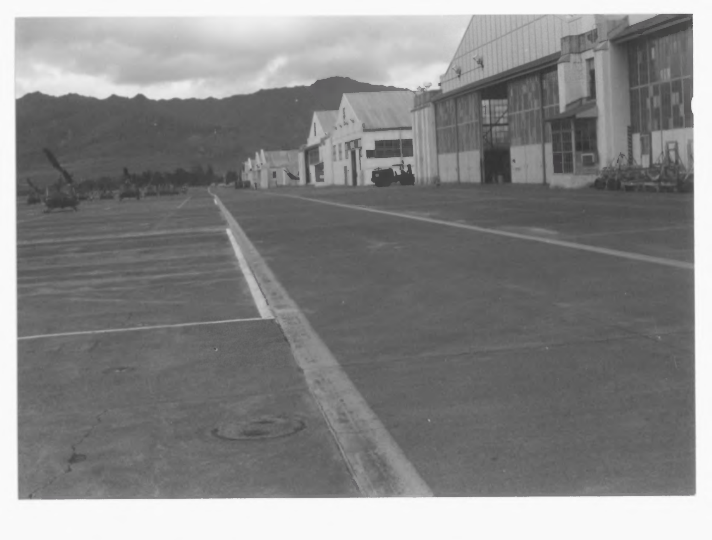
The flight line and hangars, Wheeler Air Force Base, 1983