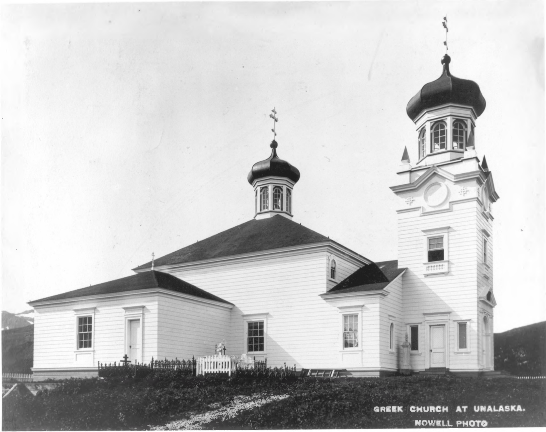
GREEK CHURCH AT UNALASKA.