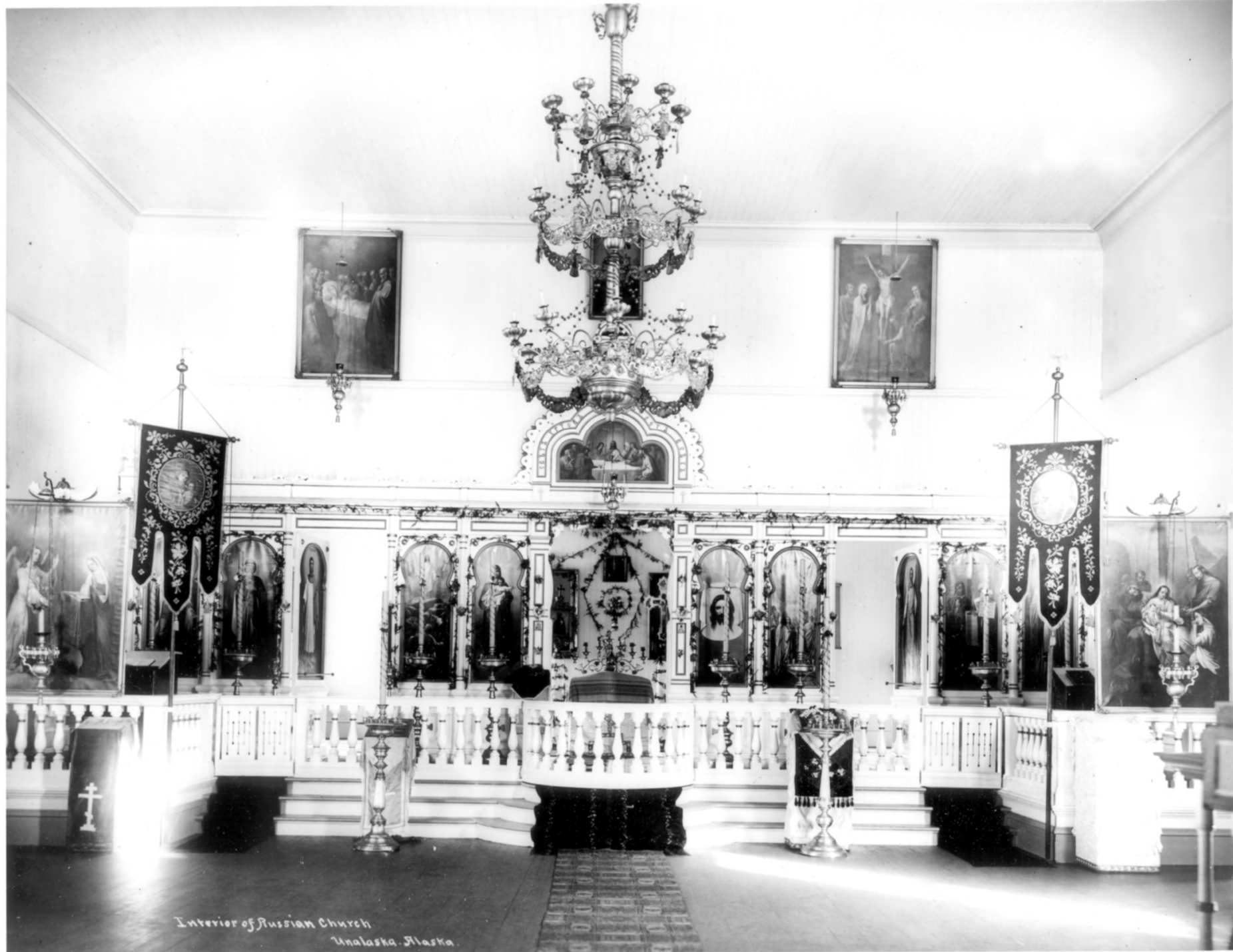
Interior of Russian Church Unalaska, Alaska.