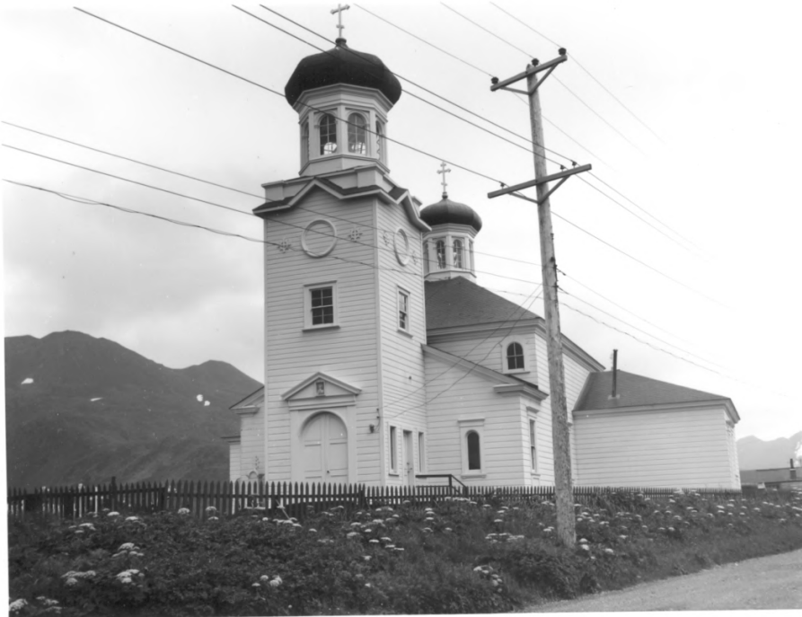
1825- Orthodox Russian Church, 1894 Unalaska, Alaska