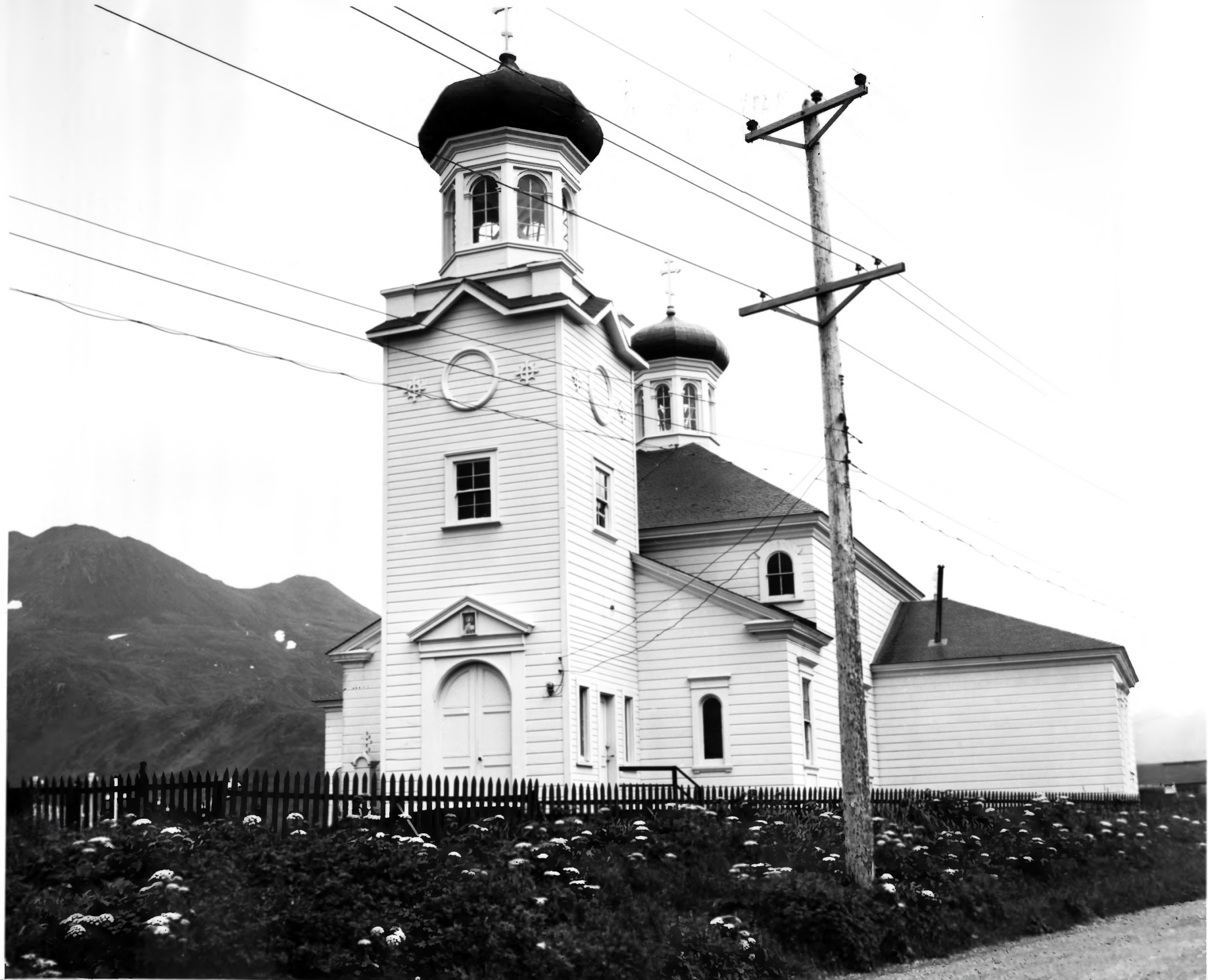
Russian Orthodox Church, Unalaska, Alaska