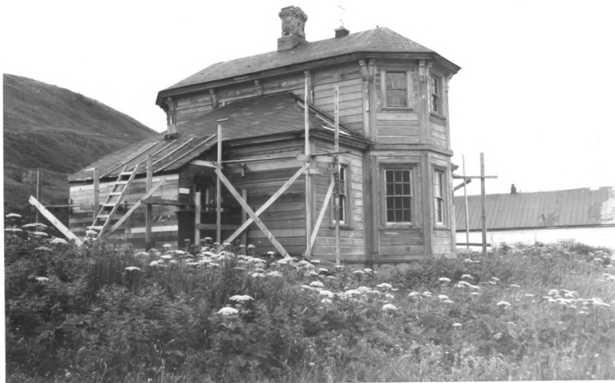
Russian School House, standing in photo of May, 1884 Unalaska, Alaska