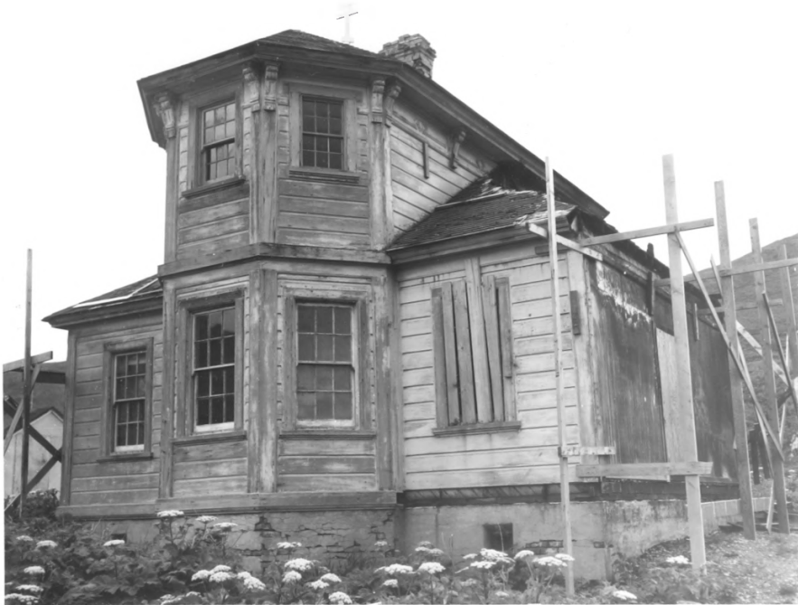
Russian School House building standing in photo of May, 1884 Unalaska, Alaska