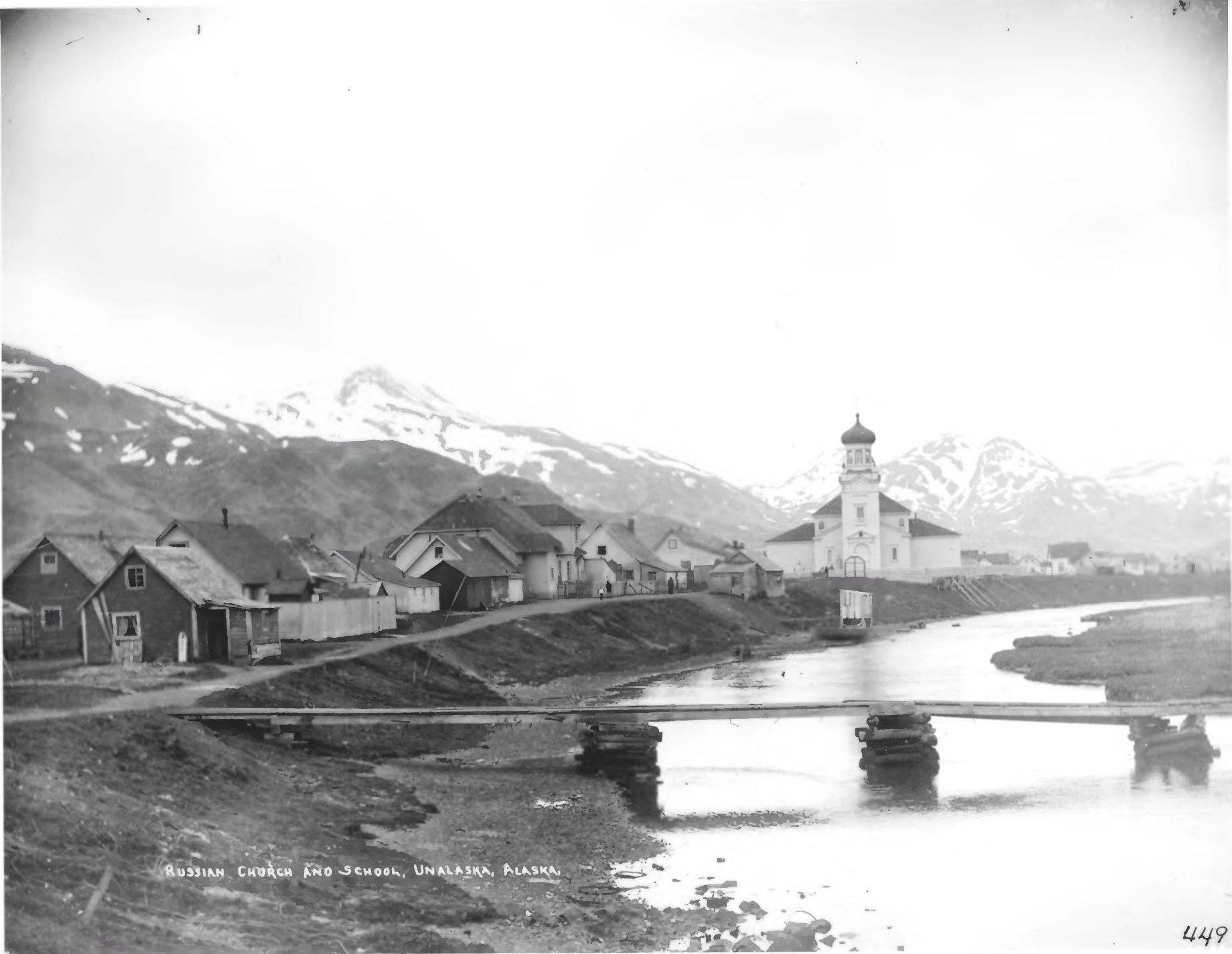
RUSSIAN CHURCH AND SCHOOL, UNALASKA, ALASKA