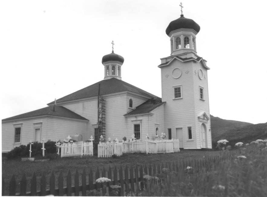
1825- Orthodox Russian Church, 1894 ^ Unalaska, Alaska