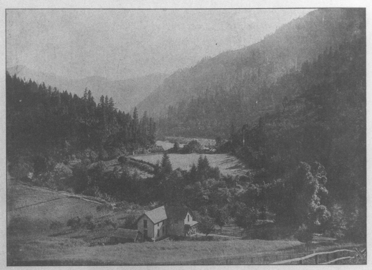
BILLINGS-Junction of Mule Creek and Rogue River