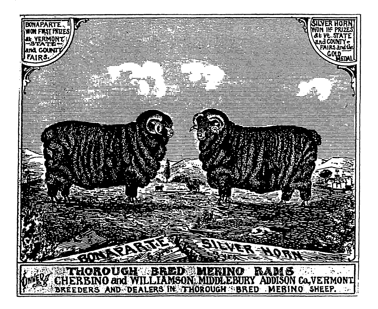
Figure 3 - Illustration of Bonaparte and Silverhorn bred by Cherbino and Williamson, pictured in H.W. Burgett's <u>Illustrated</u>, <u>Topographical</u>, and <u>Historical Atlas of the State of Vermont</u>, H.W. Burgett and Co., New York, 1876.

Glen Dale Cornwall, Addison County, Vermont