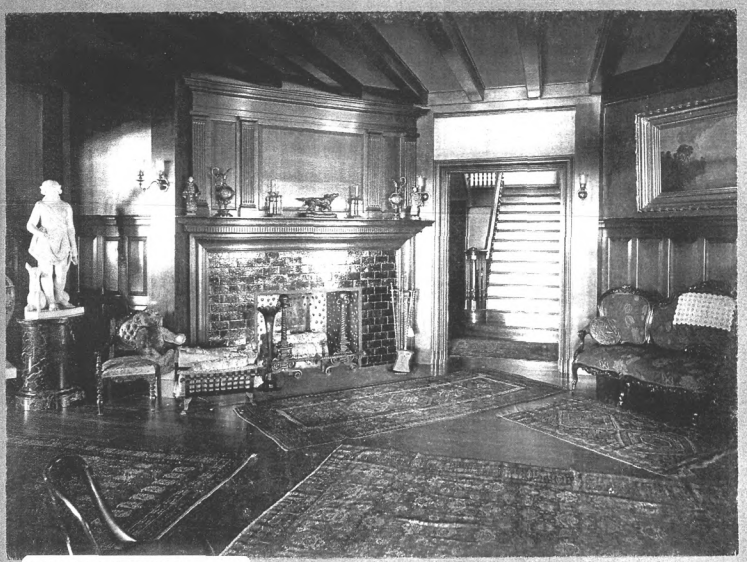
Dickinson Estate Historic District Brattleboro, Windham Co., Vermont Historic photograph, c. 1907 Mainsion Interior, Property #1