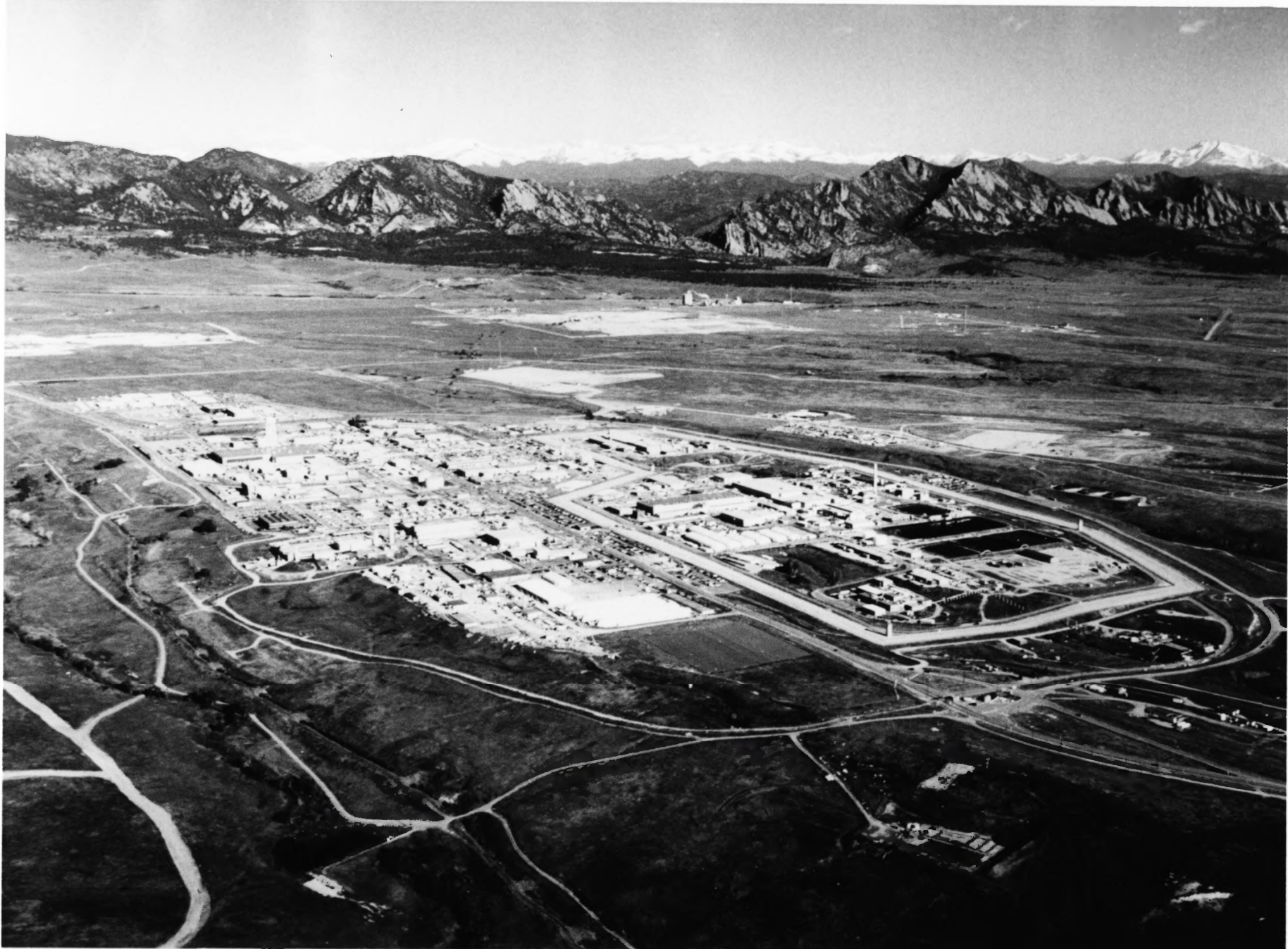
Photo #1 - View to the Northwest, Rocky Flats Environmental Technology Site (Neg. #47906-01, 6-27-95)