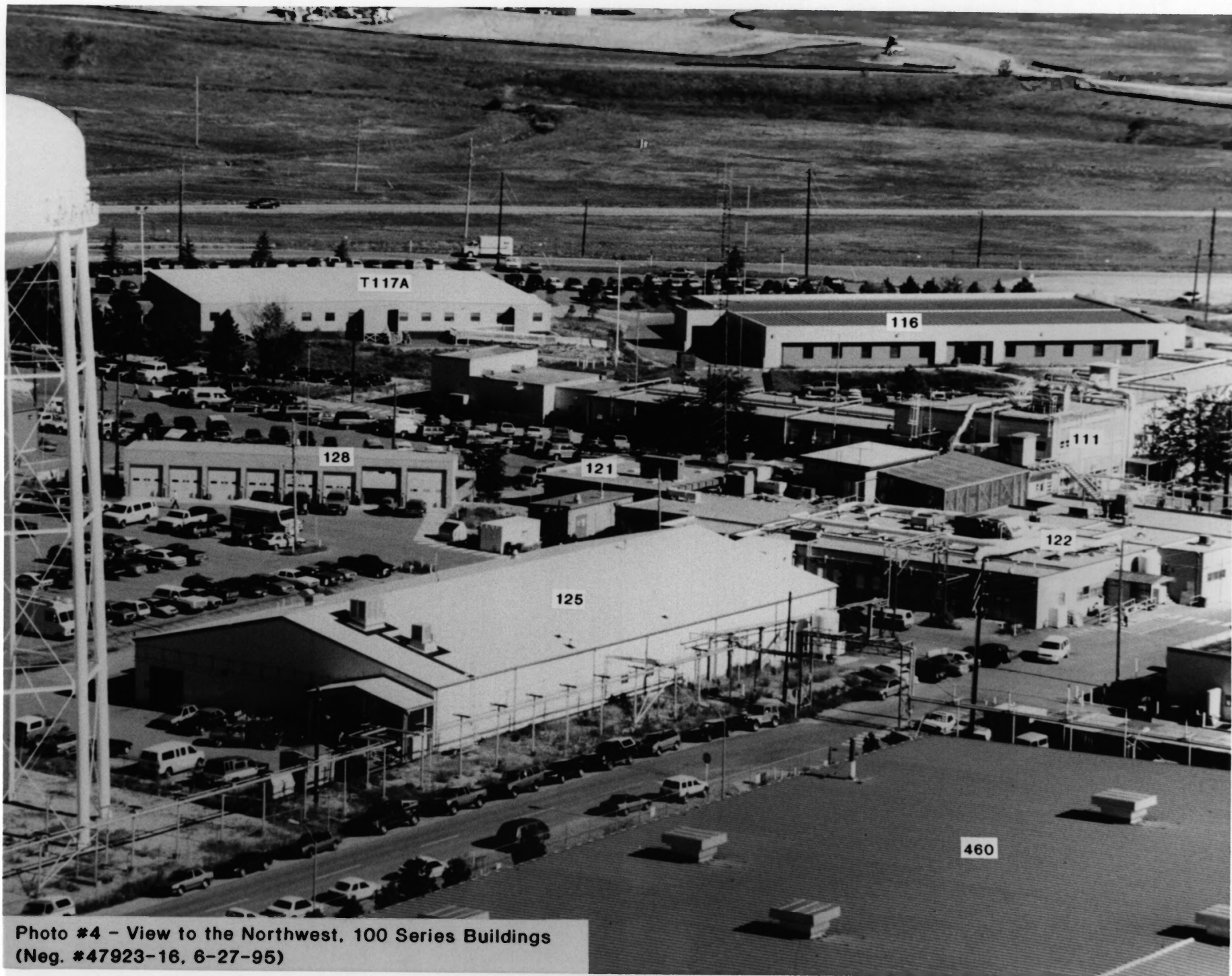
Photo #4 - View to the Northwest, 100 Series Buildings (Neg. #47923-16, 6-27-95)