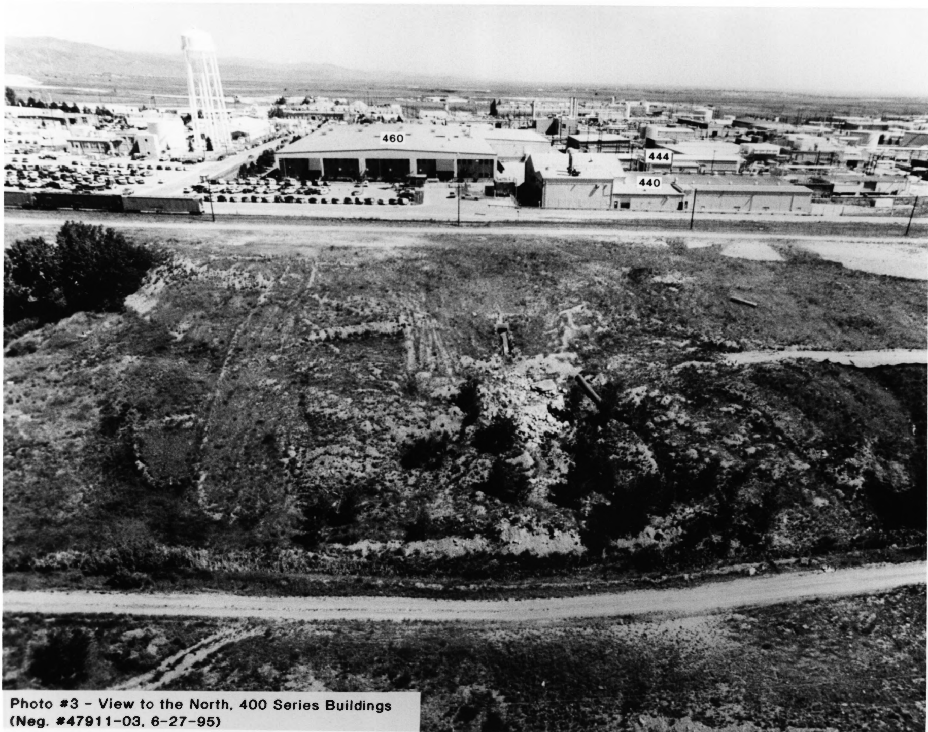
Photo #3 - View to the North, 400 Series Buildings (Neg. #47911-03, 6-27-95)