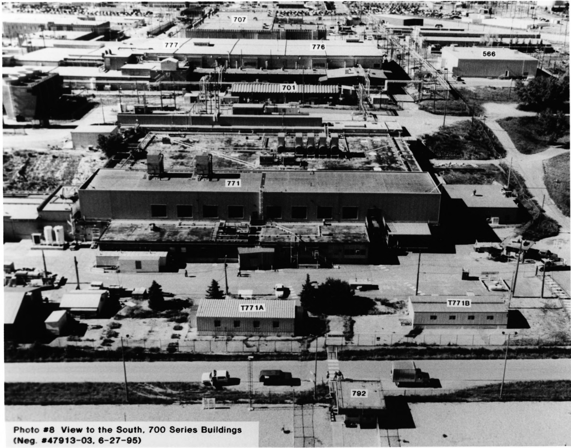
Photo #8 View to the South, 700 Series Buildings (Neg. #47913-03, 6-27-95)