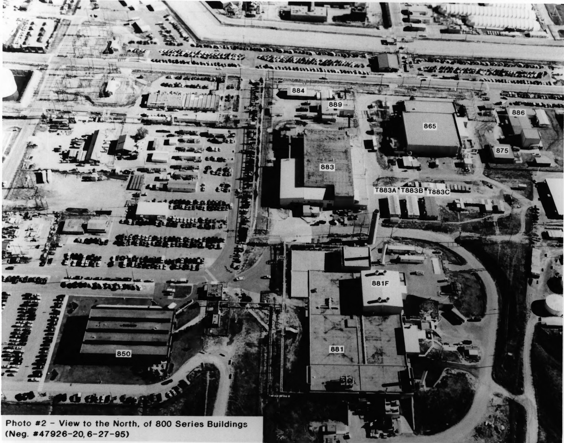
Photo #2 - View to the North, of 800 Series Buildings (Neg. #47926-20, 6-27-95)