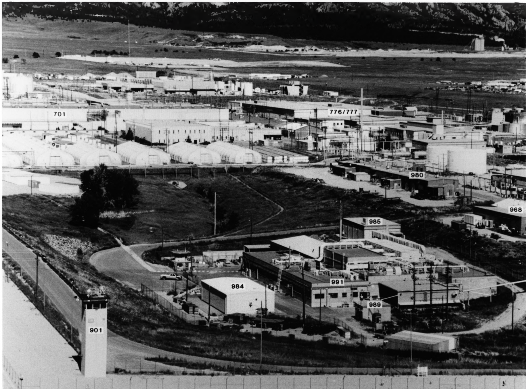
Photo #7 View to the Northwest, 900 Series Buildings (Neg. #47921-08, 6-27-95)