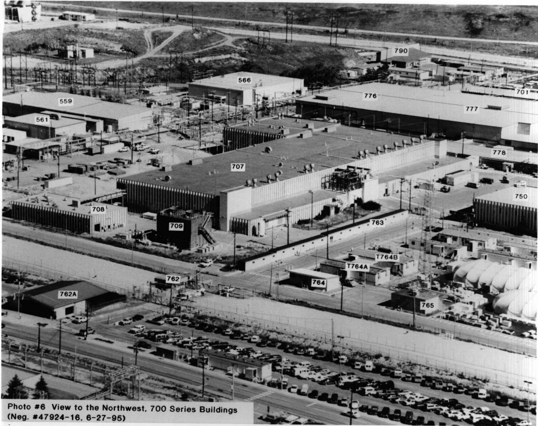
Photo #6 View to the Northwest, 700 Series Buildings (Neg. #47924-16, 6-27-95)