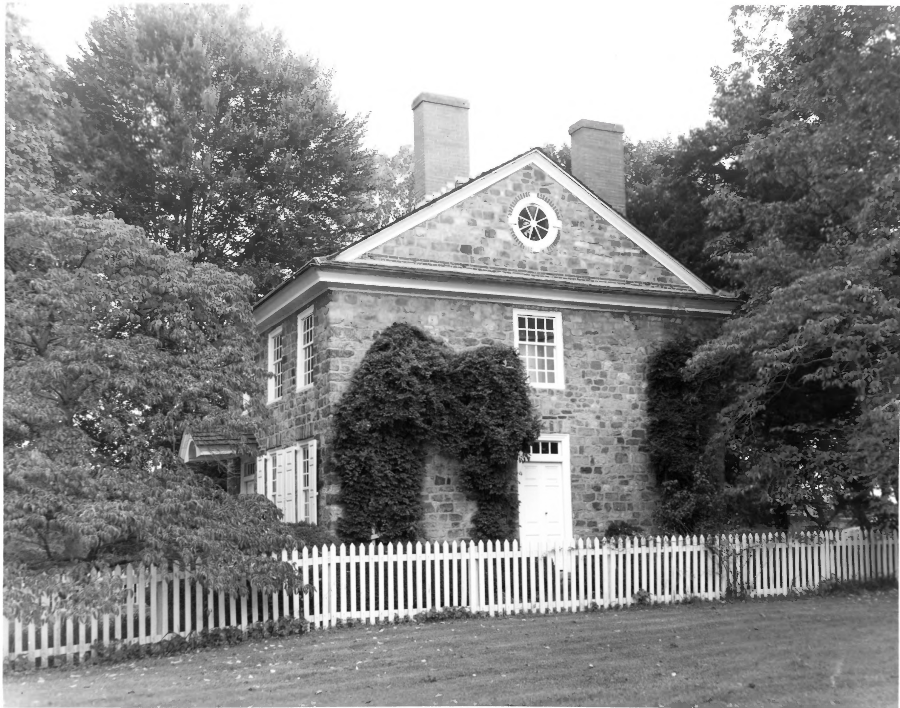
Washington's Headquarters (Potts House), Valley Forge, Pennsylvania