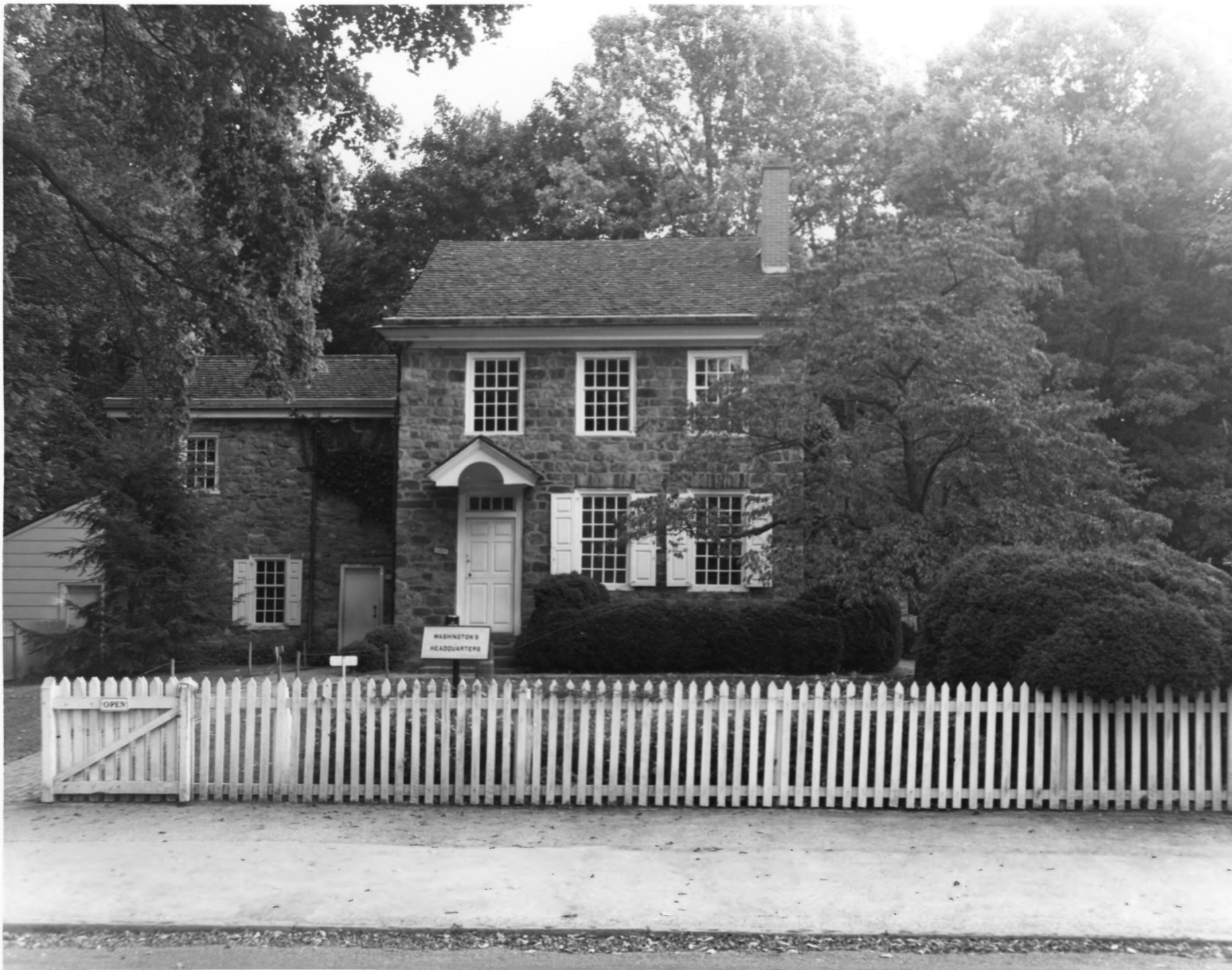
Washington's Headquarters (Potts House), Valley Forge, Pennsylvania