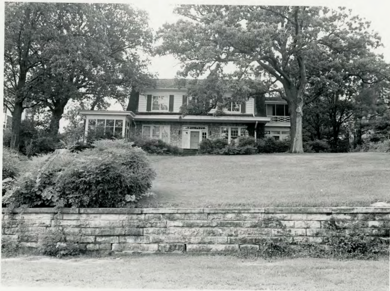
#4 Lawsen House Mount Nord Historic District Fayetteville, Arkansas

Bob Dunn, photographer July, 1981 Negative at AHPP View from the South No. 5 of 6