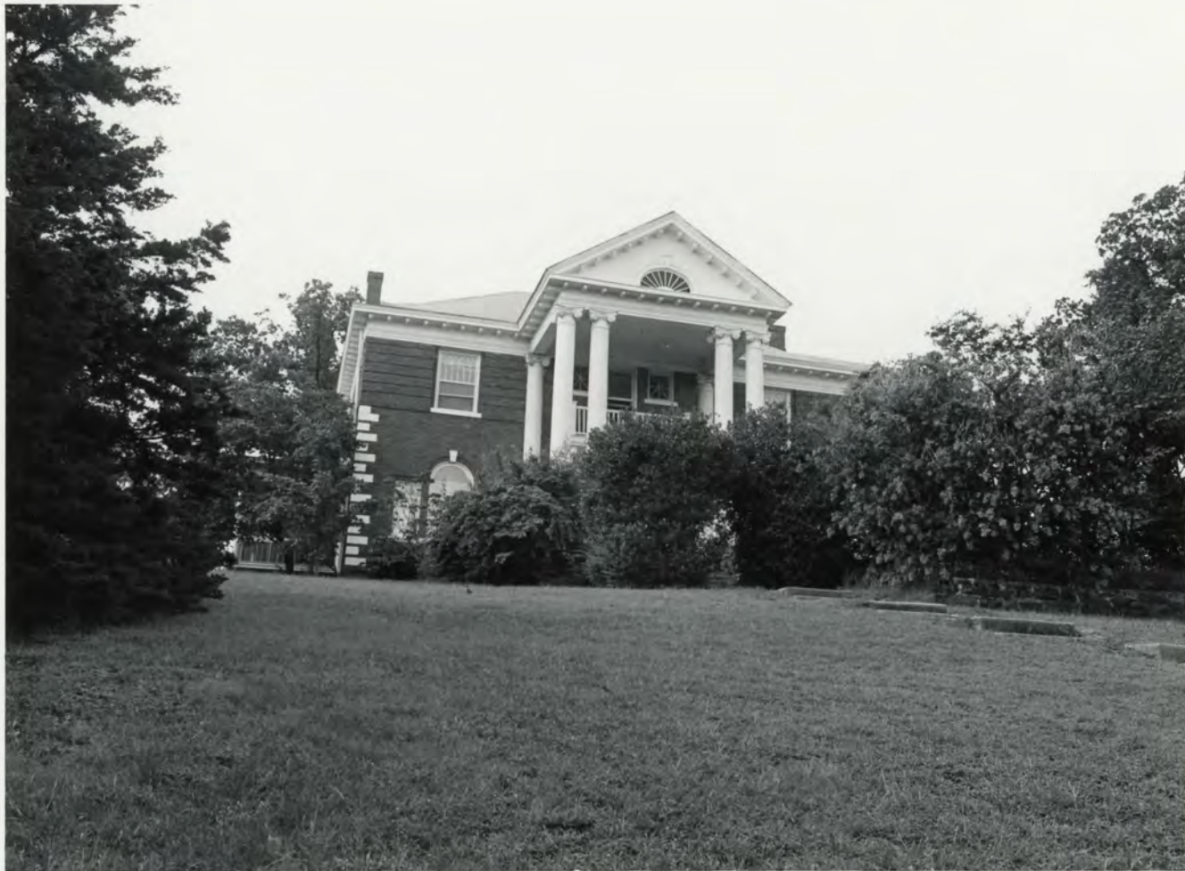
#5 Mock-Fulbright House Mount Nord Historic District Fayetteville, Arkansas

Bob Dunn, photographer July, 1981 Negative at AHP View from the Southwest No. 6 of 6