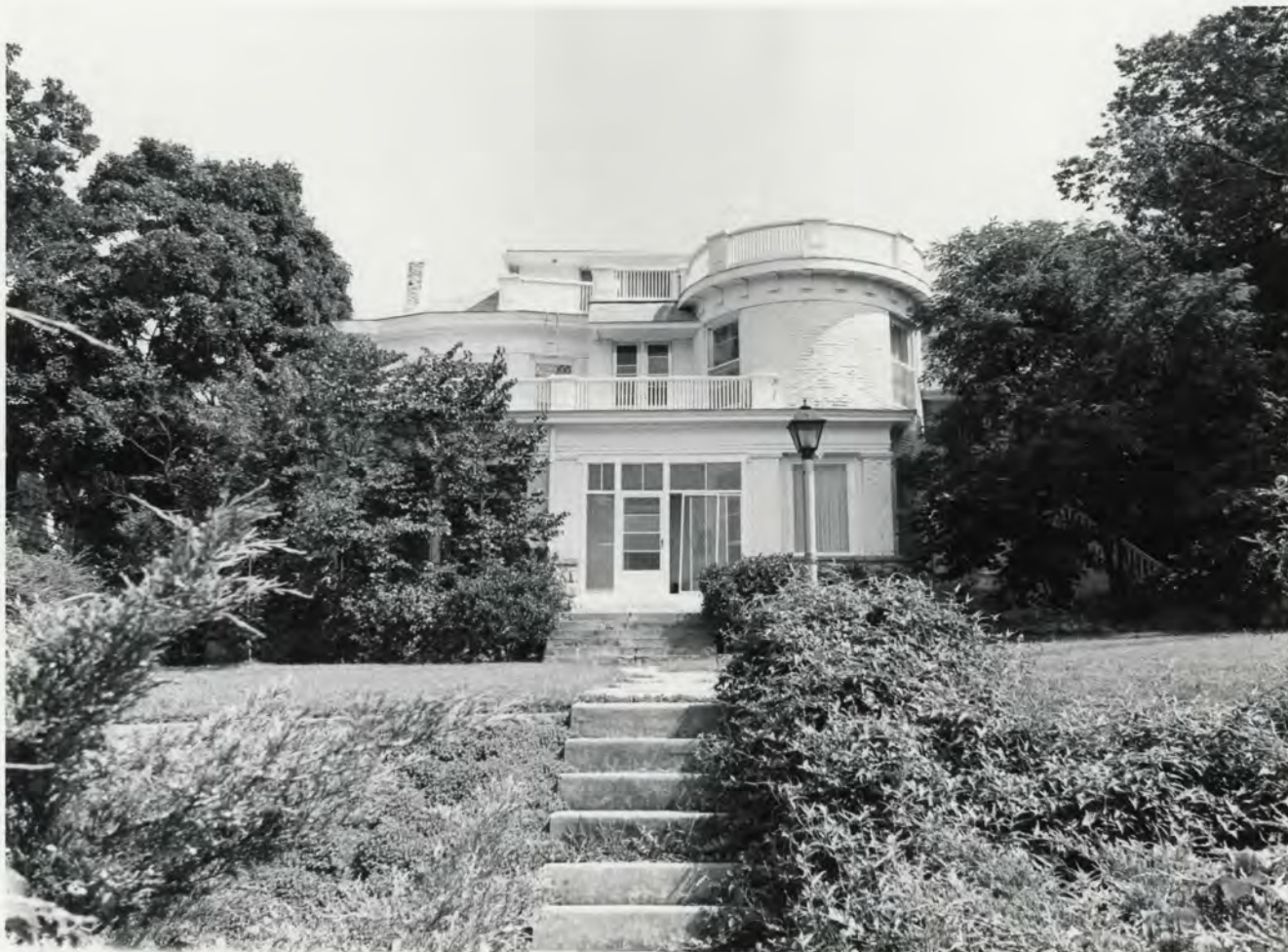
#3 Gulley House Mount Nord Historic District Fayetteville, Arkansas

Bob Dunn, photographer July, 1981 Negative at AHPP View from the South No. 4 of 6