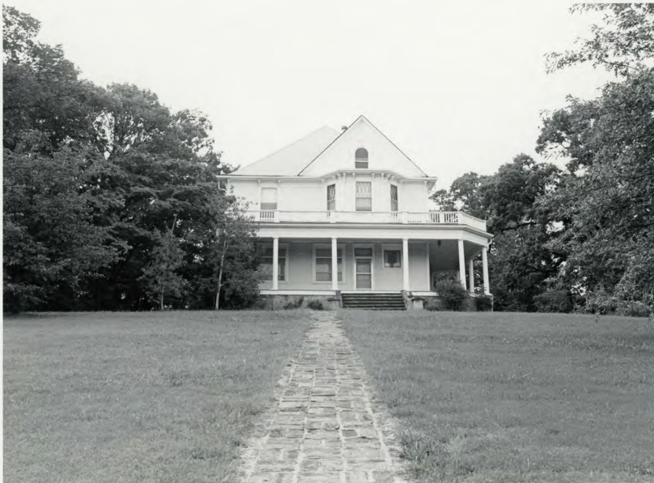
#2, Bohart-Huntington House Mount Nord Historic District Fayetteville, Arkansas

Bob Dunn, photographer July, 1981 Negative at AHPP View from the South No. 3 of 6