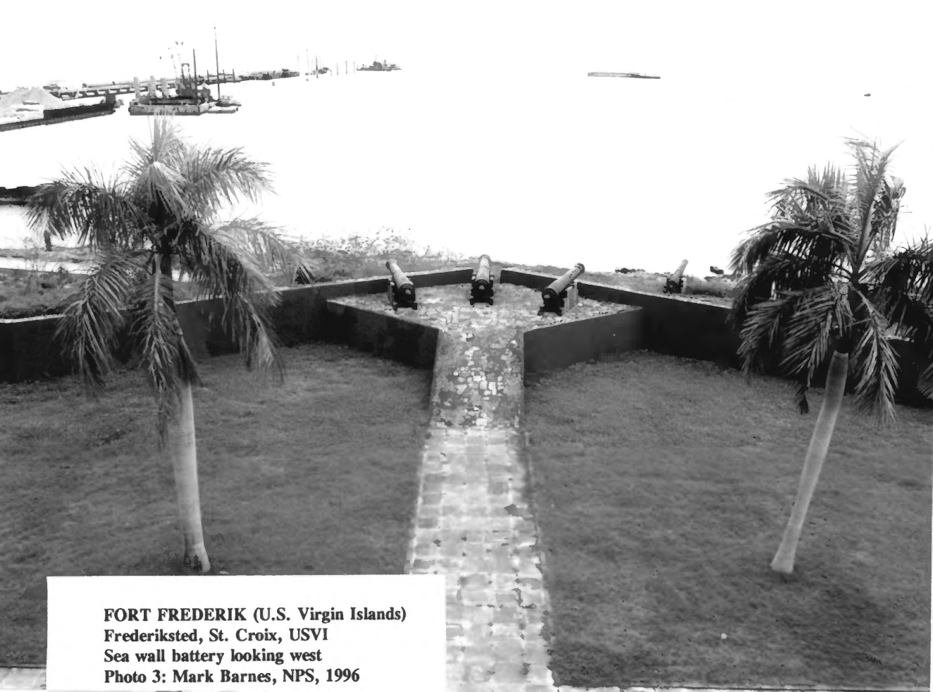
FORT FREDERIK (U.S. Virgin Islands) Frederiksted, St. Croix, USVI Sea wall battery looking west Photo 3: Mark Barnes, NPS, 1996