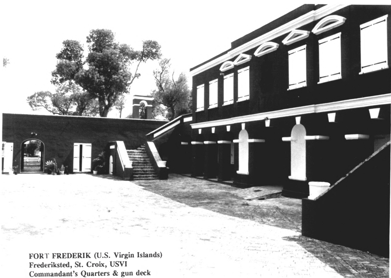
FORT FREDERIK (U.S. Virgin Islands) Frederiksted, St. Croix, USVI Commandant's Quarters & gun deck Photo 1: Mark Barnes, NPS, 1996