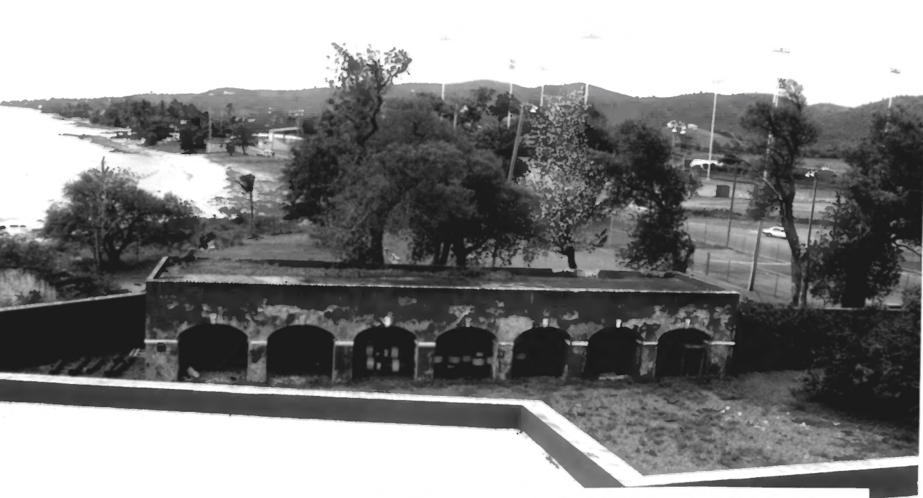
FORT FREDERIK (U.S. Virgin Islands) Frederiksted, St. Croix, USVI Stables from north long wall gun deck Photo 4: Mark Barnes, NPS, 1996