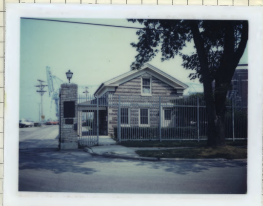
PHOTO TAKEN LOOKING EAST FROM S. WISLONIA STREET. ENTRANCE TO POWER PLANT AT LEFT.