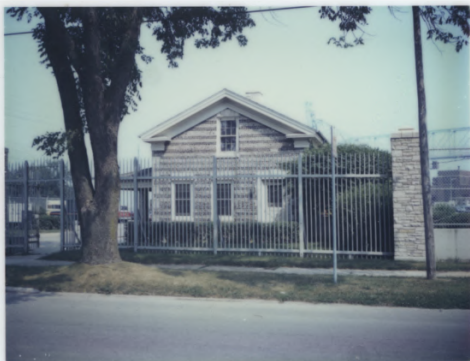
PHOTO TAKEN LOOKING EAST FROM WISCONSIN STREET.