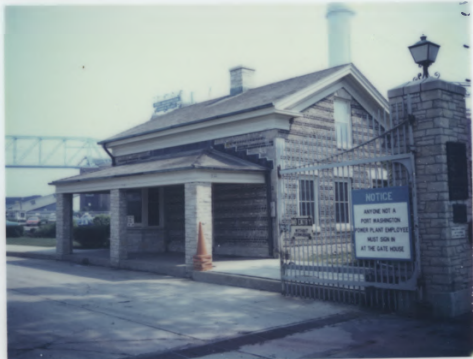
PHOTO TAKEN LOOKING SOUTHEAST AT POWER PLANT ENTRANCE ON S. WISCONSIN STREET.