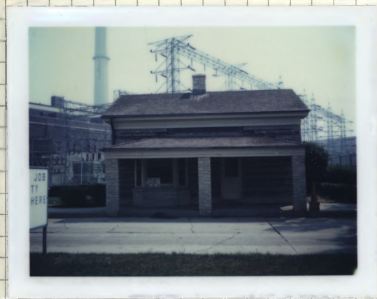
PHOTO TAKEN LOOKING SOUTH, OPPOSITE POWER PLANT DRIVEWAY ENTRANCE ON NORTH SIDE OF BUILDING