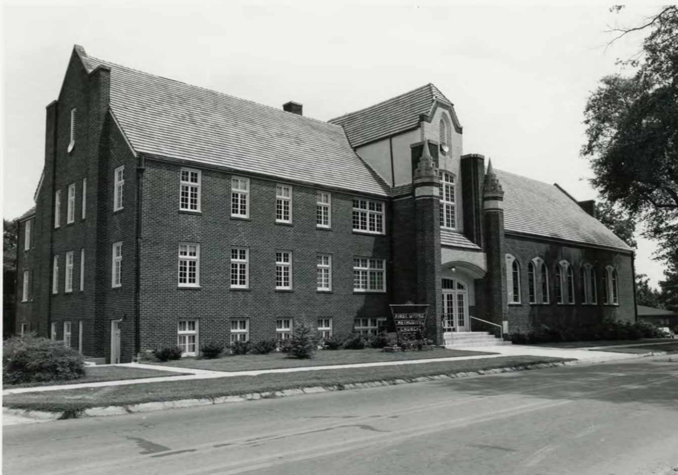
DA-28 First United Methodist Church June 19, 1982 Negative on file at the AHPP View from the Northwest